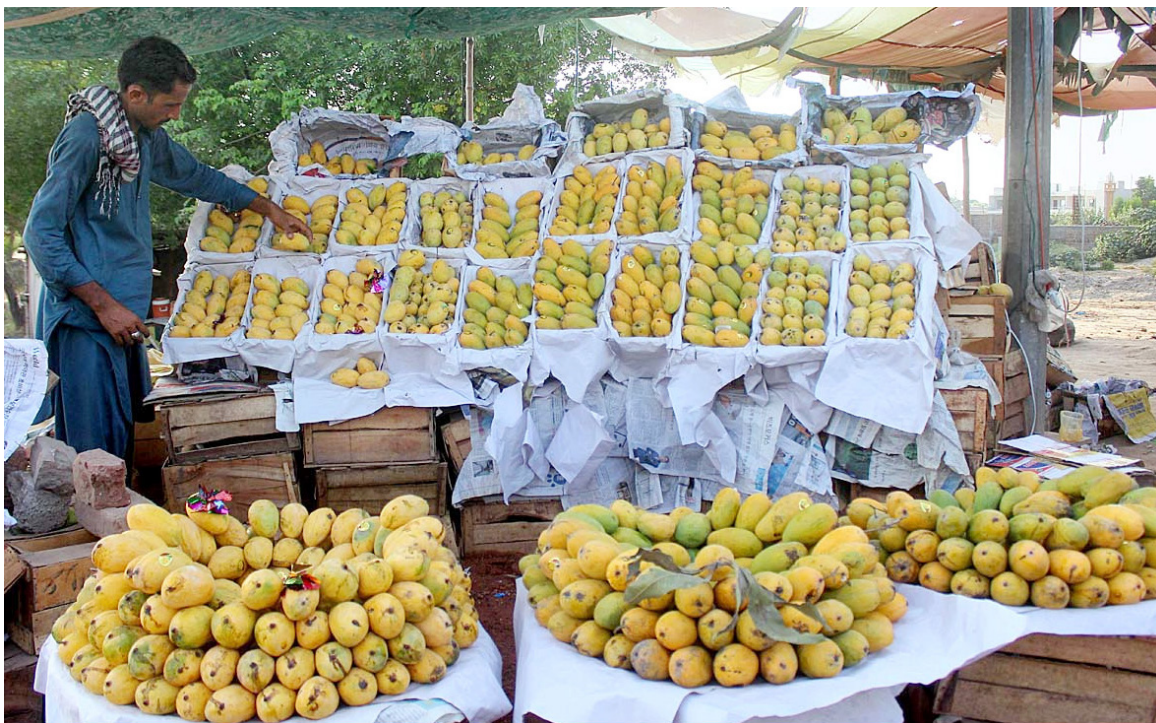
MULTAN: A vendor arranging and displaying seasonal fruit mango to attract customers.

The airline has encountered scores of incidents involving passengers testing positive for the coronavirus onboard.