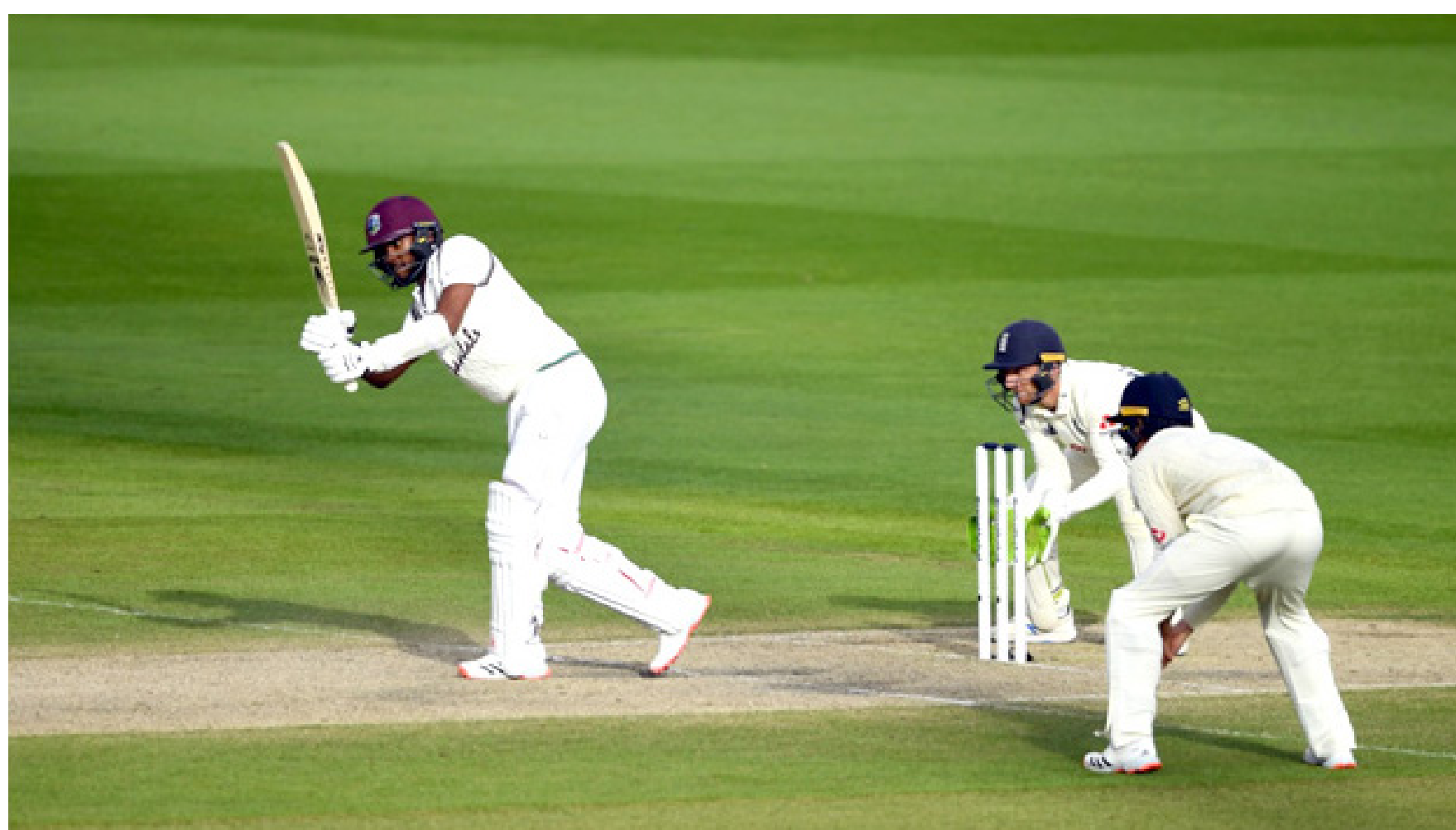
MANCHESTER: Carlos Brathwaite of West Indies plays a shot during fourth day of second test match against England.

LONDON: Mikel Arteta hopes Arsenal's run to the FA Cup final can persuade Wembley hero Pierre-Emerick Aubameyang to stay at the club. Aubameyang underlined his value to Arsenal with a brace in their shock 2-0 win over FA Cup holders Manchester City in the semi-final on Saturday. But the Gabon forward has just a year to run on his contract and has been linked with Barcelona and Paris Saint Germain, with talks over a new deal to stay at Arsenal yet to produce an extension. The 31-year-old has admitted he has a big decision to make over his future. But Arsenal boss Arteta is confident his team's improved form and their forthcoming FA Cup final appearance could be enough to convince Aubameyang to stay. – APP