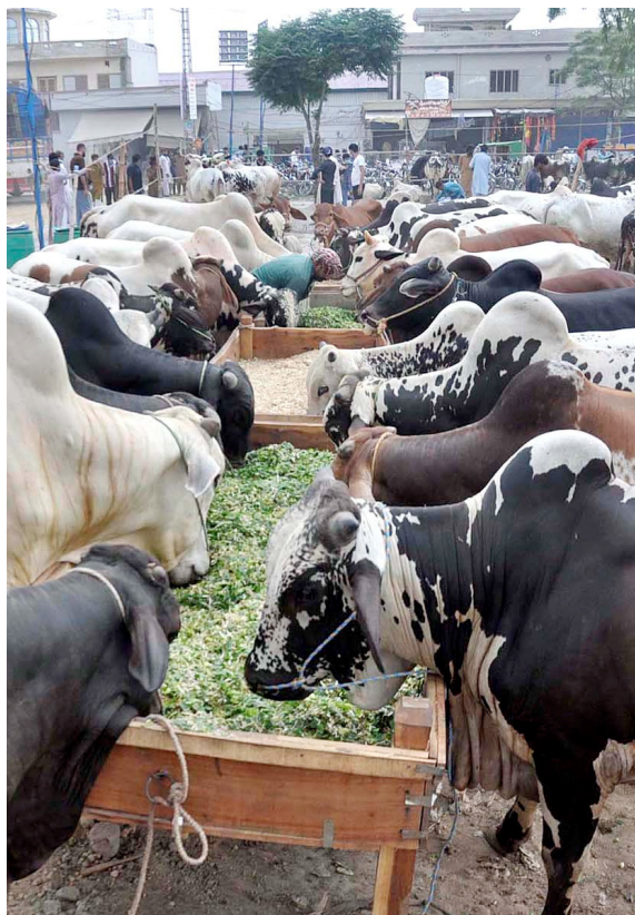
ISLAMABAD: Vendors displaying sacrificial animals to attract the customers ahead of Eid in animal market.