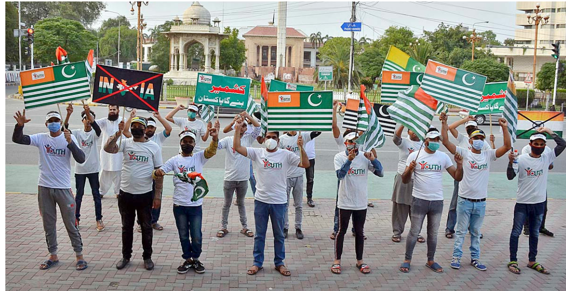
LAHORE: Members of civil society holding a rally on the Yaum-e-Ilhaq-e-Pakistan on Sunday.