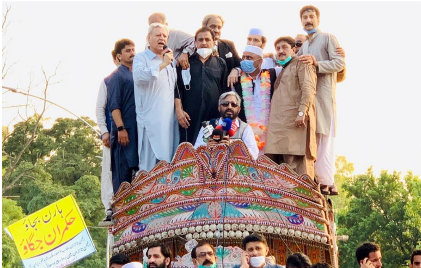
ISLAMABAD: Members of traders community holding a rally in Islamabad to press for their demands. The traders demanded opening of restaurants and marriage halls.