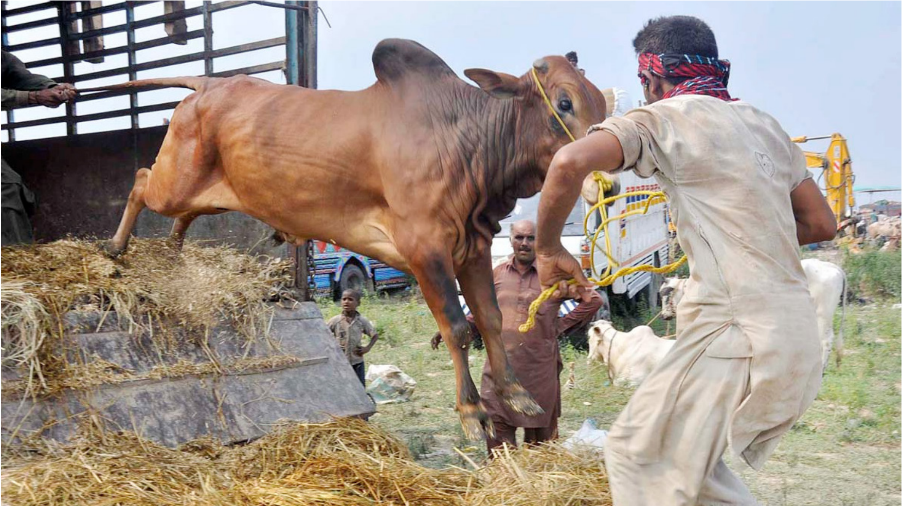
ISLAMABAD: Vendors unloading sacrificial animals from vehicle at Sacrificial Animal Market near Kohinoor Mills.