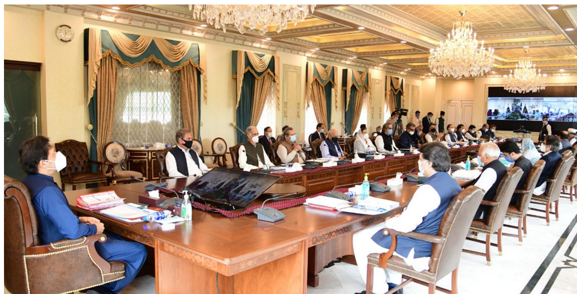
ISLAMABAD: Prime Minister Imran Khan chairs Cabinet meeting.