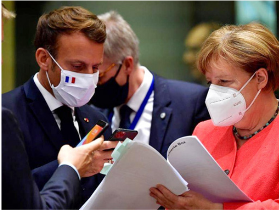
Union were “jointly enforcing our economies against the crisis.” The commission also agreed to a core budget of 1.1

crises.” It would provide hundreds of billions of dollars in grants and loans to member states. The agreement came after days of deadlock and fractious talks that were described as some of the most bitterly divided in years. “We did it! Europe is strong. Europe is united,” European Council President Charles Michel said at a press conference Tuesday. “This is a good deal, this is a strong deal, and most importantly, this is the right deal for Europe right now.” Michel described the occasion as the first time that members of the European