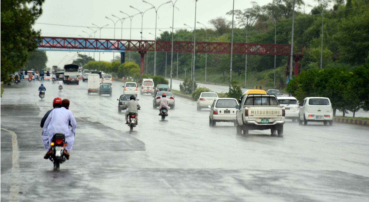
ISLAMABAD: Motorists heading to their destinations at Kashmir Highway during rain.

have to find new markets to boost exports. Africa is a continent of more than fifty countries. Pakistan's trade volume with African countries is only close to 3 billion dollars, which could be doubled in the next three years. He said that an increase in trade in food, textile and pharmaceutical sectors could be made possible. He said that in order to increase Pakistani exports to African countries, new trade avenues would have to be explored.