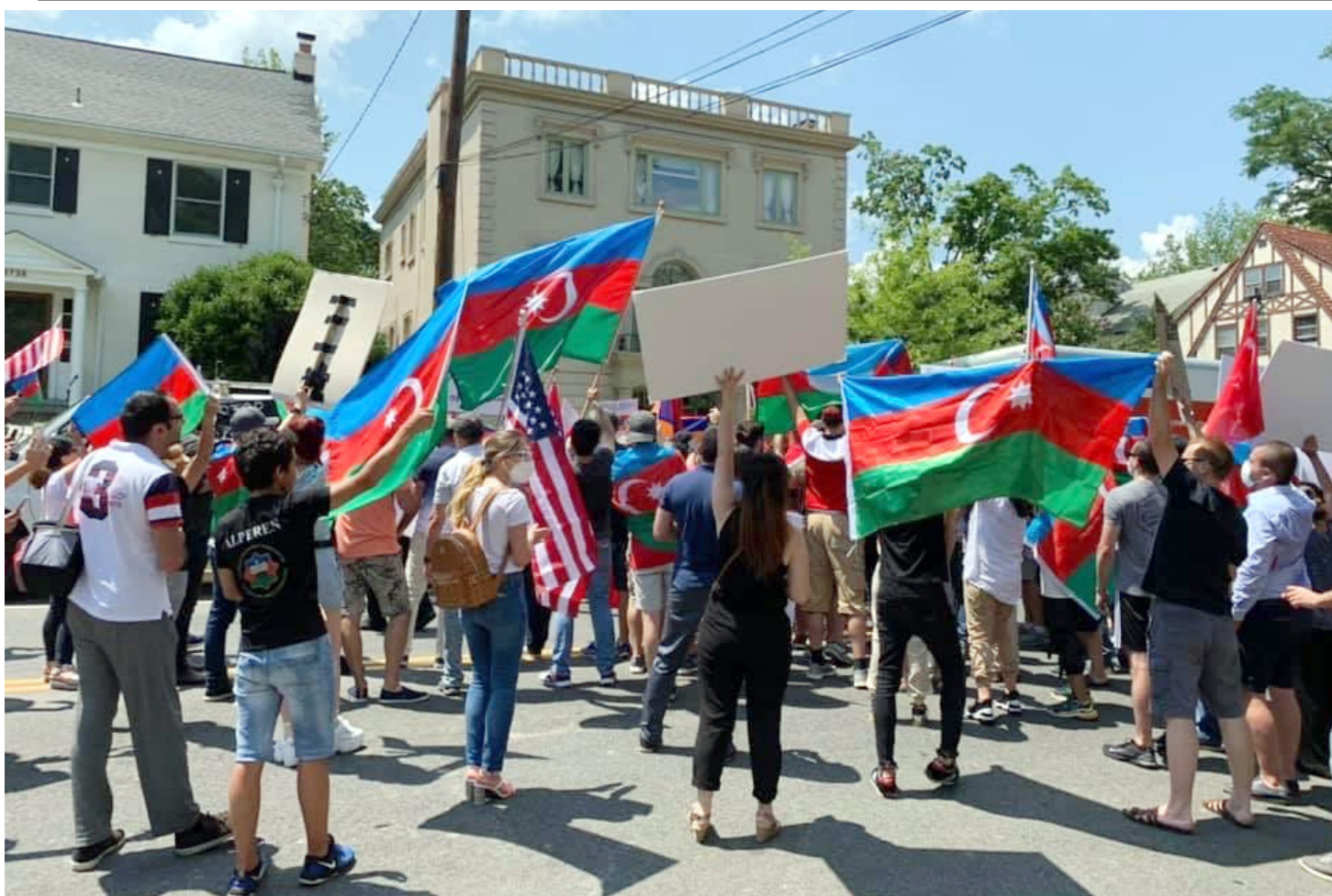
WASHINGTON: Members of Azerbaijani community holding a demonstration against Armenian aggression against innocent Azerbaijani people.