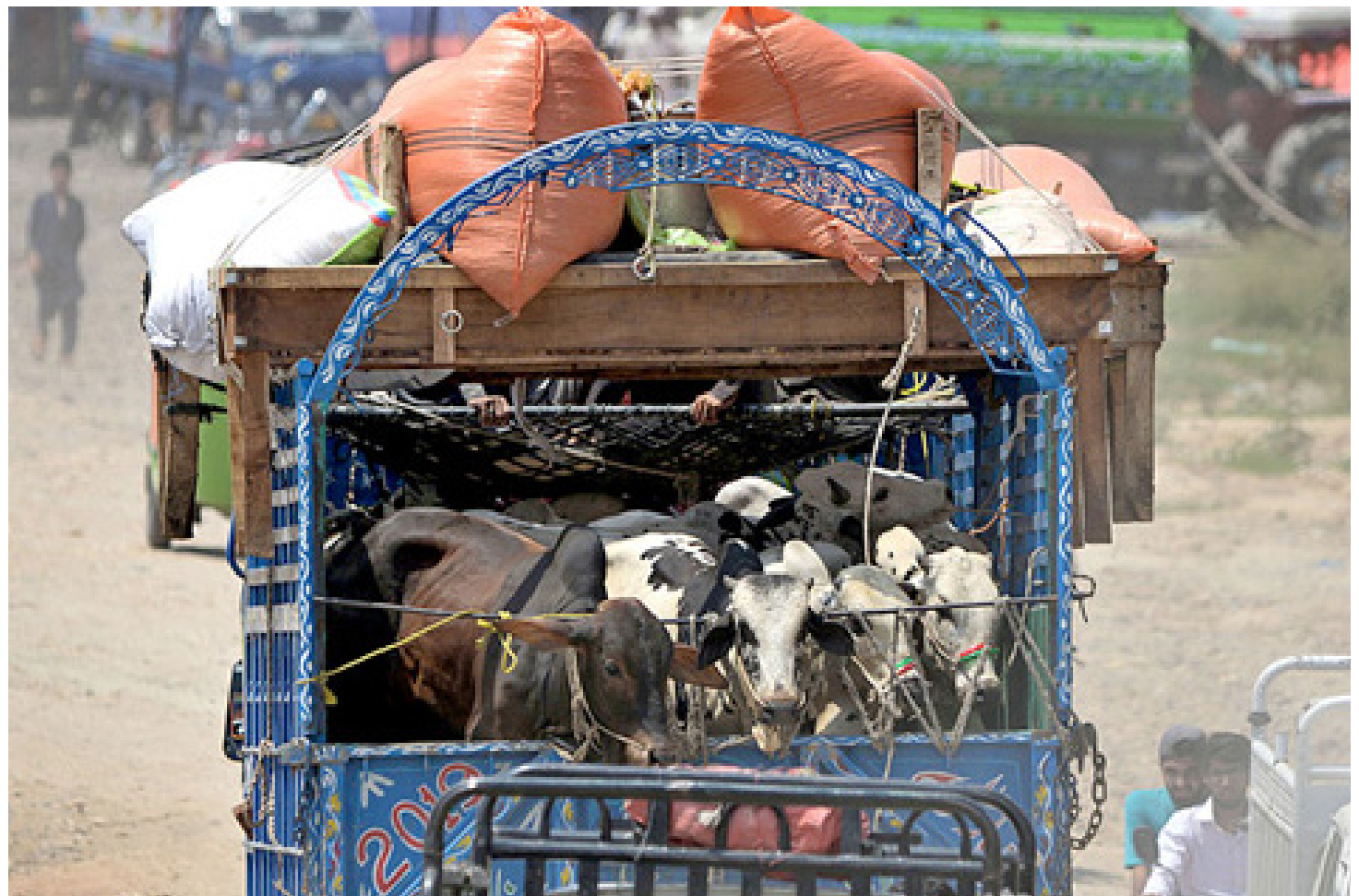
RAWALPINDI: A delivery truck carrying sacrificial animals to livestock market at Misrial Road.

Case has been registered against him at Tarnol police station and further investigation id underway from him. IGP Islamabad and DIG (Operations) have appreciated the performance of CIA Police team and announced cash rewards for them. DIG (Operations) has said that Islamabad police is accelerating all out efforts for safety and security of citizens. He also requested the citizens to inform police in case of any such suspicious activity in their areas.