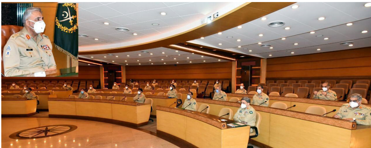
RAWALPINDI: Chief of Army Staff General Qamar Javed Bajwa addressing Corps Commanders conference.