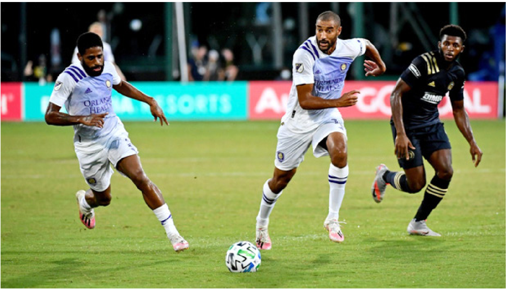
PHILADELPHIA: Players aiming to reach the ball in a Major League Soccer match between Philadelphia Union and Orlando City SC.

Visitors bypass Berlin museums BERLIN: Berlin museums might house the iconic Nefertiti bust, the Ishtar gate of ancient Babylon or Rembrandt masterpieces, but they still trail global counterparts in popularity – and the coronavirus is making things worse. Millions of euros have been poured into the institutions, yet the 19 museums managed by the Prussian Cultural Heritage Foundation (SPK) attracted just 4.2 million visitors last year, while the Louvre alone drew 9.6 million. Alarmed by lacklustre public interest, Germany is planning a major shake-up after a report commissioned by Chancellor Angela Merkel's government slammed the foundation as dysfunctional, outdated and out of touch. – APP