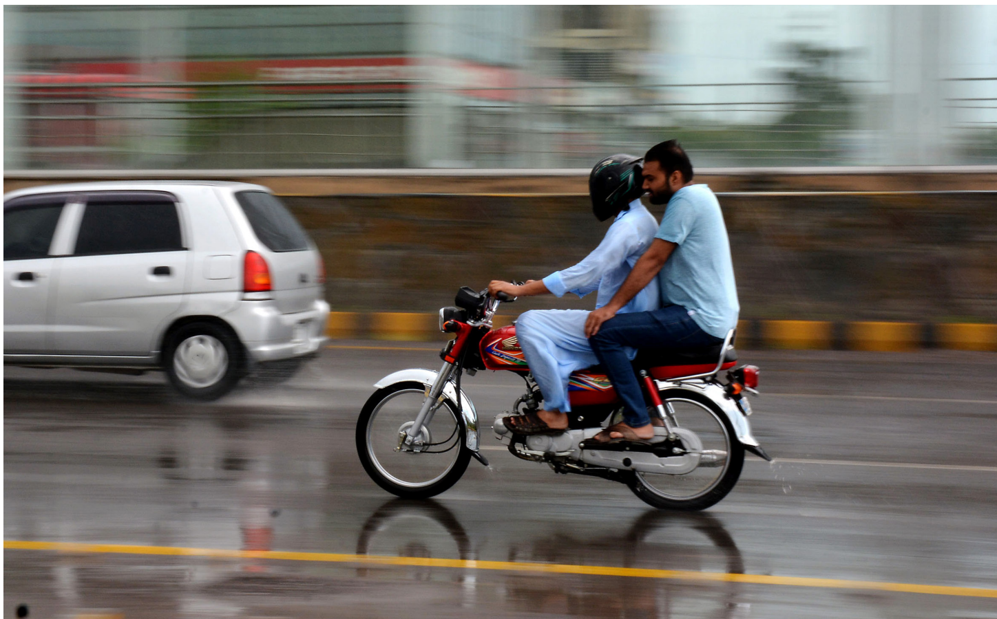
ISLAMABAD: A motorcyclist on his way at Jinnah Avenue during rain in federal capital.