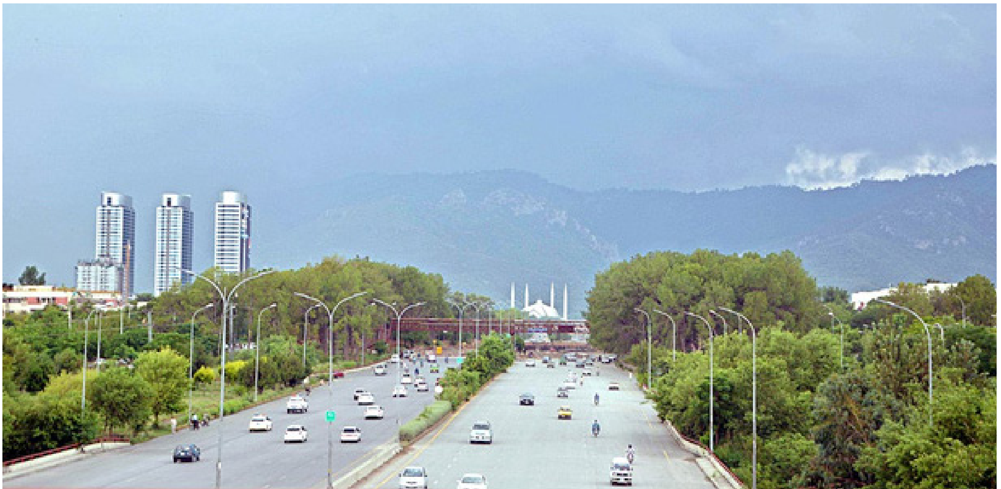
ISLAMABAD: A view of thick clouds hovering over the skies of the city.