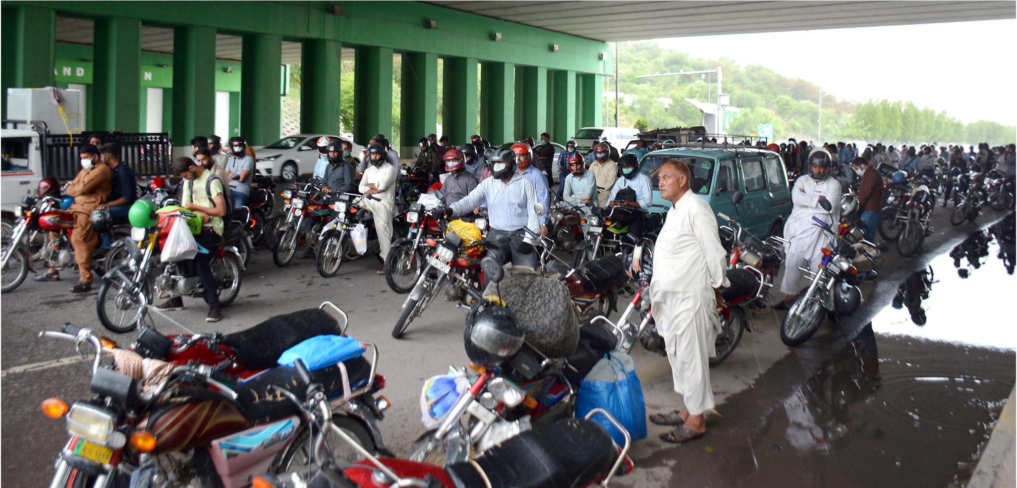
ISLAMABAD: Large number of motorcyclists standing under Zero point bridge waiting for the rain to stop.