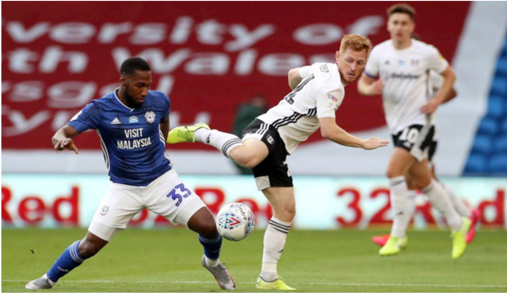
CARDIFF: Cardiff City FC and Fulham FC players trying to keep the ball in their Championship Play-off semi final match.

TOKYO: The WTA Pan Pacific Open in Japan, one of Asia's top women's tennis tournaments, has been scrapped for the first time because of the coronavirus, organisers said Tuesday. The cancellation of the event, which was scheduled for November and was won by Japan's Naomi Osaka last year, follows last week's axing of all international tennis tournaments in China for 2020. The Pan Pacific's demise ends a continuous run for the tournament since 1984 and leaves Asia with only one Women's Tennis Association event, October's Korea Open, on this year's coronavirus-wrecked schedule. It is also another blow for sport in Japan after the Tokyo Olympics, originally due to start last week, were postponed for a year over COVID-19. "We were trying to find ways (to hold the Pan Pacific Open), such as having no audience or limiting the number of spectators," organisers said in a statement. - APP