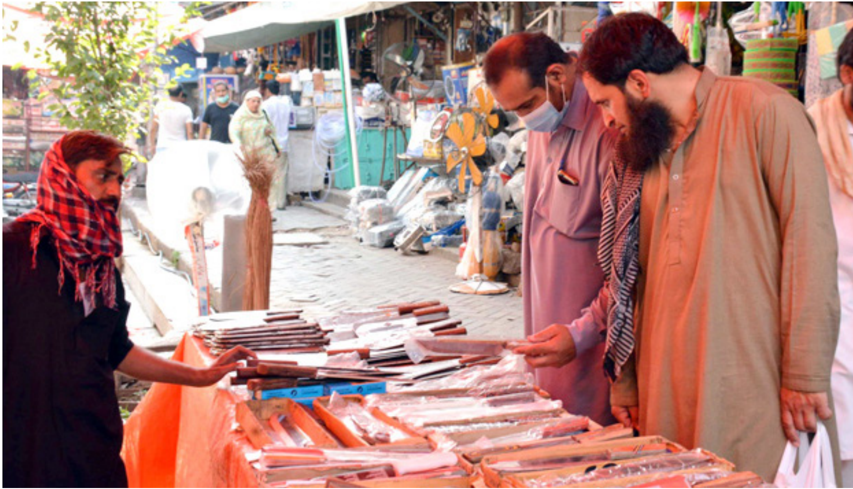
ISLAMABAD: People busy in purchasing choppers and knives to be used for slaughtering sacrificial animals on Eid ul Azha. — DNA

ISLAMABAD: Ehsaas Emergency Cash Programme has so far disbursed an amount of Rs160.513 billion among 13,268,562 lockdown affected persons. The programme was initiated to disburse an amount of Rs12,000 among the daily wagers and labourers whose livelihoods were affected due to coronavirus lockdown. The payment to deserving persons was continued through Ehsaas centres across the country. According to the cash update received on July 28, over Rs72.160 billion has been disbursed among 5,964,206 deserving families in Punjab so far while over Rs48.636 billion has been disbursed among 4,034,156 families in Sindh. — APP