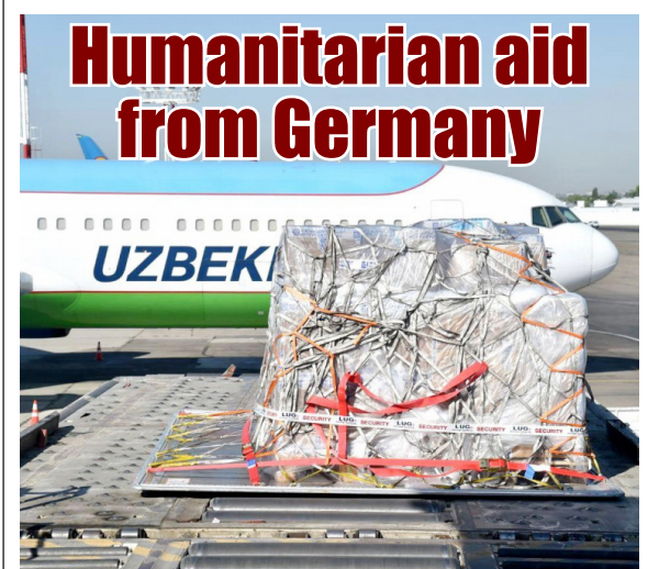
TASHKENT: A humanitarian cargo from Germany has landed at Tashkent International Airport named after Islam Karimov. It consists of oxygen cylinders, medical masks, protective gowns and other personal protective equipment. The cargo has been unloaded. - DNA

place with representatives of Turkish businesspeople and a number of members of the Turkish government. Sardor Umurzakov is expected to address an event on "Economic diplomacy during a pandemic: Experience of Uzbekistan and Turkey". According to the program of the visit, the delegation will hold meetings and negotiations with the heads of ministries and agencies, leading economic and financial structures of Turkey to substantively discuss the prospects for the implementation of investment projects in Uzbekistan.