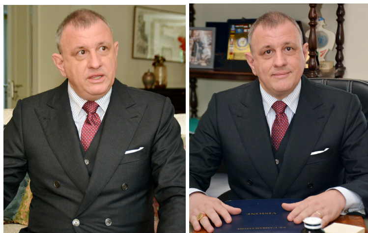
Editor Daily Islamabad Post with Italian Ambassador

He said being one of his first interviews; he would take some longer to introduce himself. Pakistan he said was his sixth diplomatic assignment abroad and the second as Ambassador of Italy. "My father is a Professor of