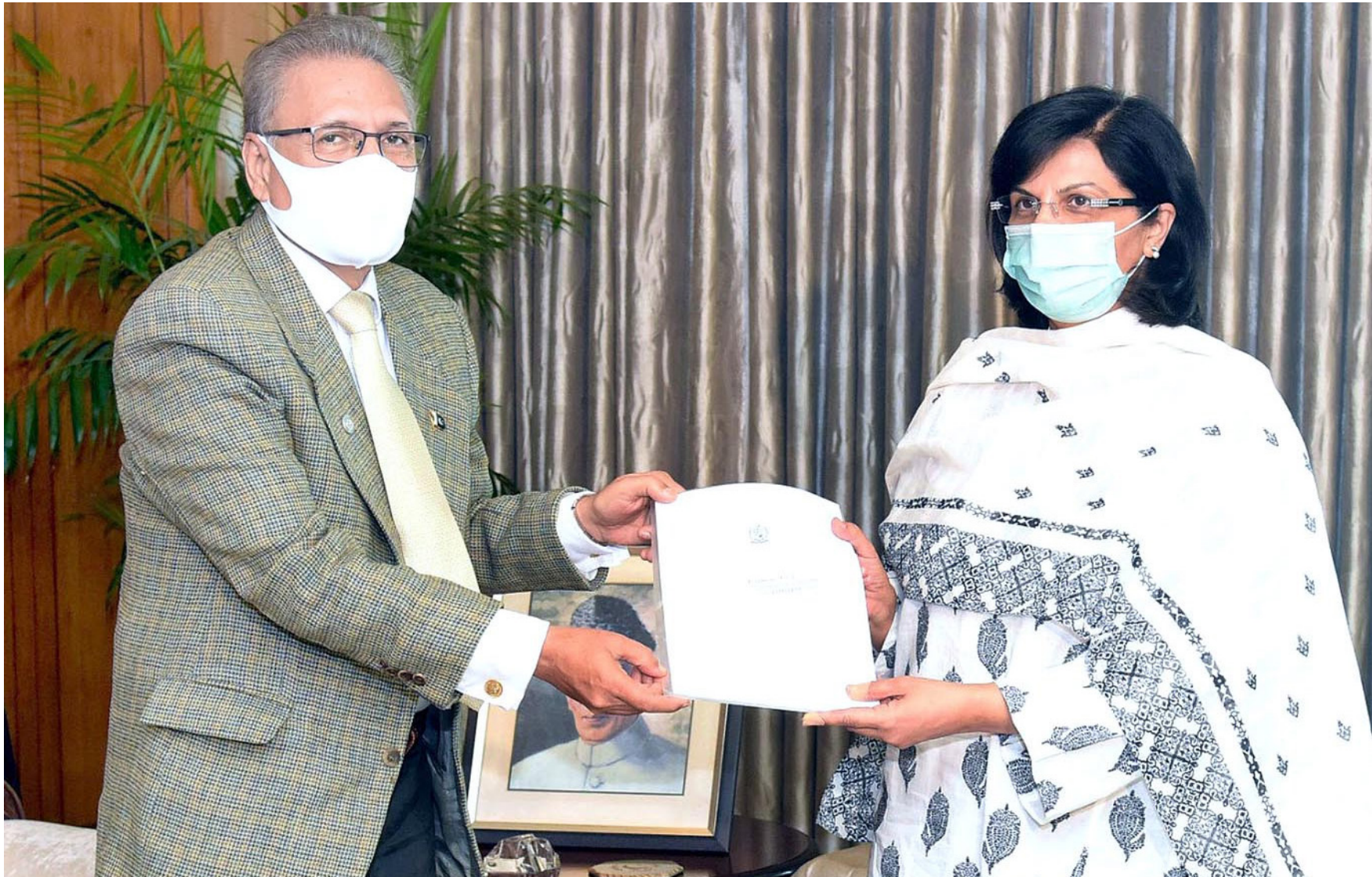
ISLAMABAD: Dr. Sania Nishtar, Special Assistant to Prime Minister presenting report on Ehsaas Emergency Cash to President Dr. Arif Alvi, at Aiwan-e-Sadr.

ISLAMABAD: The Flood Forecasting Division (FFD) has said that monsoon activity is likely to strengthen over North & Northeastern Punjab, Khyber Pakhtunkhwa, Kashmir, besides, over upper catchments of all the major rivers of Indus River System during the next 48 hours. A fresh wet spell of Moderate intensity with few heavy falls is likely to start from Wednesday. Currently, there is no riverine flood situation in the country. Present storage of Tarbela reservoir is 1.633 MAF which is 178.56 % lesser than the last year's storage on the same date with 33,000 cusecs water is discharging downstream Kotri. Water level at Mangla reservoir is same as of yesterday's i.e 1228.80 feet (13.20 feet below MCL of 1242.00 feet). As per FFD, Lahore, moist currents from Arabian Sea are penetrating into upper parts of Pakistan upto 5000 feet with Seasonal Low presently over Northern Balochistan. Yesterday's trough over Western part of Afghanistan lies over Northeastern Afghanistan. Under the influence of prevailing Met conditions, for the next 24 hours, FFD's, Lahore, forecast predicts scattered thunderstorm/rain of Moderate Intensity with few Heavy Falls over Rawalpindi, Gujranwala, Sargodha, Lahore, Faisalabad & Sahiwal Divisions of Punjab, Malakand, Hazara & Peshawar Divisions of Khyber Pakhtunkhwa including upper catchments of all the major rivers of Indus River System. — APP