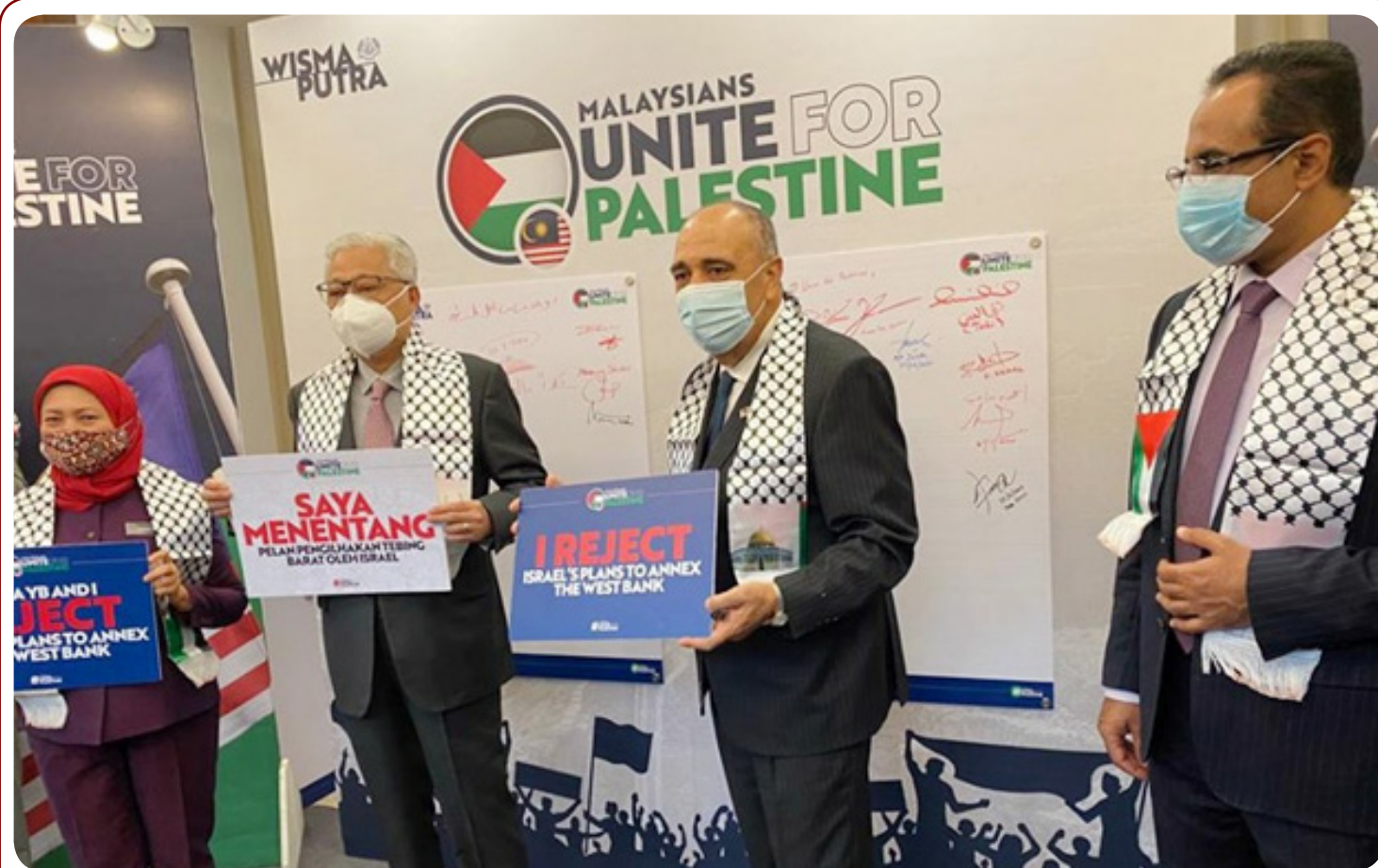
KUALA LUMPUR: Ambassador of Palestine to Malaysia Walid Abu Ali attending a conference Malaysia Unites for Palestine. - DNA

The United States last week ordered the closure of the Chinese consulate in Houston, alleging espionage, and Pompeo declared that decades of Western engagement had built a "Frankenstein" Beijing. Australia has fought alongside the United States in every major conflict since World War I and its right-leaning government has largely backed the Trump administration's approach. Australia recently followed the United States in rejecting Beijing's sweeping claims in the South China Sea and has backed calls led by Pompeo for an international inquiry into the origins of the COVID-19 pandemic.