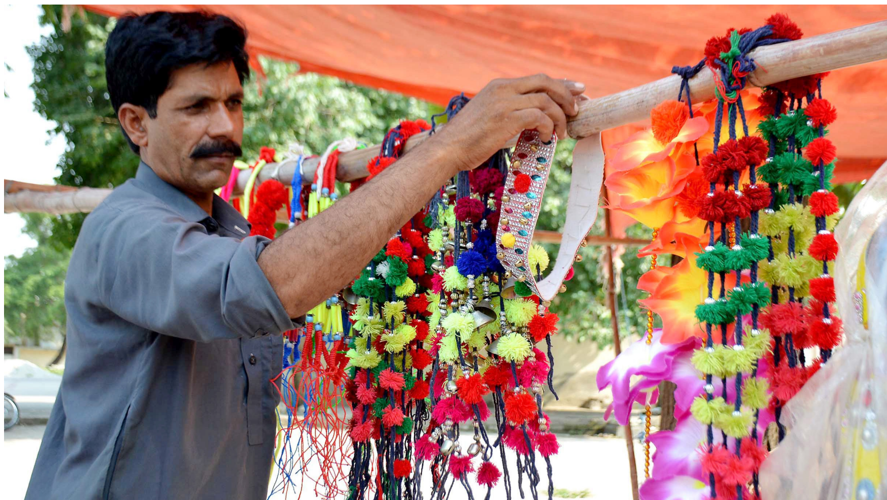
ISLAMABAD: A vendor displaying and arranging decorative stuff for sacrificial animals to attract the customers at G-7 area.

ISLAMABAD: The Power Division has directed all power distribution companies to ensure uninterrupted power supply for three days on Eid ul Azha. "Directives have been issued to DISCOs for ensuring smooth supply for three days from Friday evening," said the Spokesperson on his twitter handle here Tuesday. The DISCOs were also asked to set up special emergency teams, activate their control rooms besides deploying essential staff.