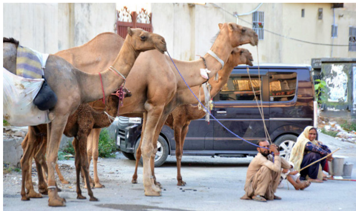
ISLAMABAD: A nomad family waiting for customers to sell camel milk at Aabpara Market.