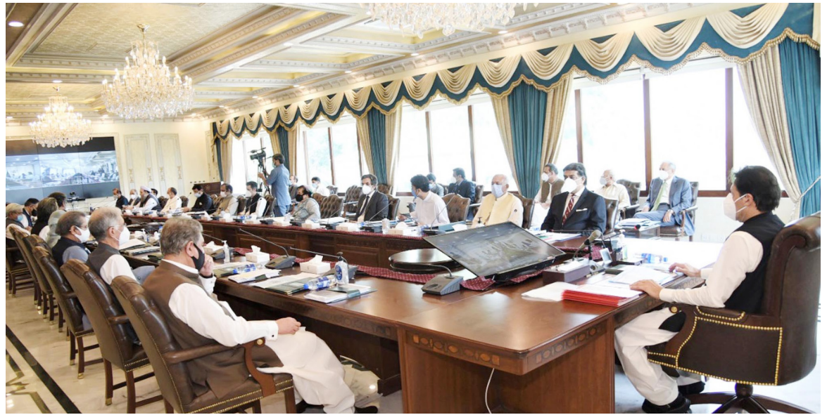
ISLAMABAD: Prime Minister Imran Khan chairing Cabinet meeting.

amendments to the NAB law, which were presented to Prime Minister Imran Khan. Qureshi went on to say that the opposition wanted the money laundering to be taken out of the jurisdiction of the NAB law and the national institution should take action against corruption above just Rs1 billion. By implementing the opposition's amendments, the anti-graft agency will become meaningless, adding that the opposition has been told that their proposals were not acceptable.