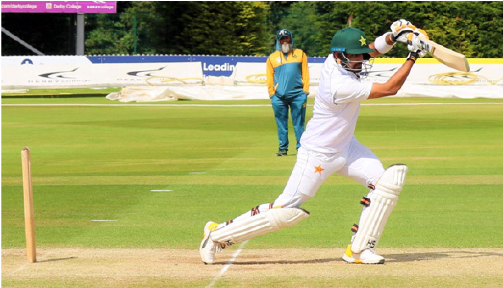
DERBY: Pakistani batsman Babar Azam playing a drive during a practice match ahead of first test match against England.

Many of the autonomous landings have been on the picturesque but tiny Lampedusa, which lies close to North Africa, and has seen a rise in the number of small boats landing there from Tunisia in particular.