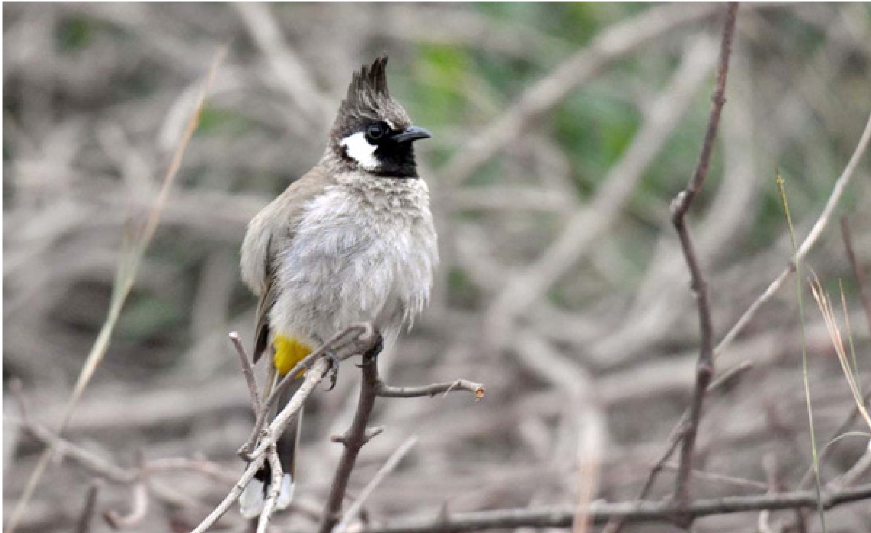
ISLAMABAD: A beautiful yellow-vented bulbul sits on a tree branch.