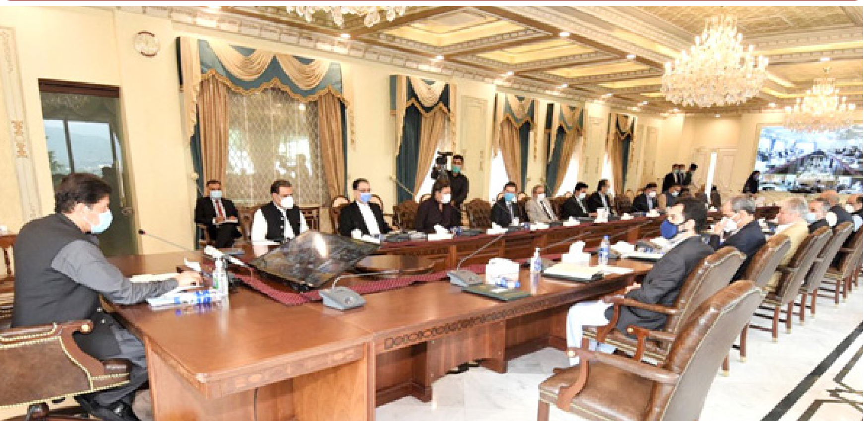
ISLAMABAD: Prime Minister Imran Khan chairs meeting of coordination committee on housing.