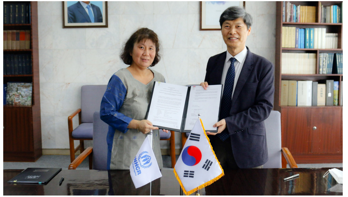
ISLAMABAD: Korean Ambassador Kwak Sung-kyu handing over documents to UNHCR representative donating USD one million for Afghan refugees, living in Pakistan. - DNA

KABUL: Taliban's political spokesman Suhail Shaheen, on Wednesday night, said that the Taliban will release the remaining government prisoners of the 1,000 pledged by Eid to show goodwill. "The other side must also complete the process of releasing the pledged 5,000 detainees in accordance with the Doha Agreement, and the list, in order to facilitate the start of intra-Afghan talks after Eid," Shaheen said. 25 government forces detainees were released by the Taliban in Baghlan and Logar provinces.