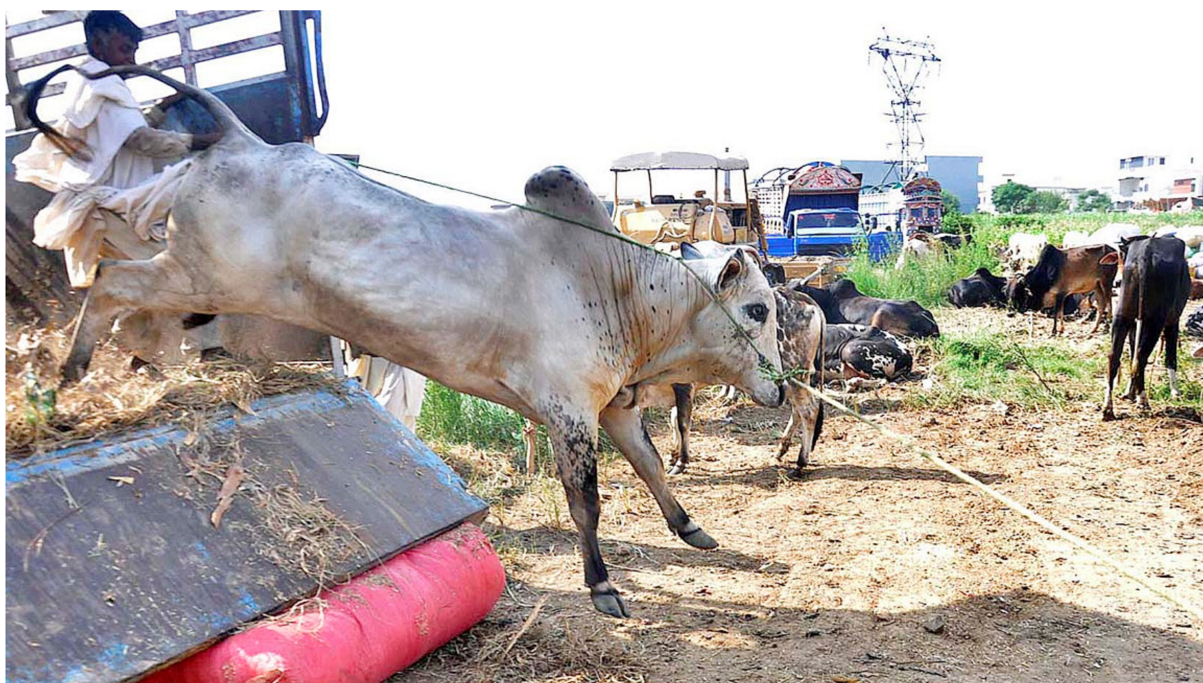
ISLAMABAD: Sacrificial animals being unloaded at a cattle market.