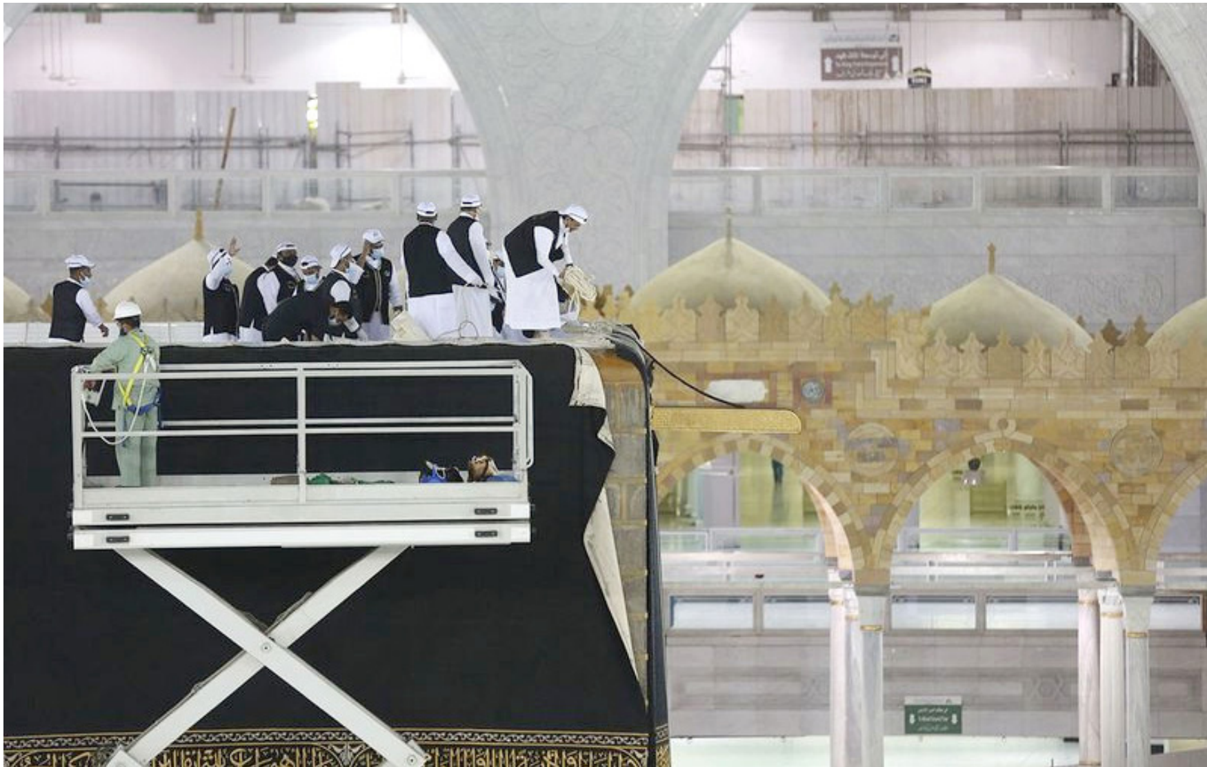
MAKKAH: The workers placing a new Kiswa, the black cloth covering, on the Holy Kaaba.

That left operational losses of 1.6 billion euros including a 332-million-euro charge for the closure next year of the wide-body A380 programme. Operational losses from COVID-19 were booked at 900 million euros. With air traffic not expected to return to pre-pandemic levels before 2023-2025, Airbus said it has cut production by 40 percent. — APP