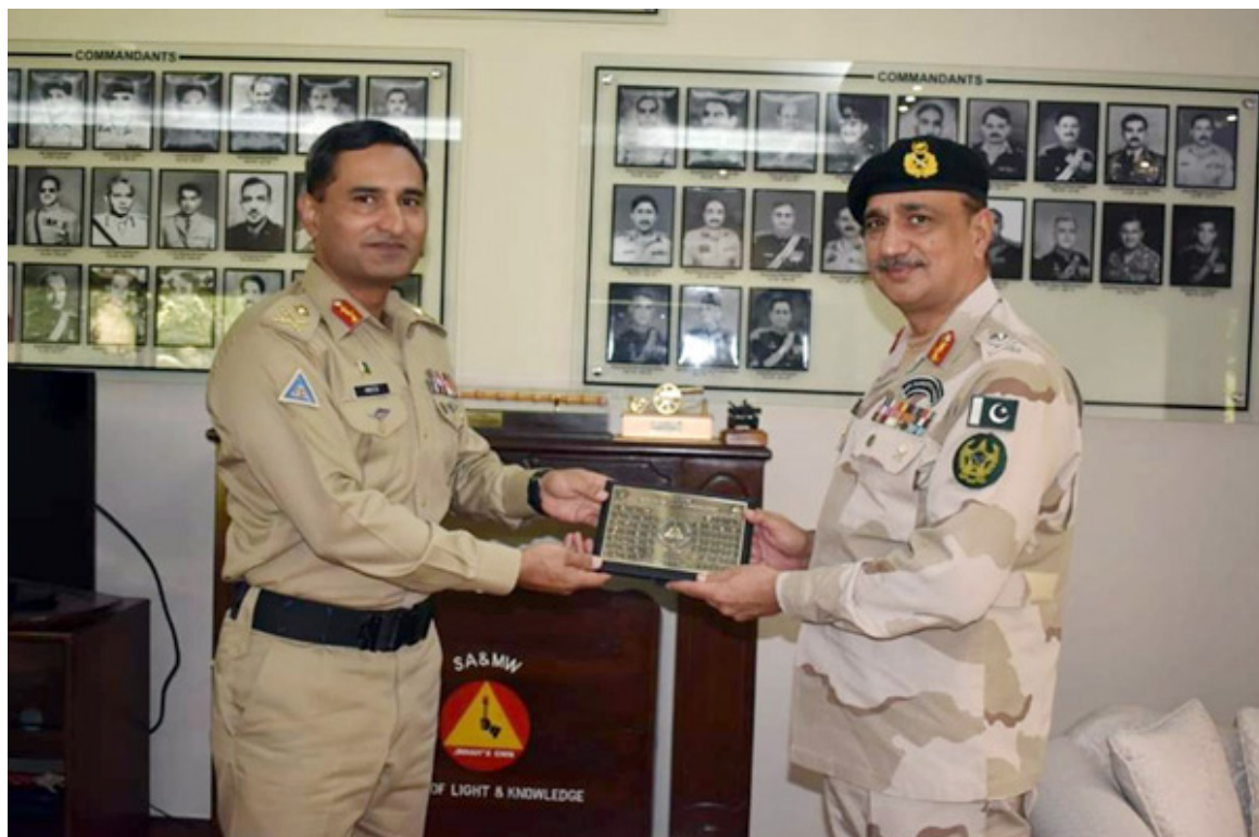
NOWSHERA: DG ANF being presented shield during his visit to Nowshera cantt.