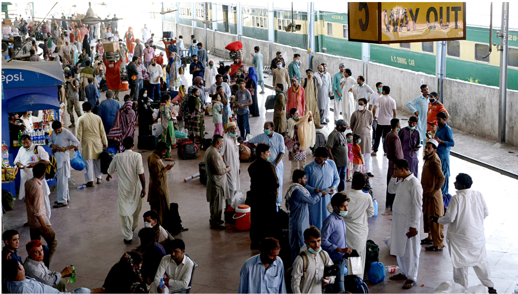
LAHORE: Citizens in a big number at Lahore railway station heading to their native cities ahead of Eid.

During the previous tenures, corruption and plunder ravaged the country and corrupt elements took personal benefits. There was no room for corrupt elements in the new Pakistan as a transparent Pakistan was the agenda of the incumbent government, he said. It was satisfying that transparent policies of the PTI-led government were also acknowledged internationally, Usman Buzdar said. - APP