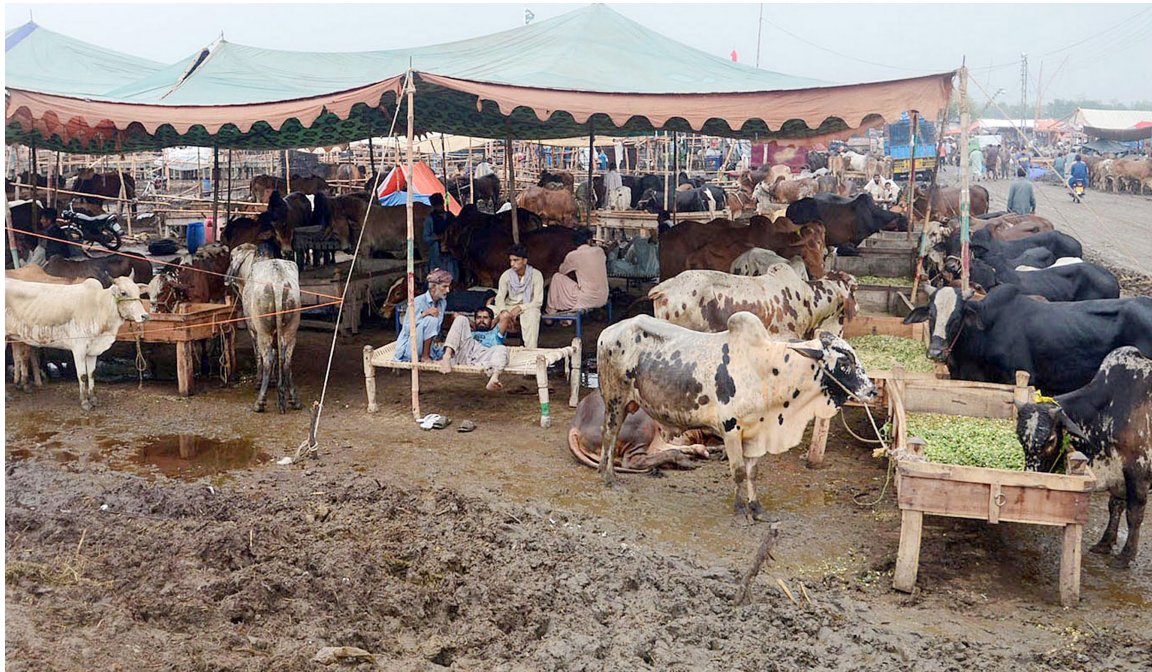
LAHORE: Vendors waiting for customers at Shah Pur Kaanjra cattle market.

While highlighting Ehsaas Emergency Cash Programme, she said it would benefit almost half of country's population.