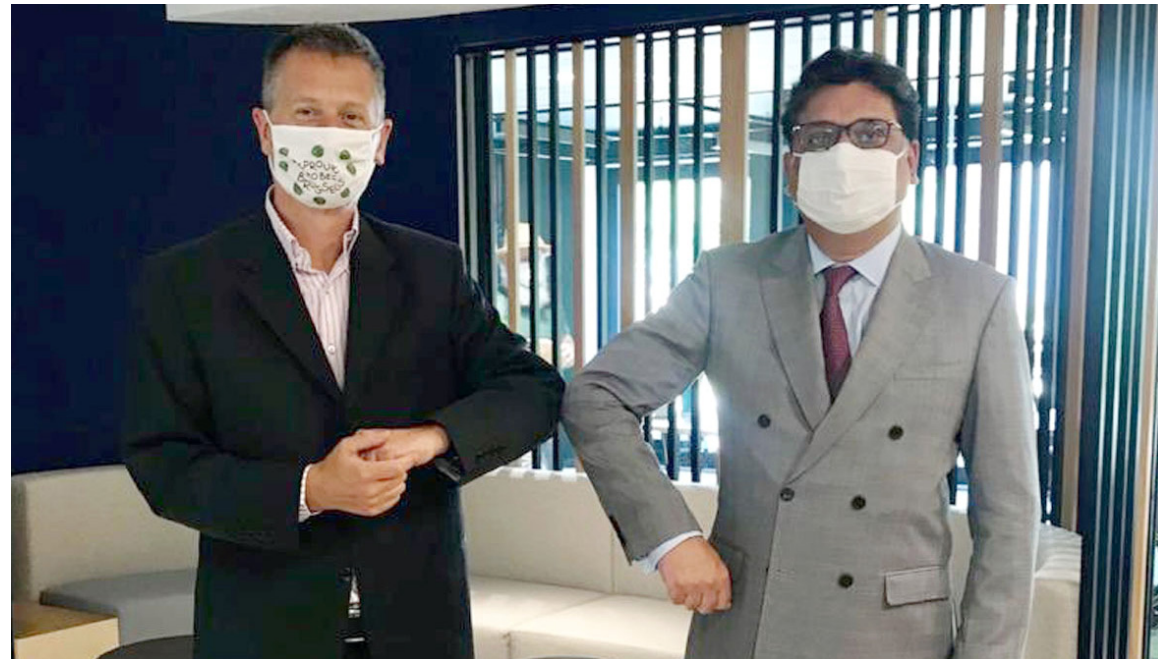
BRUSSELS: Pakistan ambassador to EU Zaheer Janjua had a fruitful & productive meeting with CEO of BECI Brussels. They discussed ways and means to enhance economic & trade cooperation post COVID-19. — DNA

Gen (R) Asim Bajwa, expressed his deep satisfaction over Gwadar port operating at its full potential. He elaborated that Gwadar East bay expressway and Gwadar airport are under construction and will soon connect the soon to be mega city to rest of Pakistan and the world. He further added that Gwadar Project exceeds its primary goal of mobilising a deep sea port and extends to encompass development of Gwadar Economic District and socioeconomic progress in South Balochistan.