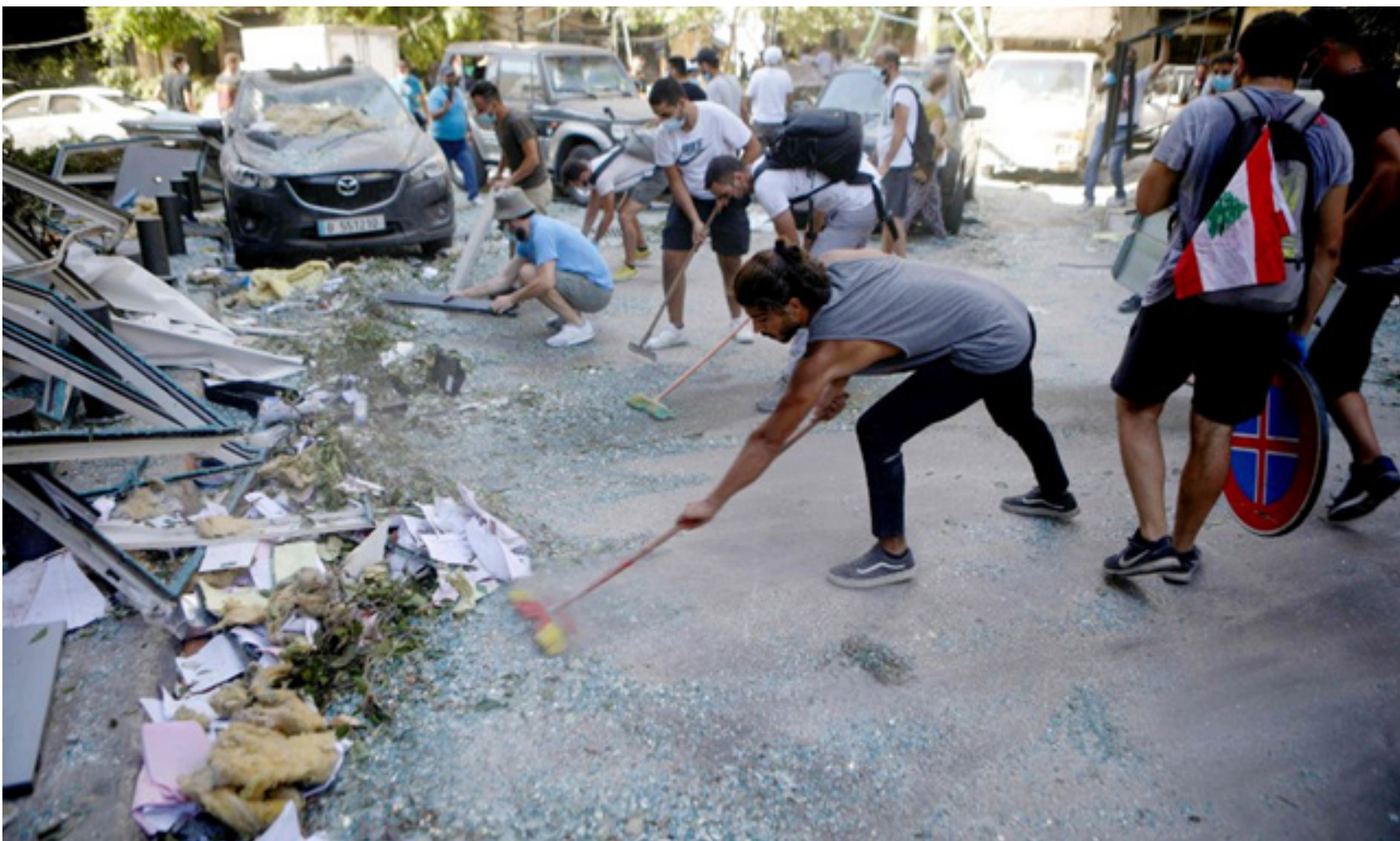
BEIRUT: Lebanese activists take part in a campaign to clean the damaged blast site and surroundings.

BEIRUT: Protesters clashed with Lebanese security forces at anti-government demonstrations in Beirut on Thursday. Officers deployed tear gas on dozens of people near parliament. Demonstrators were angered by Tuesday's devastating blast, which officials said was caused by 2,750 tonnes of ammonium nitrate stored unsafely since 2013. Many in Lebanon say government negligence led to the explosion, which killed at least 137 people and injured about 5,000 others. The explosion destroyed entire districts in the capital, with homes and businesses reduced to rubble. Dozens of people are still unaccounted for. The state news agency says 16 people have been taken into custody as part of an investigation announced by the government this week. Since the disaster two officials have resigned. MP Marwan Hamadeh stepped down on Wednesday, while Lebanon's ambassador to Jordan Tracy Chamoun stepped down on Thursday, saying the catastrophe showed the need for a change in leadership. Earlier on Thursday, French President Emmanuel Macron also visited the city and said Lebanon needed to see "profound change" from authorities. He also called for an international investigation into the disaster.