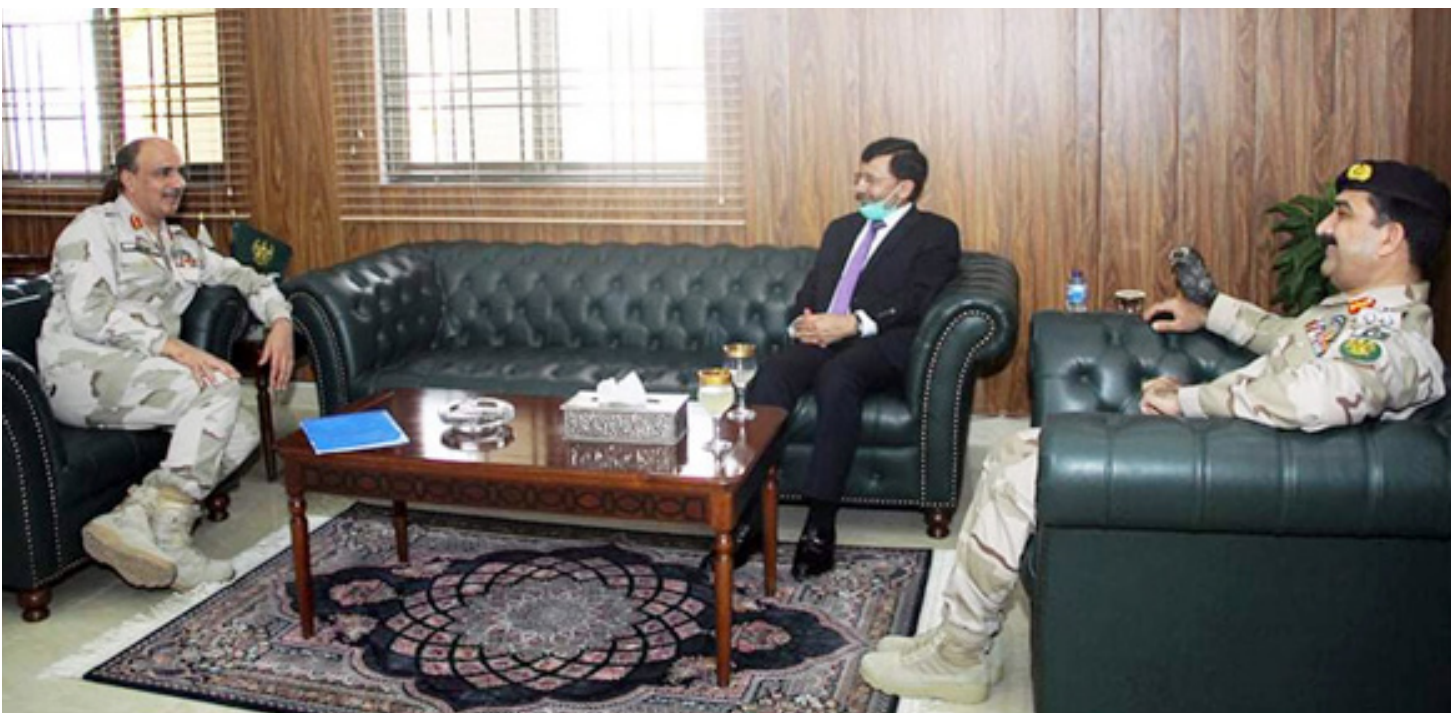
ISLAMABAD: Gen Saad Khattak, Pakistan high commissioner to Sri Lanka meets DG ANF. – DNA

model – which implies that the Chinese would operate it for 30 years after which the project would be transferred to the KP government. Once completed, the project will add 884 megawatts to the national grid and all four units are expected to become fully operational by 2022. The completion of this hydropower plant will play an important role in promoting Pakistan's industrial development and economic recovery. The project is expected to cost around US$ 1.9 billion and is scheduled to be operational by year 2022.