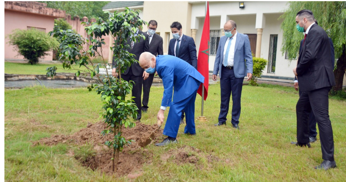
ISLAMABAD: Ambassador of Morocco Mohammed Karmoune planting a tree as part of Prime Minister Imran Khan's tree plantation drive.