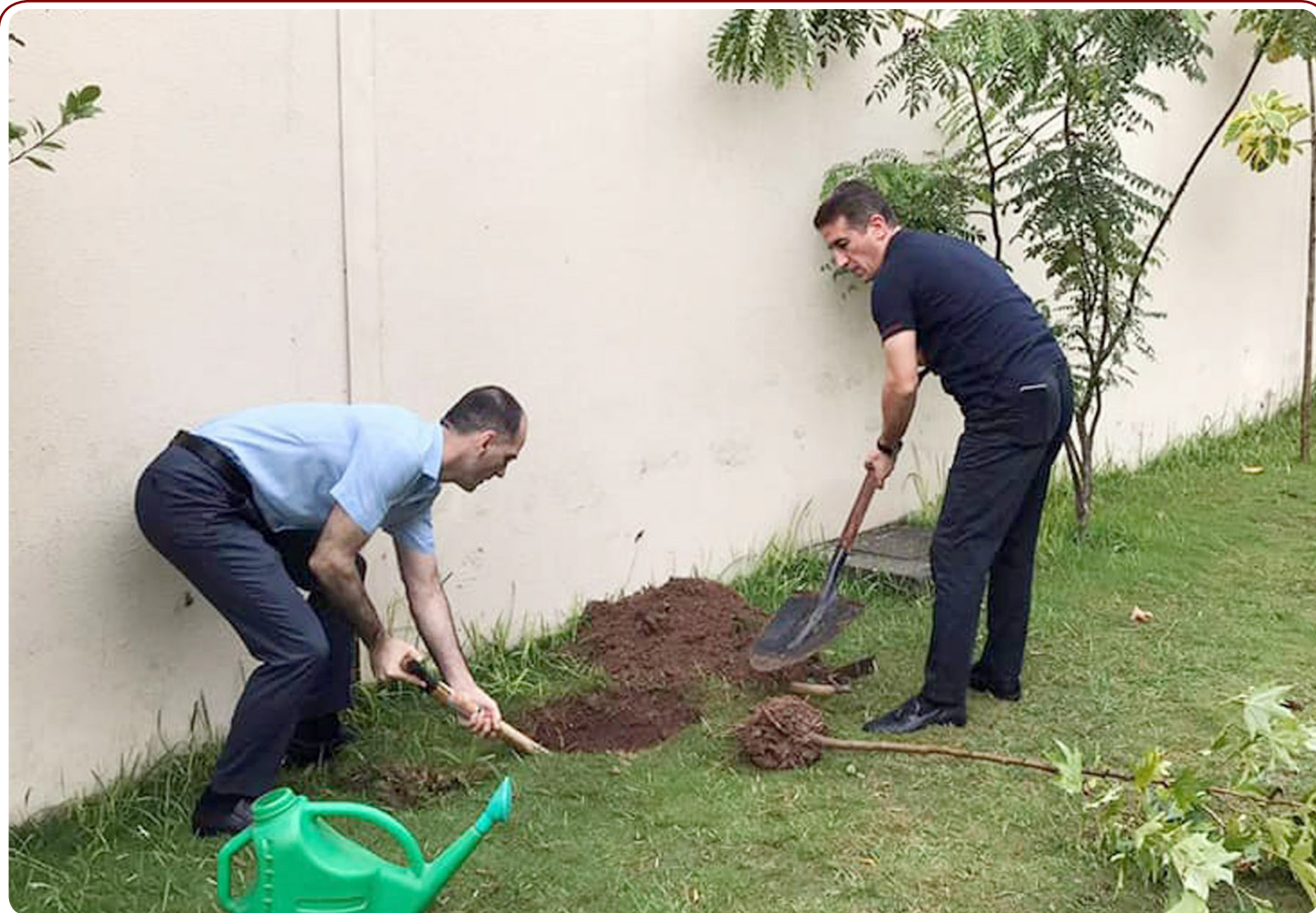
ISLAMABAD: Ambassador of Azerbaijan Ali Alizada planting a tree as part of Pakistan govt's 10 billion tsunami tree drive.

ISLAMABAD: The Islamabad Electric Supply Company (IESCO) has asked the general public to adopt precautionary measures owing to rainy spell as a little carelessness or negligence can lead to fatal accident. The spokesman advised the general public to follow precautionary measures for the sake of saving their lives and for their important belongings. These precautions were: Not to touch naked wire and get repaired defective wiring; use three pin plug along with proper earthing while using iron, washing machine, refrigerator etc; put wooden piece, flapper or dari under your feet and also use rubber sole shoes; use rope while drying clothes instead of electrical wires and do not use water pipe for it; Instruct your children avoid going near electricity installations while playing; do not keep hold the rope of cattle with poles or stay wire and remain at least hundred feet away from high tension wires. He further advised that electrocuted person must be separated from wire with piece of wooden or dry cloth. Do not allow any person or animal to go near the broken electricity wires till the arrival of concerned IESCO staff. Meanwhile, Chief Executive IESCO Shahid Iqbal Chaudhary also directed the staff to remain alert at complaint offices and to make sure the timely redressal of consumer complaints. — APP