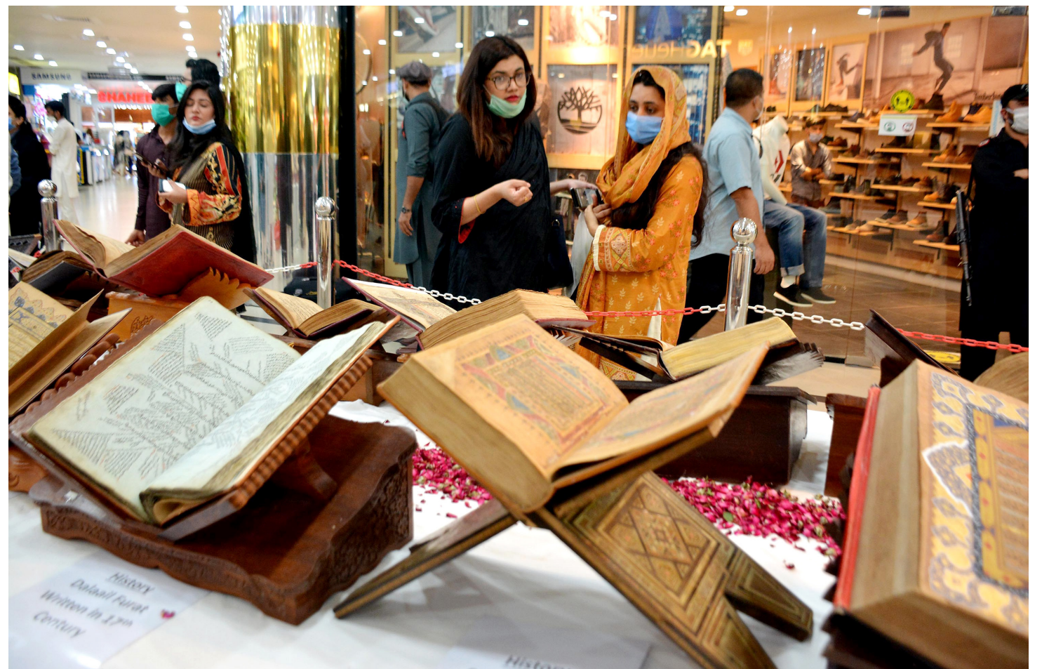
ISLAMABAD: Visitors visiting the unique and antique handwritten copies with Gold and Silver Water of The Holy Quran from 15th Century onwards at Safa Gold Mall.