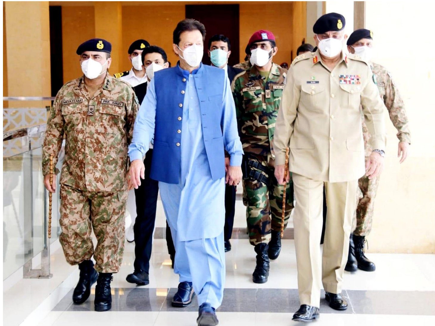
ISLAMABAD: Prime Minister Imran Khan along with Chief of Army Staff General Qamar Javed Bajwa arrives at National Locust Control Center.