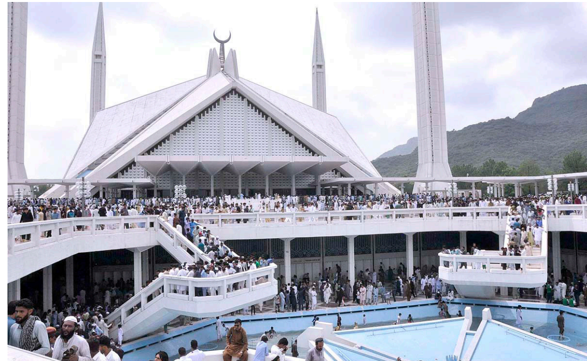
ISLAMABAD: A large number of people come out from Faisal Masjid after offering Friday prayers on the eve of Independence Day.

report on their behalf about their legitimate rights in their homeland. The Palestinian leadership also affirms that the Palestine Liberation Organization is the sole and legitimate representative of the Palestinian people, and that the Palestinian people stand today in every place united behind their legitimate leadership, headed by President Mahmoud Abbas in the face of this brutal tripartite declaration. In the face of these dangerous developments, the Palestinian leadership calls for an immediate emergency session of the Arab League, as well as the Organization of Islamic Cooperation, to reject this declaration. The Palestinian leadership also calls on the international community to adhere to international law and resolutions of international legitimacy that form the basis for resolving the Palestinian-Israeli conflict, and that peace can only be achieved through the complete end to the Israeli occupation of the Palestinian territories.