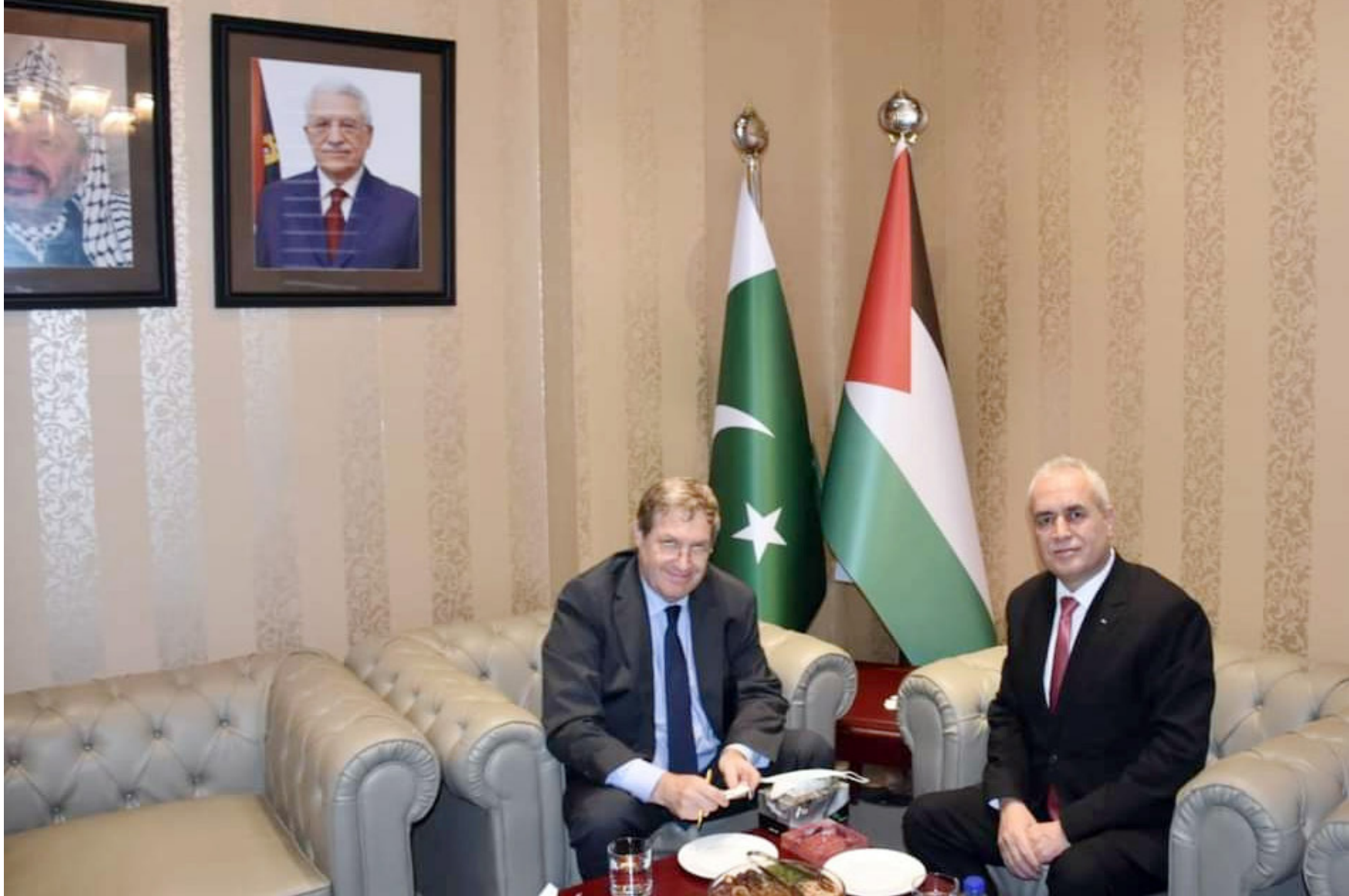
ISLAMABAD: Newly arrived Ambassador of Switzerland in a meeting with Ambassador of Palestine Ahmed Rabei.

ISLAMABAD: Expanding its e-commerce footprint and propelling digitization in the country, Daraz, the leading online shopping platform in Pakistan for mobile phones, laptops & everything, be it local or international brands has focused on innovative answers that will not only propel digitization in the country but also offer millions convenience in fulfilling routine tasks. The platform has launched dBills - a channel dedicated to the payment of electricity, water, telephone-internet and gas bills which will eliminate the need for Pakistanis to step outside of their houses to clear their dues.