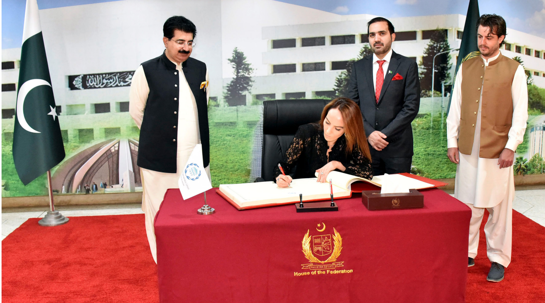
ISLAMABAD: Gabriela Cuevas Barron, President of Inter-Parliamentary Union recording her comments on guest book at Senate of Pakistan.

ISLAMABAD: The Islamabad Electric Supply Company (IESCO) on Monday issued power suspension schedule for Tuesday for various areas of its region due to necessary maintenance and routine development work. According to the IESCO spokesman, the power supply of different feeders and grid stations would remain suspended for the period from 04:30am to 08:30am, F-11, Fateh Jang, Bahter More, Ahmedal, Basal, Jand and F-6. 05:00am to 09:00am, Sector-4, Radio Pakistan feeders and surrounding areas. - APP