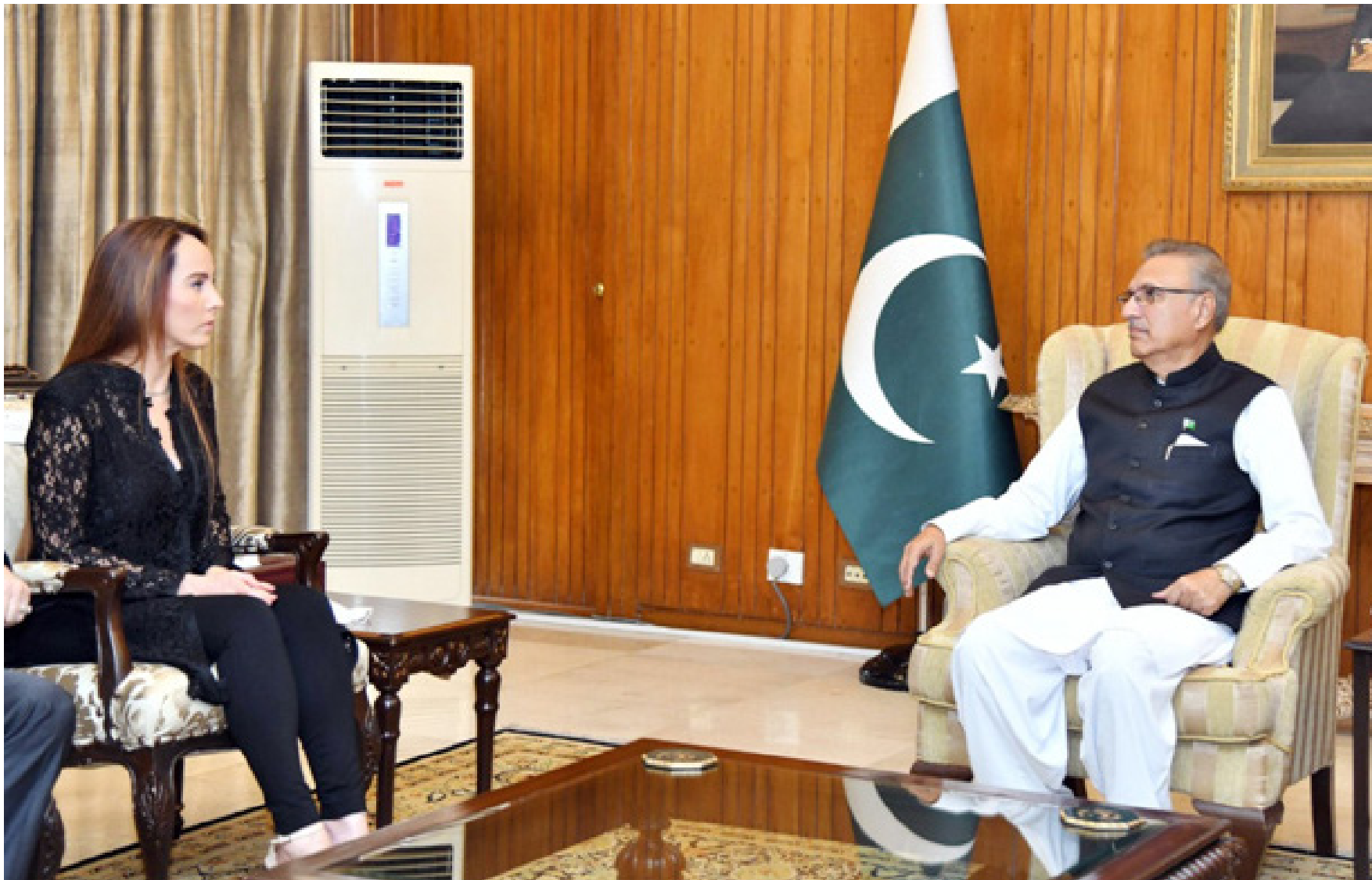
ISLAMABAD: Ms. Gabriela Cuevas Barron, President of Inter-Parliamentary Union (IPU) called on President, Dr. Arif Alvi at Aiwan-e-Sadr.

ISLAMABAD: Pakistan recorded nine deaths due to COVID-19 in the past 24 hours, all of which were reported from Sindh, while no coronavirus patient was on ventilator in Azad Jammu & Kashmir (AJK), and Balochistan. National Command and Operation Centre (NCO) on Monday issued latest statistics of COVID-19 deaths, positive cases and recovered patients. All the nine patients, who lost their lives due to COVID-19 during the last 24 hours, were in hospitals till August 23. Almost 115 ventilators were occupied across the country out of 1920 ventilators allocated for COVID-19, it was learnt. During the last 24 hours, 496 people tested coronavirus positive, whereas the total active coronavirus patients in Pakistan were 10,188 on August 24. As many as 23,655 tests were conducted on August 23 across the country. Around 276,829 patients have recovered so far across the country, showing a significant 93.8 percent recovery. Since the pandemic broke out a total of 293,261 cases were detected so far. Since the contagion spread across the country around 6244 deaths were recorded. — APP