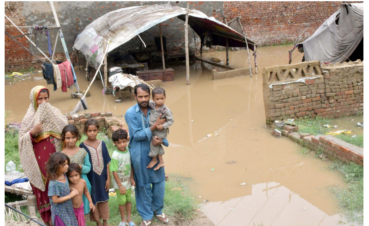
LAHORE: A gypsy family stands outside their slum inundated by heavy rains.