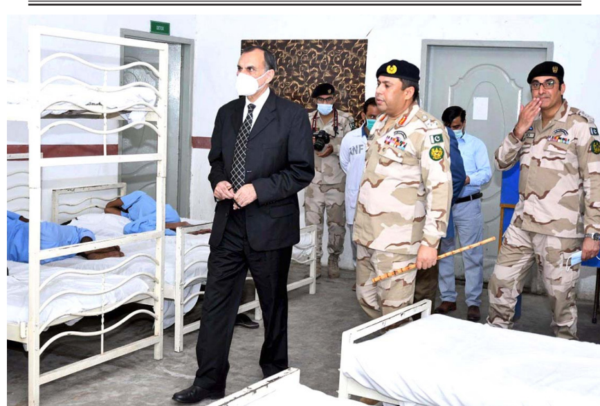
ISLAMABAD: Federal Minister For Narcotics Control, Muhammad Azam Khan Swati visits Model Addicts Treatment And Rehabilitation Centre (MATRC) of ANF.

monsoonal system in Sindh and a westerly wave from Balochistan. Chief Meteorological Officer (CMO) of Pakistan Meteorological Department Sardar Sarfraz meanwhile predicted more showers, saying moderate spells of rain were possible in the city by the afternoon. The PMD official said that Karachi had received unprecedented heavy rain due to the interaction of a