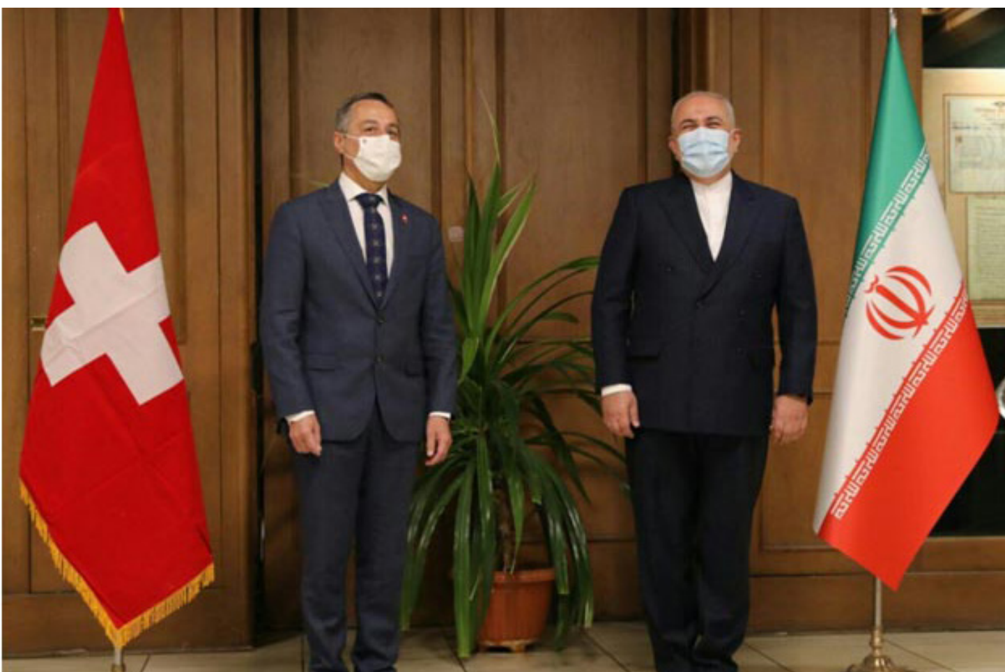
BERN: Iranian Foreign Minister Jawed Zarif with his Swiss counterpart after bilateral talks.

sets a precedence for other debt listings to engage in the state of the art competitive book building managed by the Stock Exchange, which will enable the government and private companies to raise capital at the most competitive cost, while providing attractive investment opportunities to investors." Power Holding Limited's Pakistan Energy Sukuk II is a Shariah compliant debt instrument which was issued through the competitive book building process managed by Pakistan Stock Exchange.