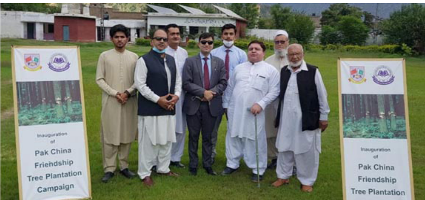
PESAHAWAR: As a part of Pakistan China Friendship Association (PCFA) Khyber Chapter & Pakistan Development Foundation (PDF) joint initiative Pak China Friendship Tree Plantation (PCFTP) 2020 which was launched by Chinese Ambassador in Pakistan Mr. Yao Jing

ISLAMABAD: Election Commission of Pakistan (ECP) held a meeting here on Monday for conducting local body elections in Sindh province. The meeting was chaired by Chief Election Commissioner (CEC) Sikandar Sultan Raja and attended by ECP members and senior officials, leaders of Pakistan People's Party (PPP) Taj Haider, Nisar Ahmad Khoro, Farhat Ullah Babar, Murtaza Wahaab and Khalid Chacher besides Special Secretary Local Government Sindh and Research Officer Local Government Sindh. Representatives from PPP and Sindh government were of view that as the Department of Statistics has not officially published the figures of census of Pakistan 2017, therefore, as per law and constitution, the ECP could not hold elections on unofficial data of population. — APP