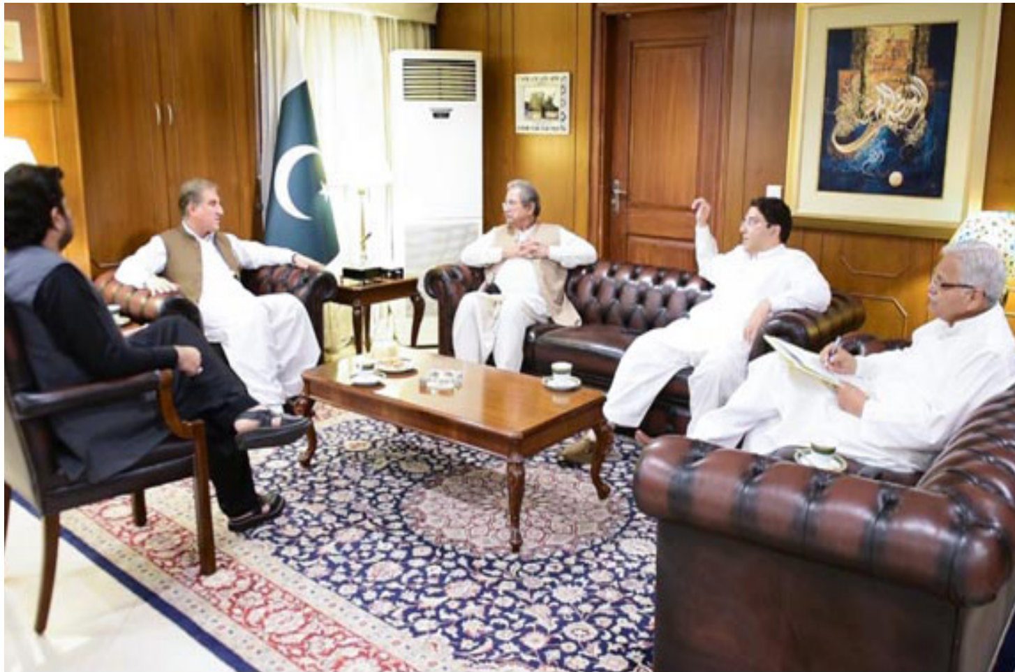
ISLAMABAD: Federal Minister for Education Shafqat Mahmood in a meeting with Foreign Minister Shah Mahmood Qureshi.

ISLAMABAD: The Islamabad High Court (IHC) on Monday ordered law enforcement agencies to ensure the return of missing Securities and Exchange Commission of Pakistan (SECP) Additional Joint Director Sajid Gondal by September 17. The directives were issued by IHC Chief Justice Athar Minallah while hearing a case related to the missing SECP official. During the hearing, the IHC CJ slammed the government for its failure to recover Gondal. "Is this a normal case?" the judge rhetorically asked the officials present in court. The judge observed that the federal capital was 1,400 square miles and this "small area" had its own inspector general of police and chief commissioner.