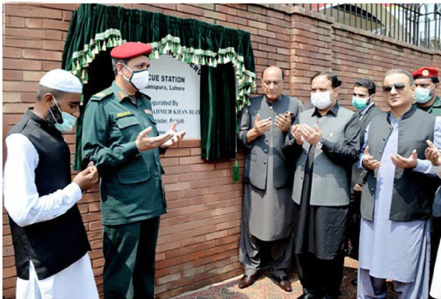
LAHORE: Chief Minister Punjab Sardar Usman Buzdar inaugurating Journalists colony, Harbnas Pura Rescue station.