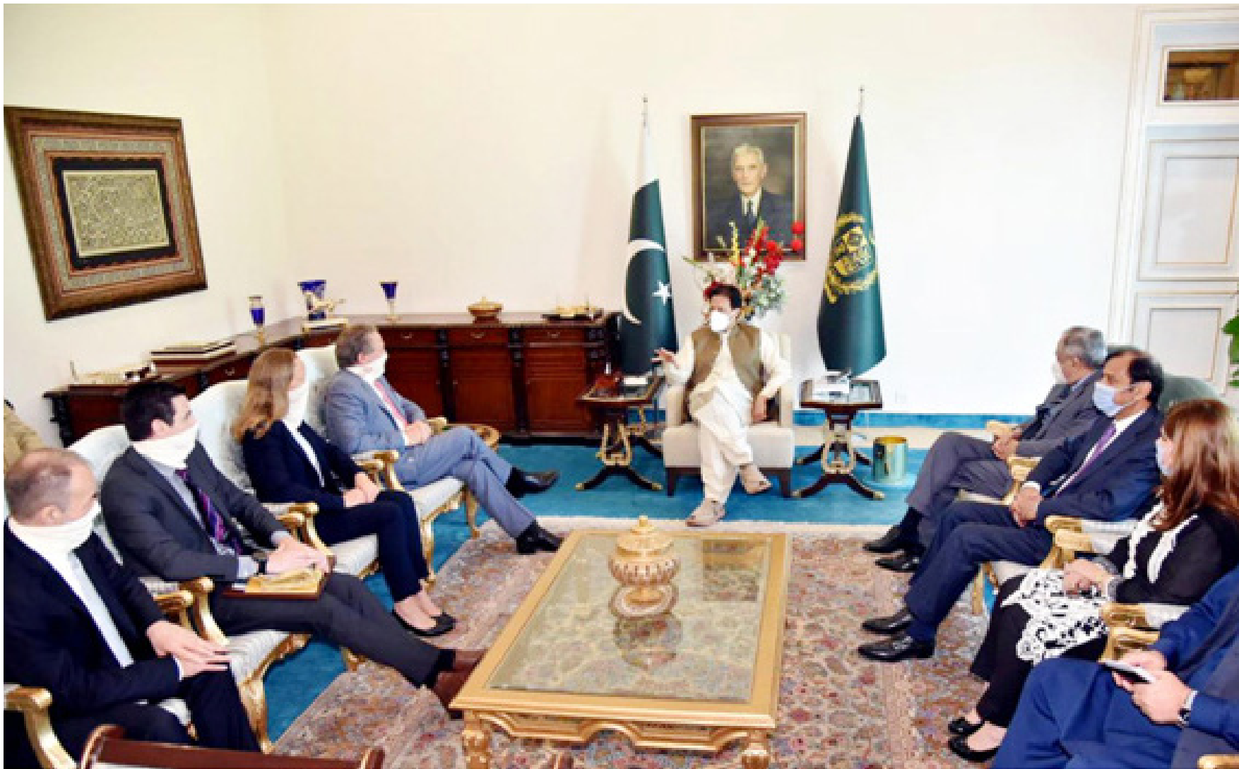
ISLAMABAD: Andrew Forrest, Chairman of Fortescue Metals Group Ltd. Australia, called on Prime Minister Imran Khan. — DNA

The show will feature theme based puppetry that usually revolved around current issues including women and children related issues, education and environment to educate the audience especially children through infotainment. Special puppet artist will perform in the show who have taught special techniques of puppetry from different institutions. The Puppet shows are being arranged by PNCA as regular feature which was established in 1978 and has been showcasing the skills of its puppeteers comprising vibrant costumed puppets presenting folk tales, skits, regional dances and national songs to provide infotainment to audiences of every age group. — APP