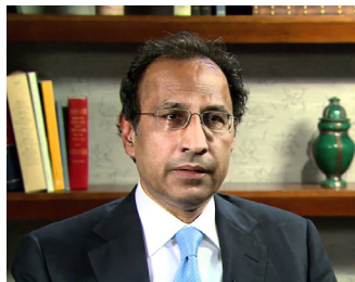
Pakistan (SBP) and PSX."

"I congratulate all the market participants and transaction leads who made the listing of Pakistan Energy Sukuk II a success," he said and termed it an excellent team effort of Ministry of Finance Debt Office, Securities and Exchange Commission of Pakistan (SECP), State Bank of