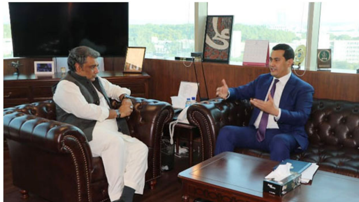
ISLAMABAD: Federal Minister for Maritime Affairs, Syed Ali Haider Zaidi meeting with Uzbekistan's Deputy Prime Minister for Investment and Foreign Trade, Sardor Umurzakov.

ISLAMABAD: The meeting of the Senate Standing Committee on Information Technology and Telecommunication, was held on Friday at Parliament House. The issues taken up pertained to payment of increase of pensions as per recommendations of the Committee's report adopted by the Senate in its sitting held on 28 January, 2020, non-availability of internet facility in areas of Daag, Arangi and Battu in Balochistan and propagation of defamation of Parliamentarians with particular reference to Senator Kalsoom Parveen.