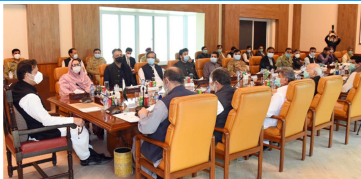
QUETTA: Prime Minister Imran Khan chairs a high level briefing on COVID-19, flood situation and development projects of Balochistan.

will be watching closely. The United States is prepared to support as requested. The United States recalls the commitment by the Afghan government and the Taliban that terrorists can never again use Afghan soil.