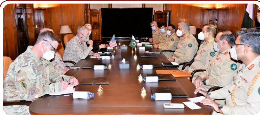
RAWALPINDI: General Kenneth F. McKenzie Jr, Commander US CENTCOM, called on Chief of Army Staff (COAS) General Qamar Javed Bajwa. Geo-strategic environment, regional security, Pak-US military cooperation including Afghanistan Peace Process and #Kashmir situation discussed.

said the director-general. "Community health workers, previously used to vaccinate children for polio, have been redeployed for contact tracing and monitoring." The WHO DG said that the Pakistani government is spending more on health and social welfare of its people and added that even critics of the government, are appreciating the efforts. "Pakistan under the leadership of Prime Minister Imran Khan contained coronavirus spread successfully." Dr Tedros also issued a stark warning about the work needed to prepare the world for future pandemics. "This will not be the last pandemic," he told the media briefing. "History teaches us that outbreaks and pandemics are a fact of life. But when the next pandemic comes, the world must be ready - more ready than it was this time." Dr Tedros called on countries to invest in public health, as a "foundation of social, economic and political stability."