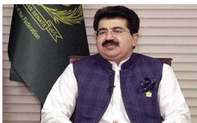
Governance of China" to the Chairman Senate. The book is a compilation of speeches of Chinese President Xi Jinping.

policy, and our friendship with China represents national consensus and the common desire of all Pakistani people. "We support and commend President Xi Jinping's visionary Belt and Road Initiative (BRI) that aims at enhancing regional and international connectivity", Chairman Senate remarked. He further added that this vision resonates with Pakistan's own resolve and commitment to promote peace, development and prosperity through cooperation, inclusivity and mutual respect. Chinese Ambassador presented 3rd volume of "The