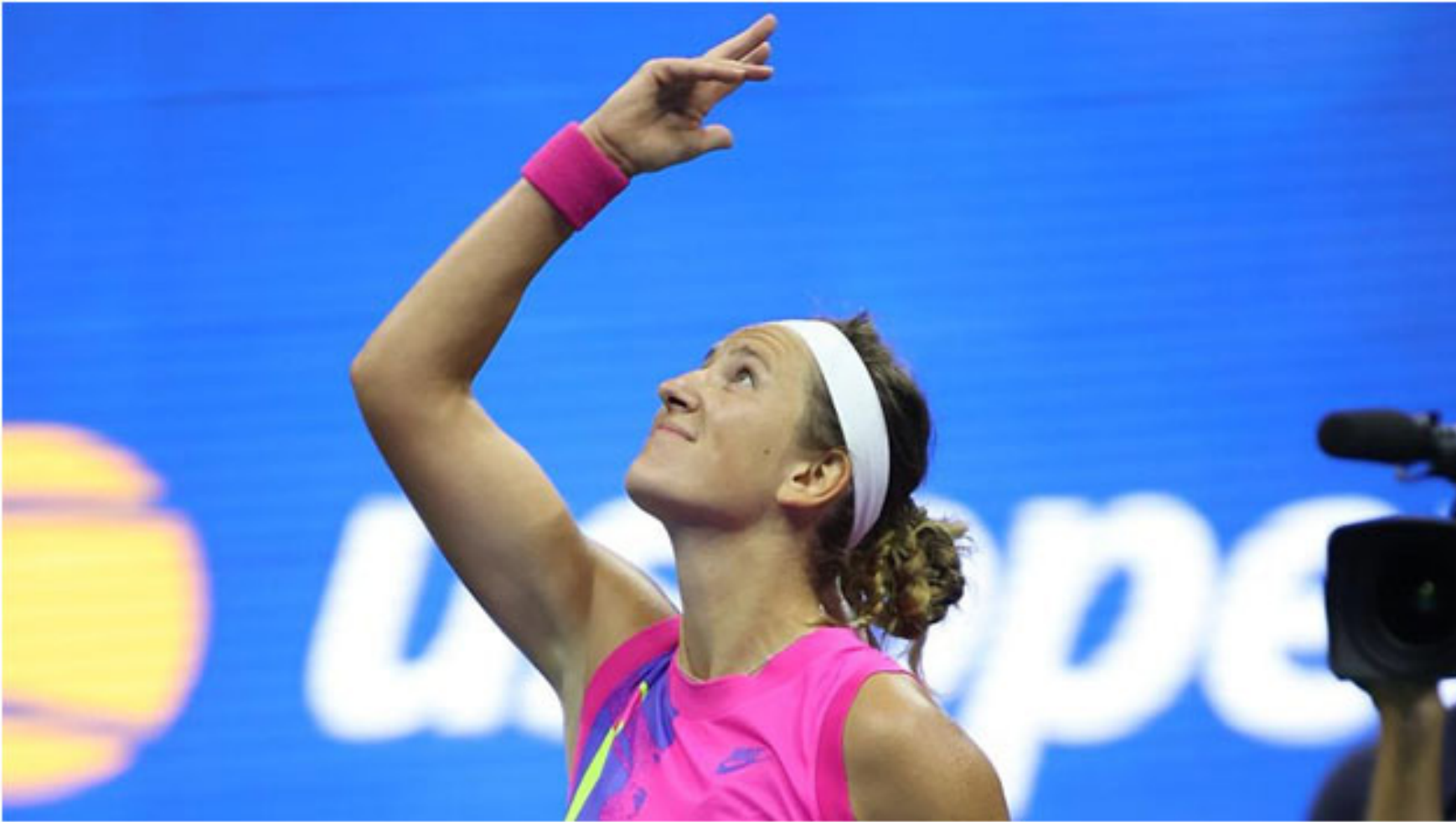
NEW YORK: Victoria Azarenka reacts to winning against Serena Williams during a women's singles semi-final match at the 2020 US Open.

Iraq's mosques have been closed to gatherings for close to six months, but notoriously outspoken Sadr said on Wednesday that he would hold open-air prayers in his stronghold. In east Baghdad's Sadr City on Friday, worshippers put on medical masks and gloves and had their temperatures taken before being allowed into the courtyard of the main mosque, where volunteers were spraying disinfectant. "We urge everyone to abide by social distancing and protect themselves against this virus," the imam said in the opening of his brief sermon. Sadr had issued a list of restrictions on Twitter this week, including that worshippers must stand exactly 75 centimeters apart and sermons must last only 15 minutes.