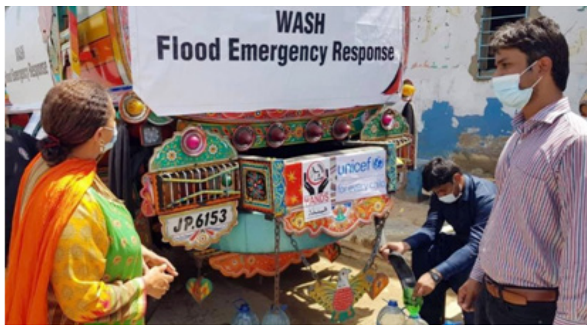
ISLAMABAD: UNICEF head in Pakistan reviewing clean drinking water provision to masses.

DUBAI: Bahrain recorded the highest spike in daily coronavirus cases with 757 new infections, according to the Ministry of Health. The new figure surpassed the highest recorded daily total of 724 cases in June 26. Out of 11,728 COVID-19 tests carried out in the past 24 hours, 757 new cases have been detected among 85 expatriate workers, 668 new cases are contacts of active cases, and 4 are travel related. This brings the total to 58,207. There are currently 28 cases in a critical condition, and 93 cases receiving treatment.