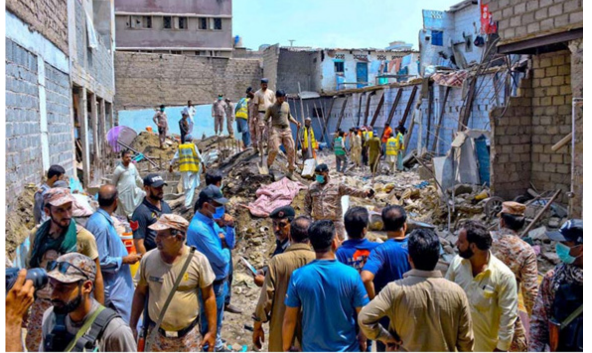
KARACHI: Rescue operations underway after roof of a building collapsed in Lyari area.

Monday, September 14, between the Afghan and Taliban delegation in Doha. Sayed Saddat Mansoor Nadiri, State Minister for Peace Affairs, said the primary demand by the Afghan government is a comprehensive ceasefire during the intra-Afghan talks held in Qatari capital Doha.