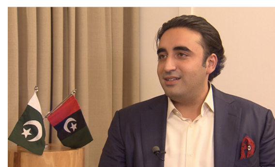
assess the losses in the affected areas, he added. Bilawal Bhutto said that Asif Ali Zardari had given

damage caused by rains and floods. Distribution of rations will not solve the problems of the flood victims. The present government should provide Watan Card to the flood victims. He said that he spent more time in Mirpur Khas, it is just the beginning, PPP MNAs, MPAs work hard on their own, there were losses in Mirpur Khas, Umerkot, Badin, Tharparkar, we have come to