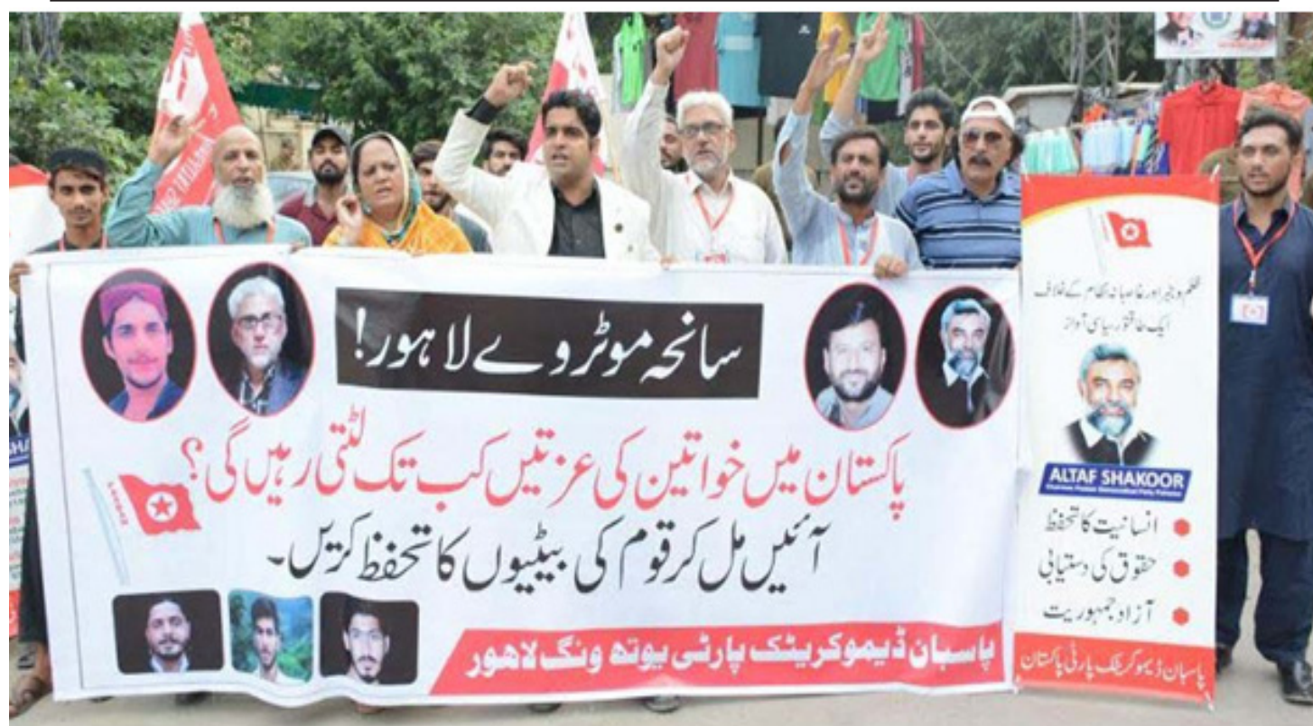
LAHORE: Members of Pasban Democratic Party holding a protest against recent rape case. - DNA

KARACHI: Pakistan Railways slashed ticket charges by 10 percent across all AC Business and 5 percent across all AC Standard classes. The concession in tickets for both the AC Standard class and AC Business class shall reflect from Sept 21 throughout the department. Moreover, the department announced the restoration of dining restaurant cars across all the express trains from Sept 14. It said the dining restaurant cars were restricted earlier in the wake of COVID-19 breakout. However, now the passengers can avail breakfast, lunch and tea among other edibles from their express trains. The cut shall reflect from Sept 21 in both the AC Business classes and the AC Standard class. In another development, announced by the department the same day, Pakistan Railways decided on Saturday to launch two new railway trajectories from Lahore, each to Narowal and to Sahiwal destinations. The train from Lahore, called Faiz Ahmed Faiz, shall embark on its journey to Narowal at 06:30 PM to conclude its journey at 08:55. The return will take place from Narowal at 05:30 AM to arrive at Lahore by 07:50 AM. Another train, Lasani Express, will be from Lahore en route to Sahiwal which will be scheduled to leave Lahore 03:45 PM and to arrive at destination by 07:45 PM. Lasani Express shall depart from Sahiwal at 06:00 AM and will reach Lahore by 09:55 AM, according to the department.