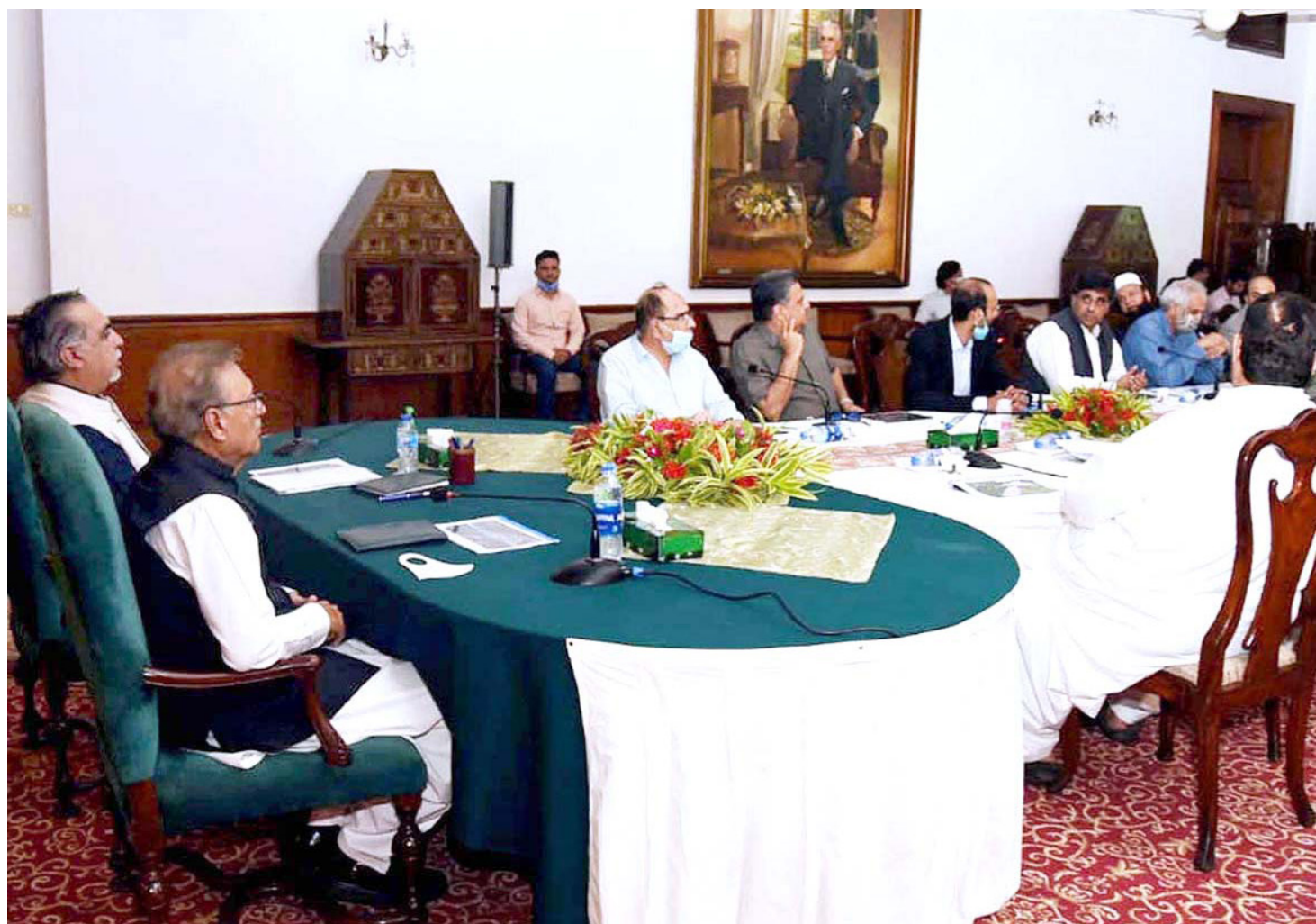
KARACHI: President Dr. Arif Alvi chairing a meeting of business community at Governor House.

jects under CPEC. A recent study conducted by CPEC Centre of Excellence, showed that indirectly, CPEC could help create even 1.2 million jobs until 2030 under its presently agreed projects. In July 2020, China provided training equipment worth $4 million (approximately 650 million rupees) for the vocational training institutes/ schools around Pakistan through National Vocational and Technical Training Commission.