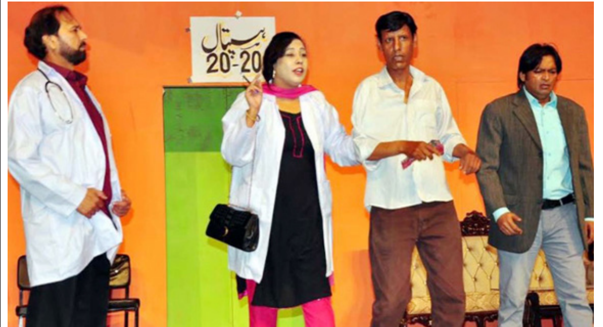
RAWALPINDI: Artists perform in a stage play 'Doctor 2020' presented at Punjab Arts Council to highlight social issues.