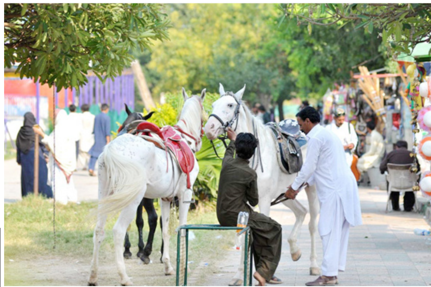
ISLAMABAD: Vendors along with their horses waiting for the clients at Lake View Park.