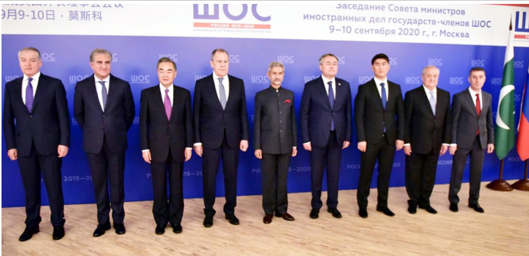
Moscow: Group photo of the Foreign Ministers attending SCO-Foreign Ministers meeting.