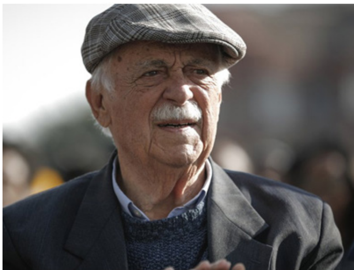
Many had expected the death penalty. Ramaphosa described Bizos as one of the lawyers who "contributed immensely to the

JOHANNESBURG: George Bizos, an anti-apartheid icon and renowned human rights lawyer who defended Nelson Mandela on treason charges for which he escaped the death penalty, died on Wednesday aged 92. President Cyril Ramaphosa announced the rights lawyer's passing during an online media briefing. "This is very sad for our country," he said. Bizos died of natural causes at his Johannesburg, his family said in a statement. The celebrated lawyer represented Mandela during the Rivonia Trial which saw Mandela and seven others sentenced to life imprisonment in 1964 on charges of seeking to overthrow the racist apartheid government.