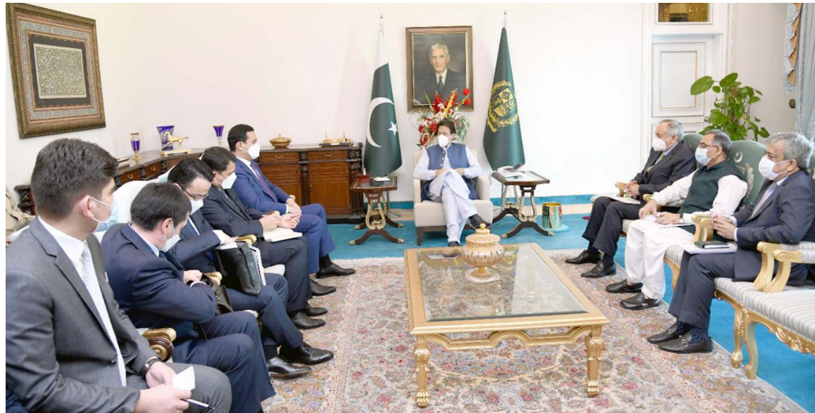
ISLAMABAD: Deputy Prime Minister For Investment and Foreign Economic Relations of Uzbekistan Sardor Umurzaqov called on Prime Minister Imran Khan.