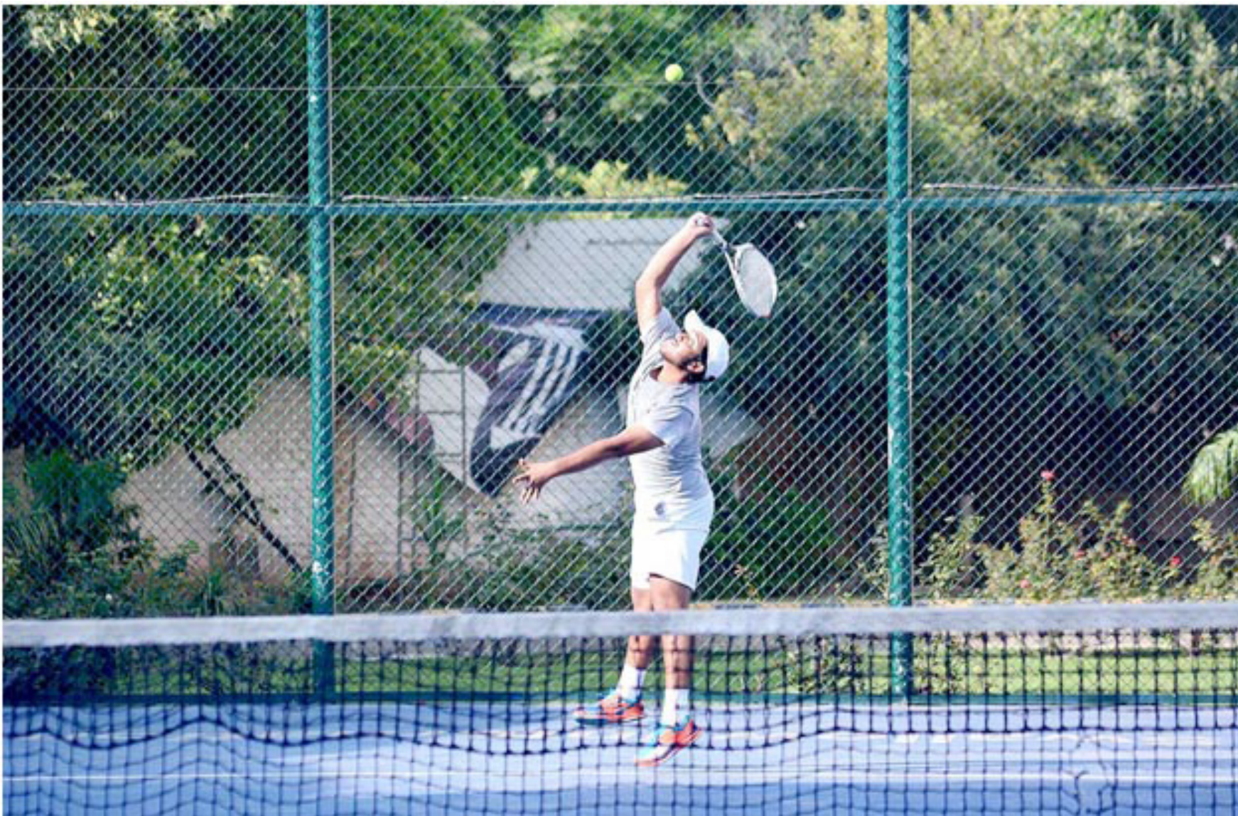
PESHAWAR: Players in action during closing ceremony of tennis coaching training camp at Qayum Sports Complex. — APP

NEW YORK: With crime on the rise, shops and apartments increasingly vacant and homeless people on the sidewalks, New York today mark the 19th anniversary of the September 11, 2001 terrorist attacks in the middle of the coronavirus pandemic and a bitter fight with the White House. The city will hold its annual ceremony in memory of the nearly 3,000 people who died in the bloodiest terrorist attack in US history, punctuated by a minute's silence at the exact moments that Al-Qaeda militants crashed two hijacked airplanes into the World Trade Center towers. Instead of reading out the roll call of the dead, this year the families of victims have recorded themselves. But they will still be present at the "Ground Zero" memorial. The site museum will also open for the first time since the novel coronavirus brought the city to a standstill in March. At most two decades after the attacks, September 11 remains synonymous with New York's heroism and resilience. City leaders have emphasized the latter in the past months as the Covid-19 infection rate – which killed 23,000 people here, the early epicenter of the disease in the United States – has been lowered to under one percent. New York state Governor Andrew Cuomo on Tuesday reminded New Yorkers that their resilience is likely to be tested once again by the social and economic "after-effects" of the pandemic. — APP