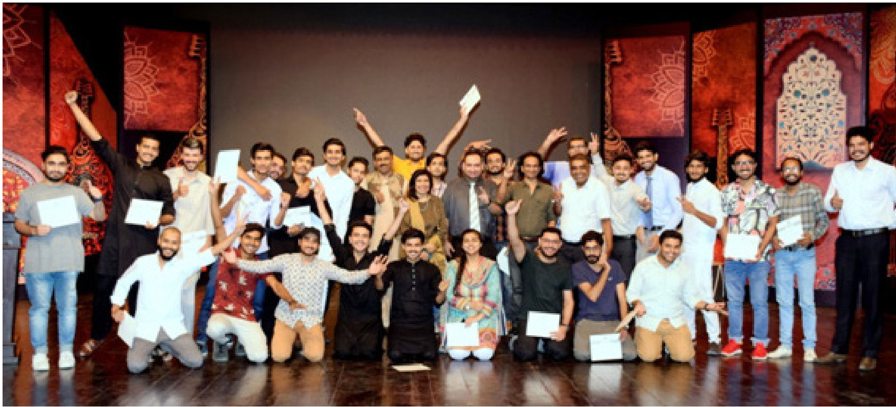
ISLAMABAD: Participants of a three day drama workshop at PNCA pose for a group photo.