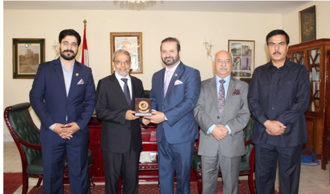
motion of handicrafts and business relations among further promoted with delegations and organizing said bilateral trade and two countries should be the exchange of trade del- exhibitions. He assured