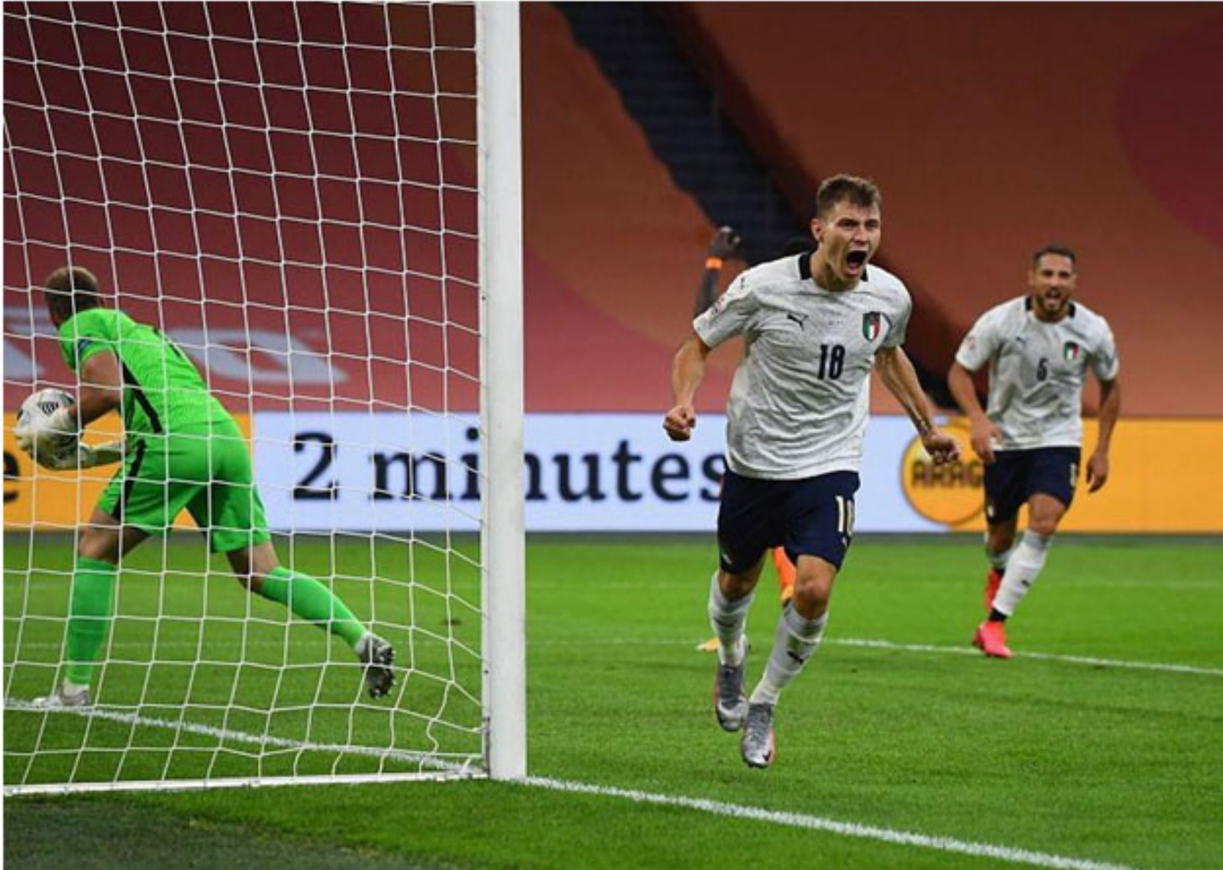
AMSTERDAM: Nicolo Barella celebrates scoring for Italy against Netherlands in Uefa Nations League match.