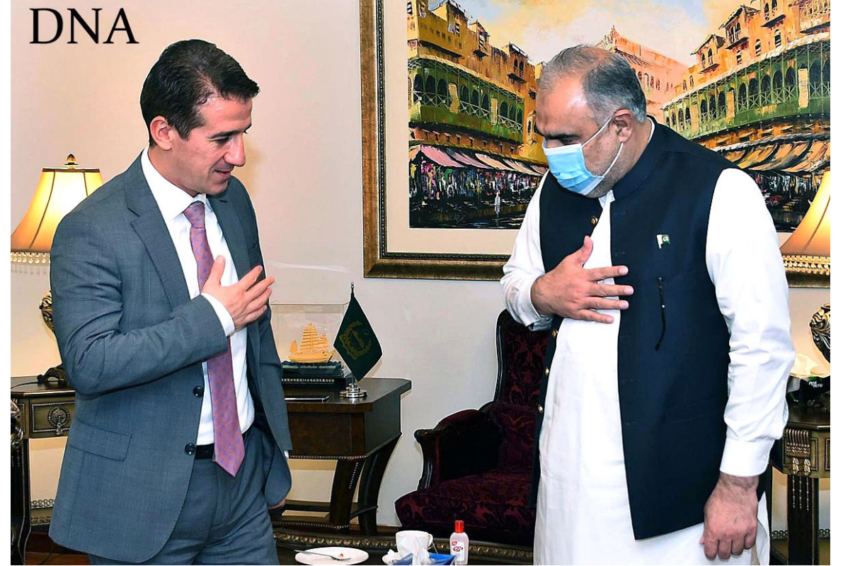
ISLAMABAD: Ambassador of Azerbaijan Ali Alizada meeting with Speaker National Assembly Asad Qaiser.