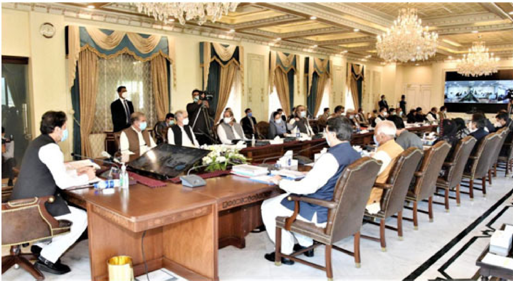
ISLAMABAD: Prime Minister Imran Khan chairs cabinet meeting on Tuesday.

As many as 12 cases were at investigation stage and inquiries of 21 cases were continuing right now. The names of 186 suspects in same cases were put on Exit Control List (ECL). - APP