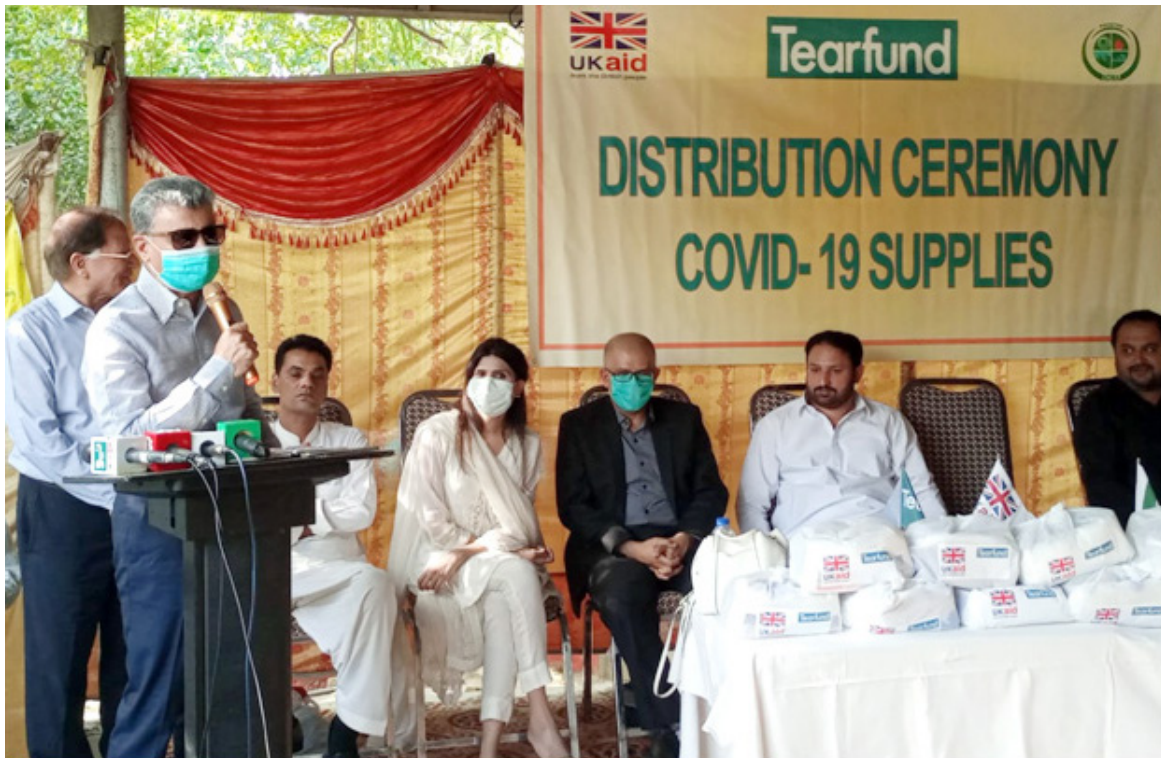
ISLAMABAD: Mayor Islamabad Sheikh Ansar Aziz addressing a function to distribute security kits among sanitary workers.

ISLAMABAD: Islamabad Mayor Sheikh Ansar Aziz has said that sanitary workers should take care of their health along with their work by using corona kit. He expressed these views during distribution of protective kits by the Metropolitan Corporation in sanitary workers. He was accompanied by Deputy Mayor Syed Zeeshan Naqvi, Chairman