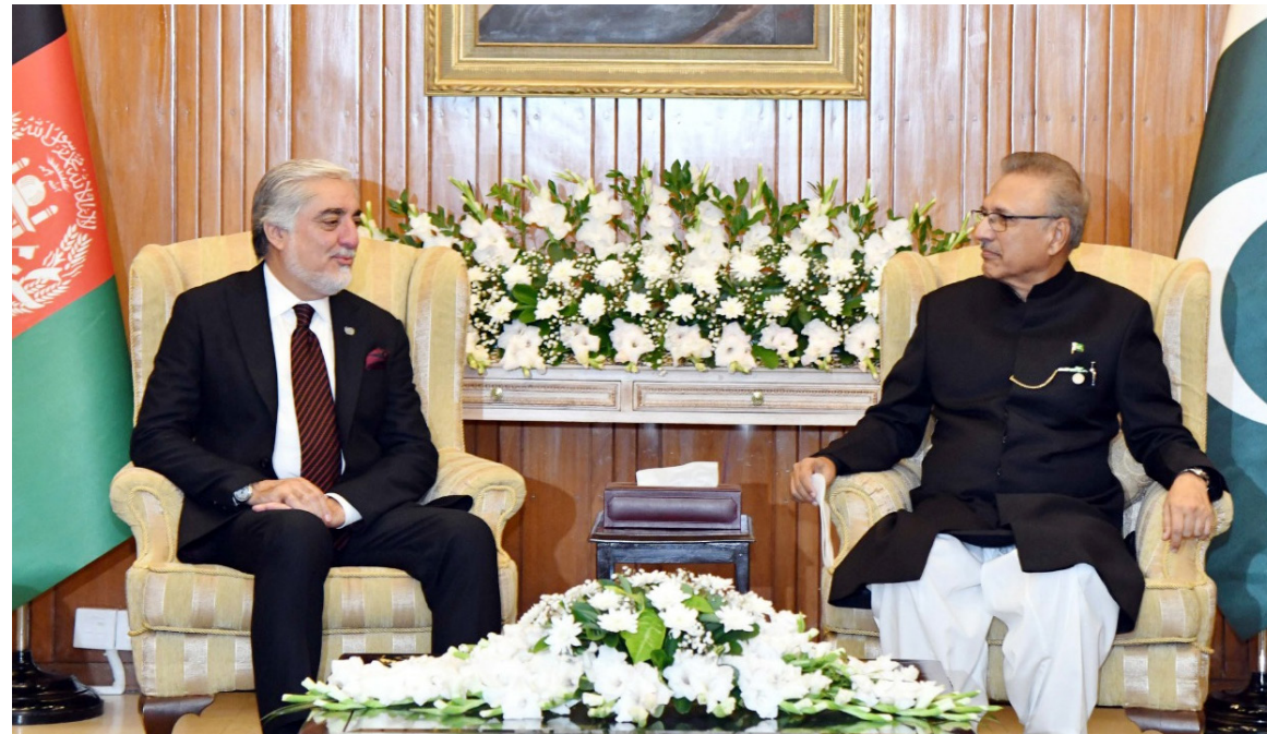
ISLAMABAD: Chairman of the Afghan High Council for National Reconciliation, Dr Abdullah Abdullah called on President of Pakistan, Dr Arif Alvi (News on Page 4).

The ambassador conveyed and reaffirmed commitment of the people and government of Iraq to work closely with Pakistan and further strengthen their bilateral relations, especially in the field of defence.