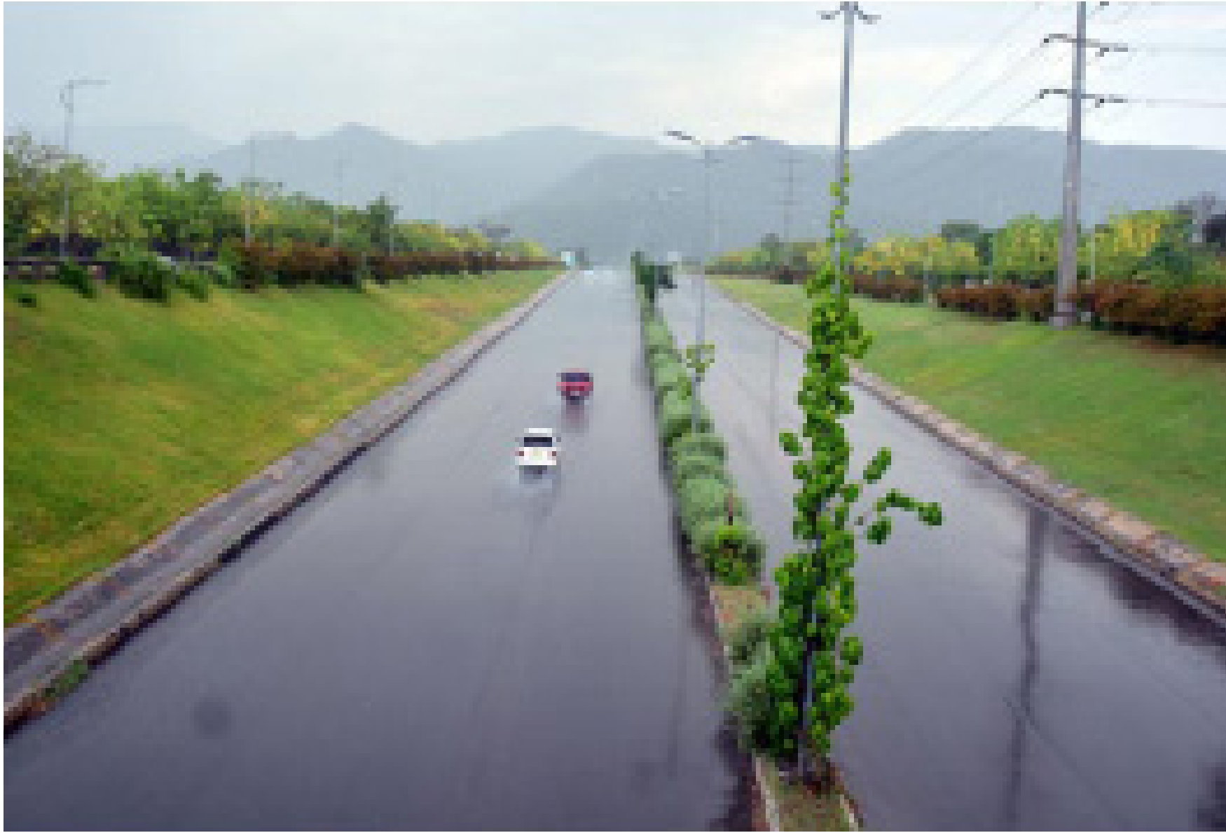
ISLAMABAD: A beautiful view of the capital city after morning rain showers.