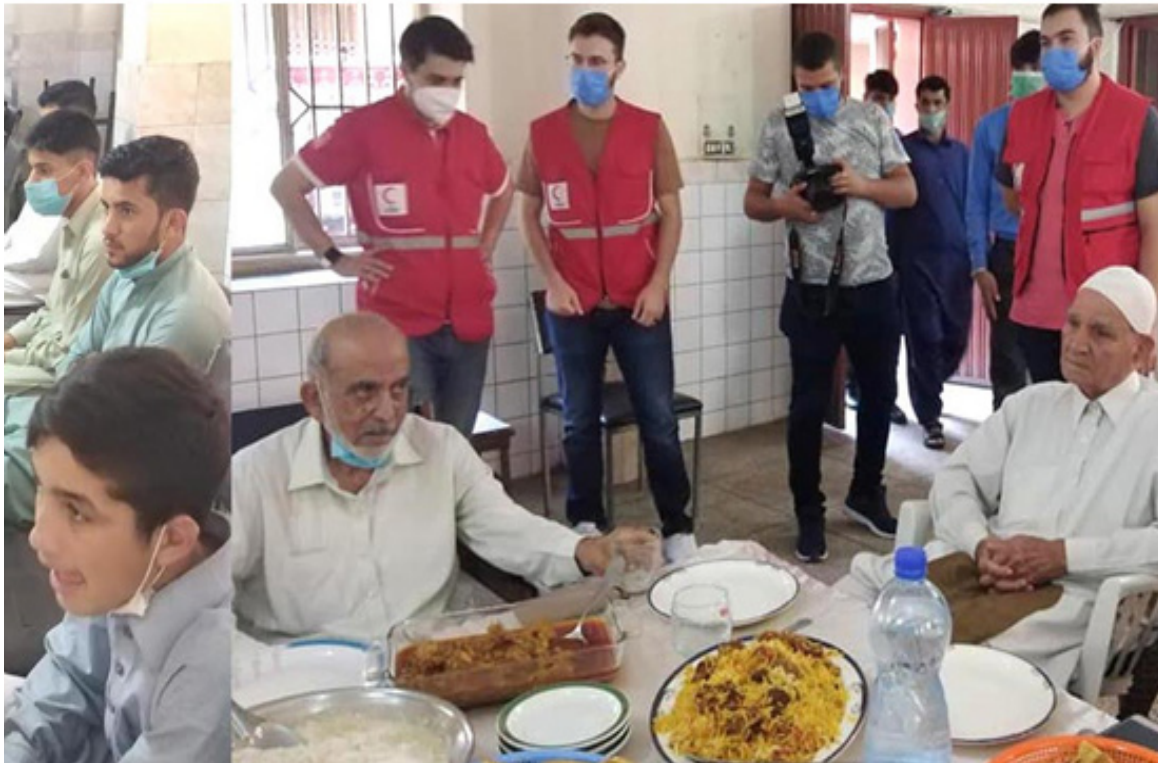
RAWALPINDI: Turkish Red Crescent arranged a dinner for the inmates of Anjuman Faizul Islam.

On September 9, the woman along with her children was waiting for help on the Lahore-Sialkot motorway after her car ran out of fuel when she was forcefully brought out of the car at gunpoint and gang-raped in Gujarpura area on the outskirts of the provincial capital.