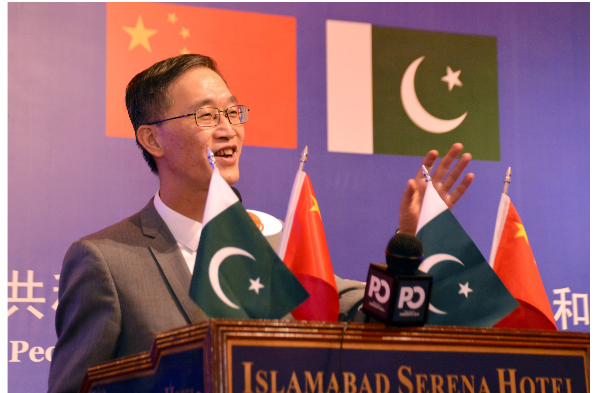
ISLAMABAD: Outgoing Chinese ambassador addressing reception he hosted for Pakistani media.