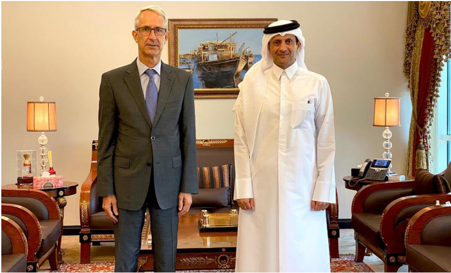
ISLAMABAD: Ambassador of the Netherlands posing for a picture Ambassador of UAE Hamad Al Zaabi.