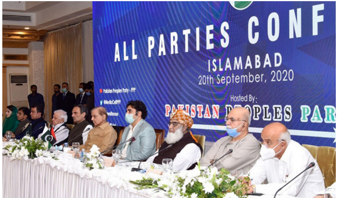
ISLAMABAD: Leaders from the opposition attending All Parties Conference hosted by Pakistan Peoples Party.