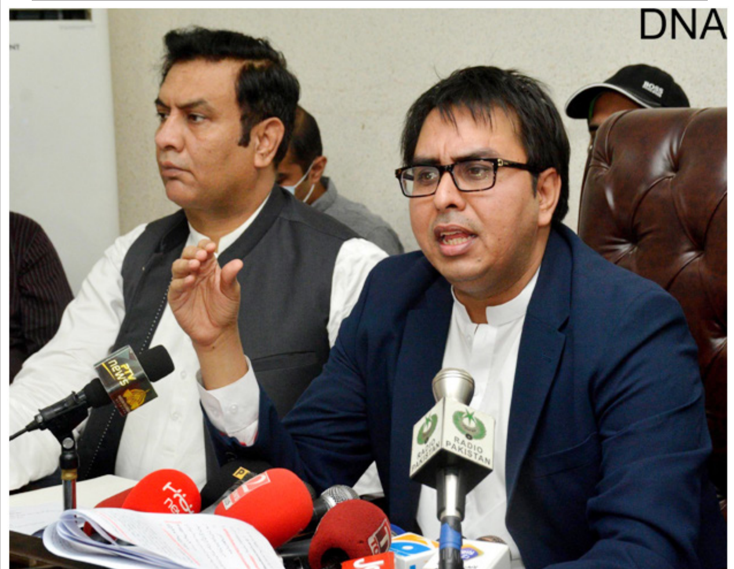
LAHORE: Special Assistant to Prime Minister on Political Communication Shahbaz Gill talking to media.