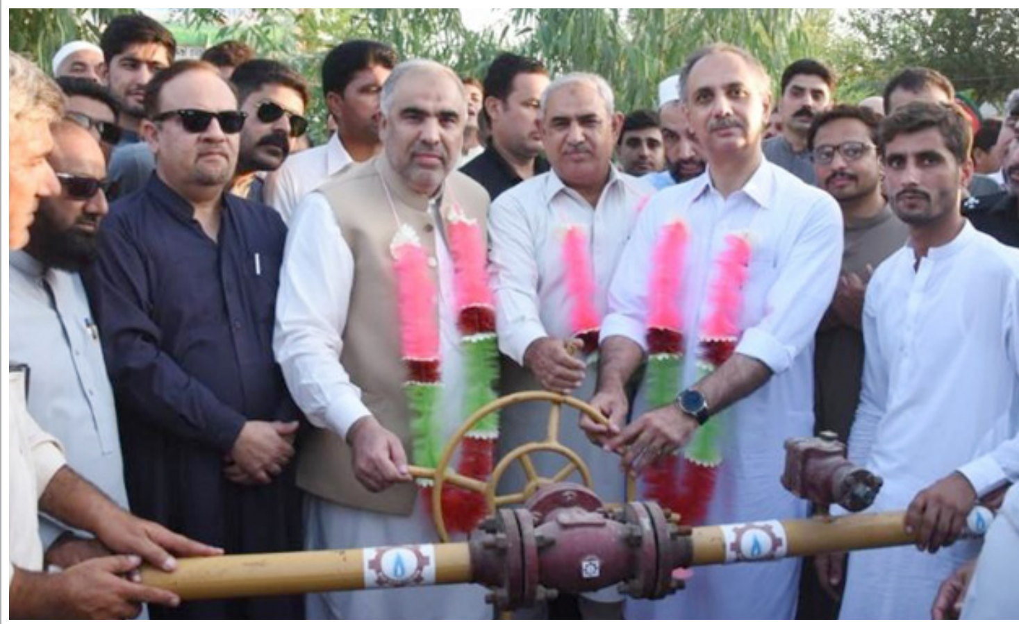
SWABI: Speaker National Assembly Asad Qaiser along with federal minister Omar Ayub Khan inaugurating gas scheme.

crime, instead of handing over the human remains to the families of the victims, the occupation forces had buried them in a graveyard marked for "foreign terrorists."