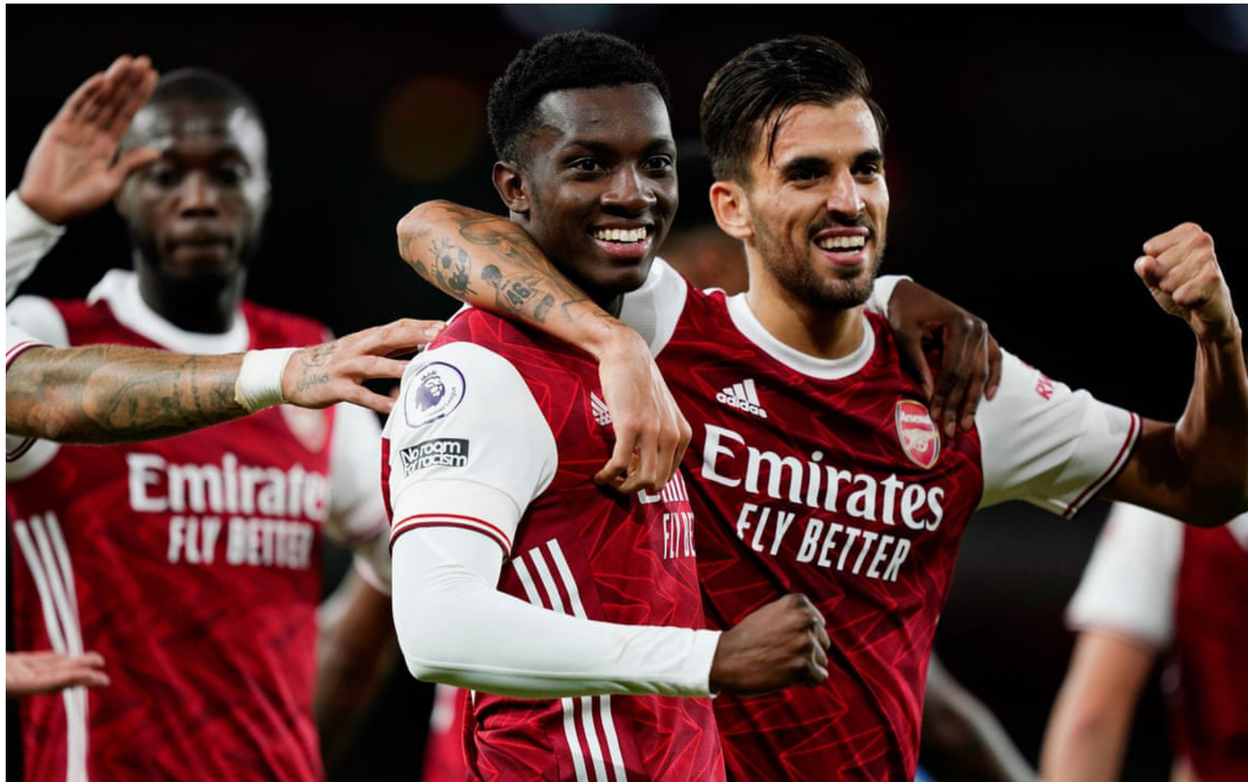
LONDON: Arsenal players celebrating after scoring a goal against West Ham United in a Premier League game.

BERLIN: Thousands of people demonstrated Sunday in Berlin and other German cities, urging the European Union to take in migrants left without shelter after a fire destroyed their biggest camp in Greece. The mask-clad protesters armed with "leave no one behind" posters were joined in the German capital by the aunt of Alan Kurdi, the Syrian boy whose image became a tragic symbol of the 2015 refugee crisis after his body was washed up on a Turkish beach. "I decided to speak up and speak for those who can't speak for themselves... If I can't save my own family, then let's save the others," said Tima Kurdi, urging people to write to politicians to push for action. "We can't close our eyes and turn our backs and walk away from them. People are people, no matter where we come from," she added. Sonya Bobrik of the activist group Seebroecke also stressed that "we have space" to take in more than the 1,500 refugees now in Greece that Germany has so far promised to welcome. Police said around 5,000 people turned up at the Berlin rally.