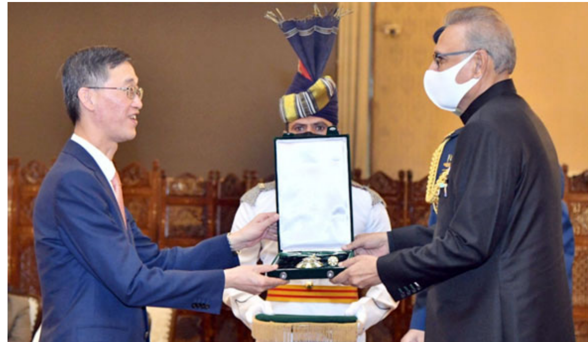
ISLAMABAD: President Dr. Arif Alvi conferring 'Hilal-e-Pakistan' on the outgoing Chinese Ambassador Mr. Yao Jing, at Aiwan-e-Sadr on Tuesday.