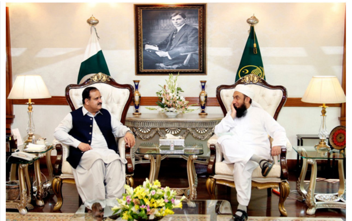
LAHORE: Chief Minister Usman Buzdar meeting with religious scholar Molana Tariq Jamil.

PESHAWAR: Minister for Local Government and Rural Development Khyber Pakhtunkhwa Akbar Ayub Khan on Tuesday took charge of his office after taking oath. The new minister was given a detailed briefing about functions and mandate of the department. Addressing the officers, he expressed gratitude to the high leadership for assigning local government and rural development department portfolio, adding he made every effort for the uplift of education sector and continued reforms process in line with the vision of Prime Minister Imran Khan. He also expressed thanks to the staff of the education department for extending their support in implementation of reforms and cooperation in routine work. He vowed to do extra for development of local government and rural development department, adding he would ensure timely completion of masses' welfare-oriented projects besides launching new projects. He said more focus would be given on the development of the merged tribal districts so that its people could get benefits in wake of the merger. He said that work on digitalization policy would be further expedited. He said that local government sector played a key role in prosperity and development of province and added that its importance with regard to resolution of public problems could not be overlooked.