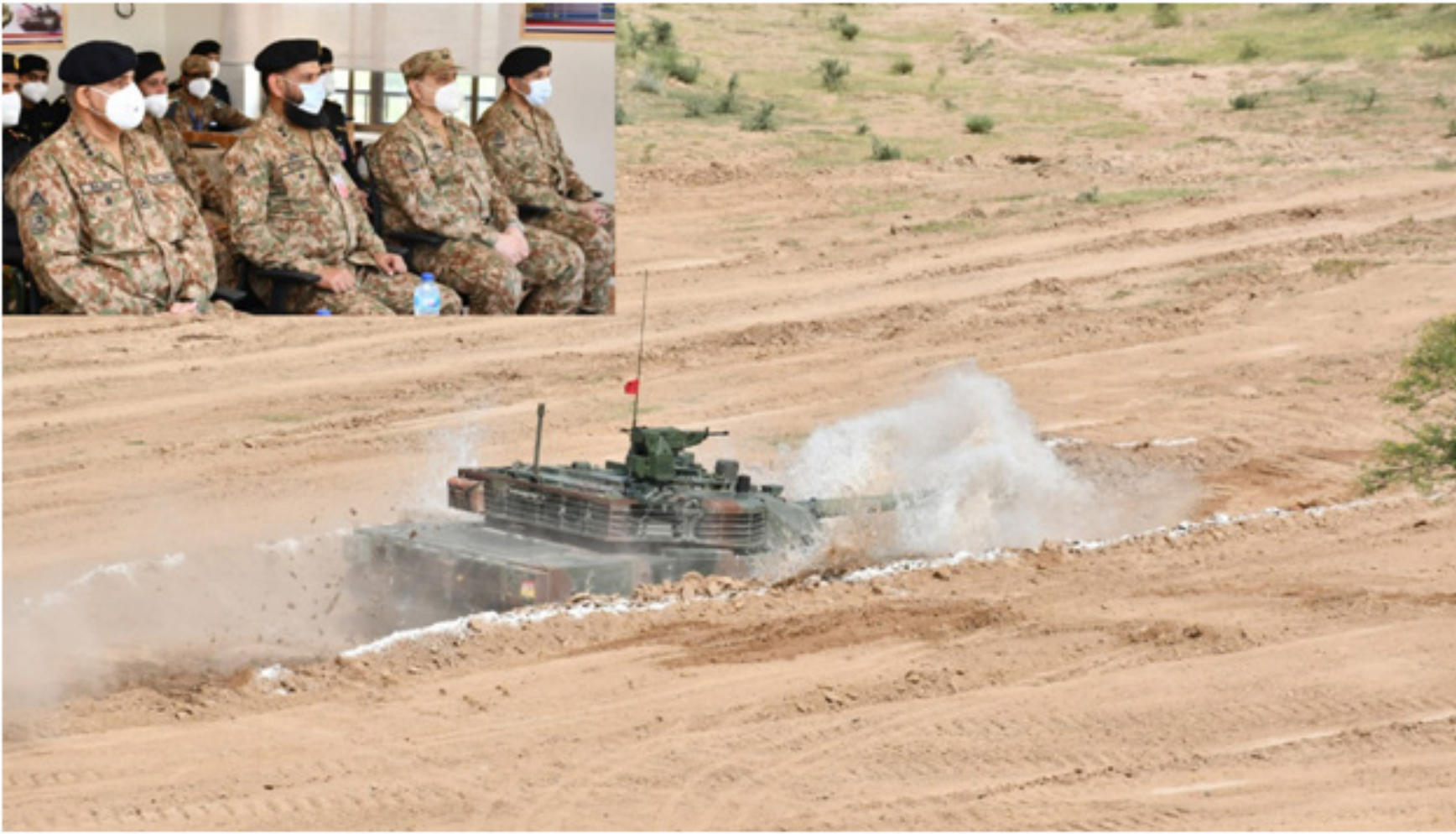
JHELUM: Chief of Army Staff (COAS) General Qamar Javed Bajwa witnessing demonstration of state of the art, Chinese origin third generation Main Battle Tank VT-4.

From Page 01 Tank VT-4, another addition to inventory of Armoured Corps after recent induction of indigenously produced Al-Khalid-1 Tank. It has further strengthened Pakistan's overall defence capability to thwart enemy designs. COAS said that Pakistan Army is alive to emerging challenges and regional threats. We are completely focused towards internal and external challenges to defence of country and prepared with matching response against all threats to sovereignty, security and territorial integrity of Pakistan. COAS lauded troops for professionalism, operational readiness and highest training standards to meet challenges of modern day battlefield requirements. Earlier, Corps Commander Mangla, Lieutenant General Shaheen Mazher Mehmood received COAS at Tilla Field Firing Ranges.