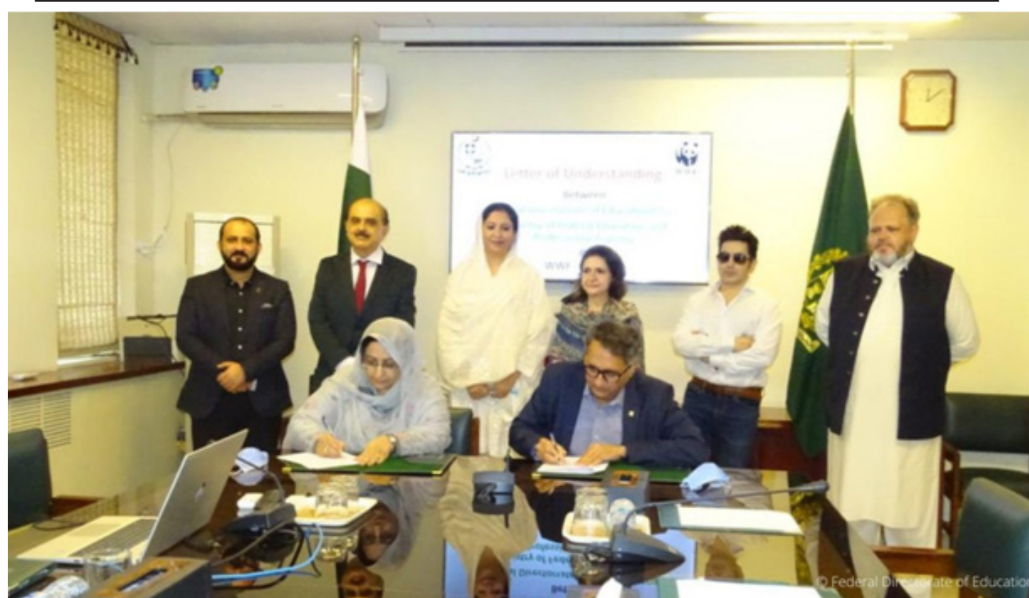
ISLAMABAD: WWF-Pakistan, Federal Directorate of Education sign Letter of Understanding to enhance capacity building & promoting sustainable practices among the youth by utilizing interactive & digital platforms.

ISLAMABAD: Federal Department of Archeology and Museums (DOAM) has planned to arrange two-day online international training course on 'cultural heritage preservation' for young professionals from October 1st. According to an official of DOAM, the event is being organized with an aim to enhance skills of Pakistani youth for the actual usage of 3D photogrammetry for the documentation of cultural heritage. He said that young heritage professionals from Iran, Pakistan, Nepal and Cambodia would participate in the course being arranged with the support of Tokyo National Research Institute of Cultural Properties and Japanese Centre for South Asian Cultural Heritage.