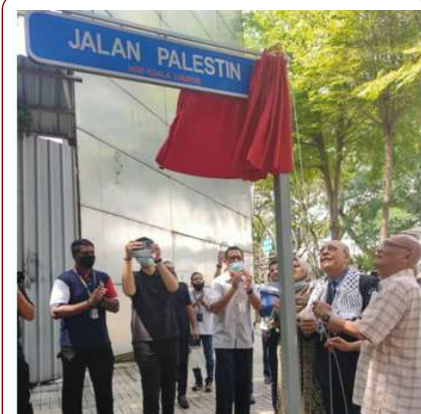
KUALA LUMPUR (DNA) The Mayor of Kuala Lumpur and Ambassador of the state of Palestine officially inaugurated the Street of Palestine "Jalan Palestine" in the heart of the city centre of Kuala Lumpur. This assures and extends the bilateral relations between the two brotherly nations and affirms on Malaysia and the Malaysian's support to Palestine and the Palestinian's.