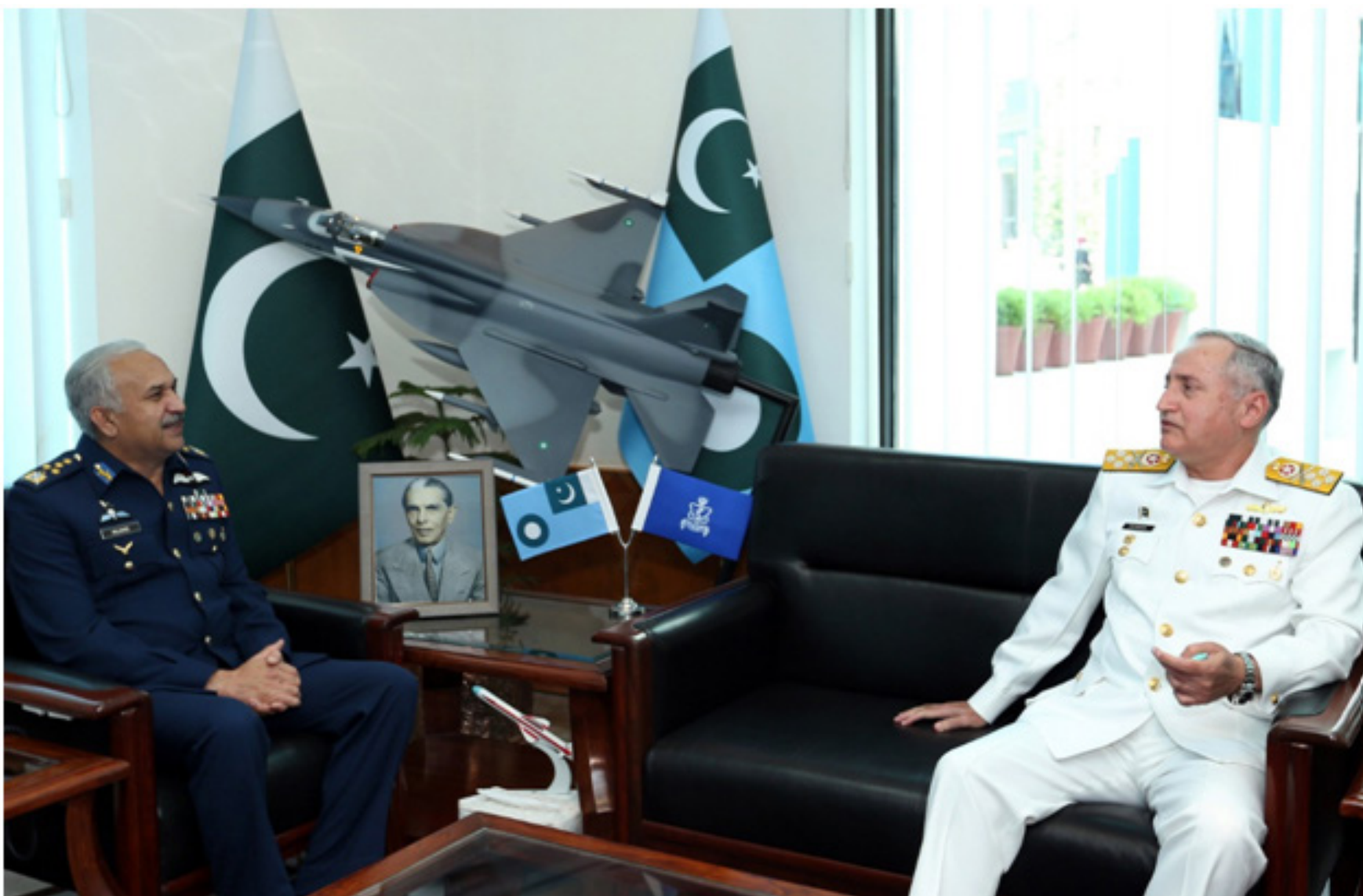
ISLAMABAD: Chief of Naval Staff, Admiral Zafar Mahmood Abbasi calling on Air Chief Marshal Mujahid Khan, Chief of Air Staff, Pakistan Air Force at Air Headquarters.

ISLAMABAD: Civil Aviation Authority (CAA) has issued new SOPs for international flights and charter flights. The new rules and regulations will be applicable from October 5 to December 31. According to details, there are 2 categories of countries around the world for COVID-19 risk assessment. PCR test will not be required for passengers coming from Category 'A' countries. Category A includes 38 countries, including Australia, Canada, China, Singapore, Germany and Japan, while Category 'B' passengers will be required to show the COVID-19 PCR test. Passengers coming to Pakistan will be required to download the Pass Track mobile application. Passengers will not be able to obtain a boarding pass without entering their personal details in the application. A print out of the details mentioned in the application has to be submitted for obtaining boarding pass. All passengers and crew must also submit a health declaration form before boarding. Prior to boarding passengers, the aircraft must be disinfected in accordance with SOPs.