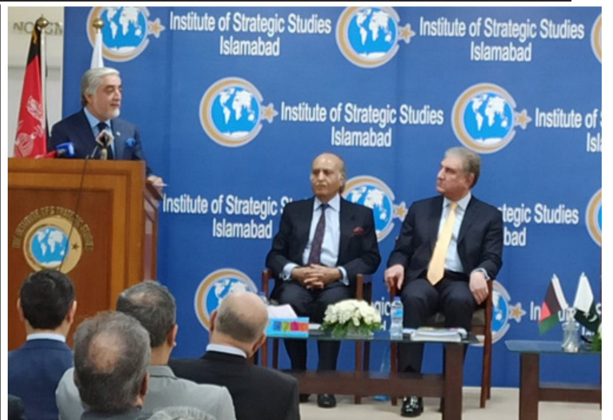
ISLAMABAD: Dr. Abdullah Abdullah Chairman Afghan Reconciliation Council speaks at ISSI during a seminar on Afghanistan.