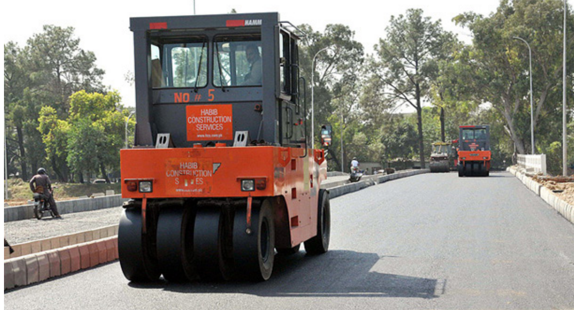
ISLAMABAD: Construction work of underpass underway near Zero Point connecting G-7 with G-8 sectors at Faisal Avenue.

versities abroad. Similarly, Partial Support for PhD Studies Abroad is an initiative aimed at providing financial support up to US $ 10,000 to Pakistani scholars who are in final stages of their PhD Studies abroad and need partial support e.g. tuition, thesis evaluation/ submission fee, living expenditure, etc. without which their PhD degree programme will remain incomplete.