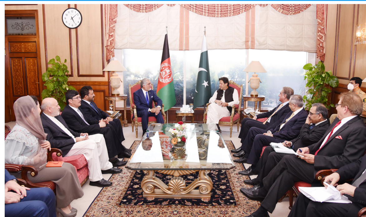
ISLAMABAD: Chairman High Council for National Reconciliation of Afghanistan, Dr Abdullah Abdullah called on Prime Minister Imran Khan.

These meetings were also participated by some officials from the ministry of Finance as well. Advisor to the Prime Minister on Finance Hafiz Sheikh who by designation is the Chairman of CCoE and he did not take the issue lightly. In his opinion any meetings of the members of the CCoE can only be held with him in the chair. Hafiz Sheikh reportedly informed the Prime Minister about this violation of the procedures. PM Imran Khan then spoke to the minister for Privatization and told him to take Hafiz Sheikh into confidence over such matters and not hold meetings of the CCoE members.