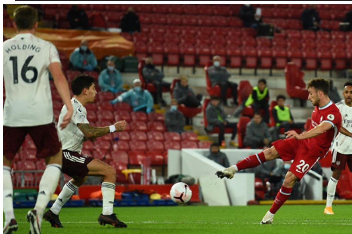
LONDON: Players trying to chase football in a premier league match between Arsenal and Liverpool.

UN Security Council and two UN General Assembly resolutions, as well as many international organizations, demand the withdrawal of the occupying forces. The OSCE Minsk Group - co-chaired by France, Russia and the US - was formed in 1992 to find a peaceful solution to the conflict, but to no avail. A cease-fire, however, was agreed upon in 1994. France, Russia and NATO, among others, have urged an immediate halt to clashes in the occupied region.