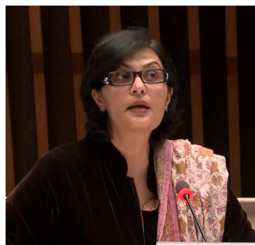
families residing in 219 villages across the LoC. "All families in 219 villages across LoC in AJK are under the persistent risk of unprovoked attacks and have sacrificed their lives, livestock, and properties. All families in these villages have been included in the Ehsaas program", said Dr. Nishtar.

ISLAMABAD: Prime Minister's Special Assistant on Social Protection and Poverty Alleviation, Dr. Sania Nishtar visited the Jura sector near the Line of Control in Neelum Valley to review arrangements for Ehsaas Cash disbursement to all families residing in villages around the Line of Control (LoC). Dr. Nishtar also oversaw digital disbursement of Rs 12,000 Ehsaas Cash handouts to vulnerable families living along the LoC in Azad Jammu and Kashmir (AJK), said a news release issued here. Dr. Nishtar interacted with women who came at the Jura Bazar site to collect cash grants. Under Ehsaas, the government is disbursing some Rs. three billion among all the