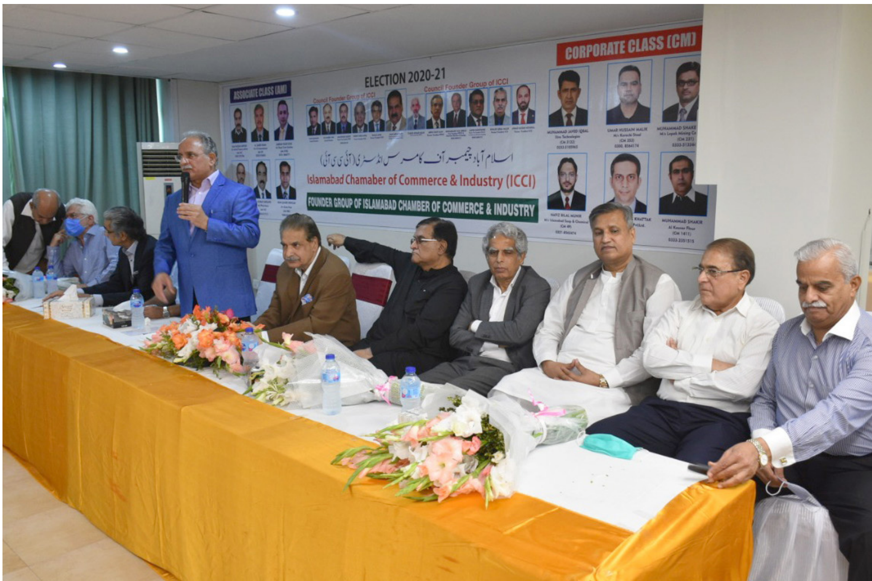
ISLAMABAD: Leaders of Founder Group met in Islamabad to finalize candidates for the upcoming elections of Islamabad Chamber of Commerce and Industry.