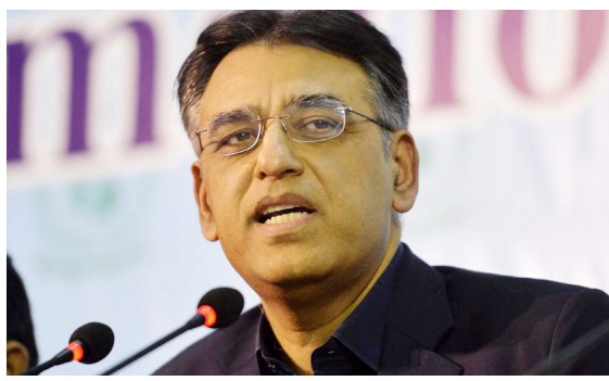
prior to the plan's announcement. He said that one factor that is central to Karachi's progress is that everyone "keep politics aside and work together on one platform with serving the people in mind"