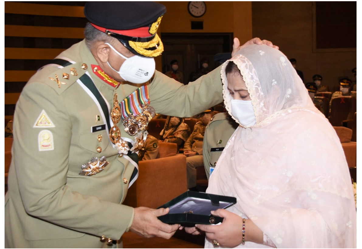
RAWALPINDI: A RAWALPINDI, Army Chief General Qamar Javed Bajwa conferred military awards during an investiture ceremony held at GHQ.

Condemning the deplorable targeting of innocent civilians by the Indian occupation forces, it was underscored that such senseless acts are in clear violation of the 2003 Ceasefire Understanding, and are also against all established humanitarian norms and professional military conduct. These egregious violations of international law reflect consistent Indian attempts to escalate the situation along the LoC and are a threat to regional peace and security.