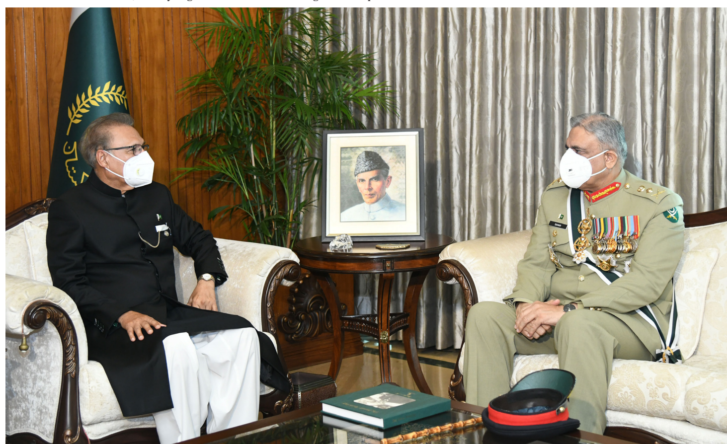
ISLAMABAD: Chief of Army Staff (COAS) General Qamar Javed Bajwa called on President Dr. Arif Alvi.

impact and outcome of the development projects must be kept in view in the execution of projects. Focus of projects' monitoring must be on quality of work and upholding the required standard. He also briefed the graduate engineers about the techniques of data's collection for proper monitoring of the projects. He also told them about the designing and monitoring system and different mode of projects' execution for achieving the desired results.