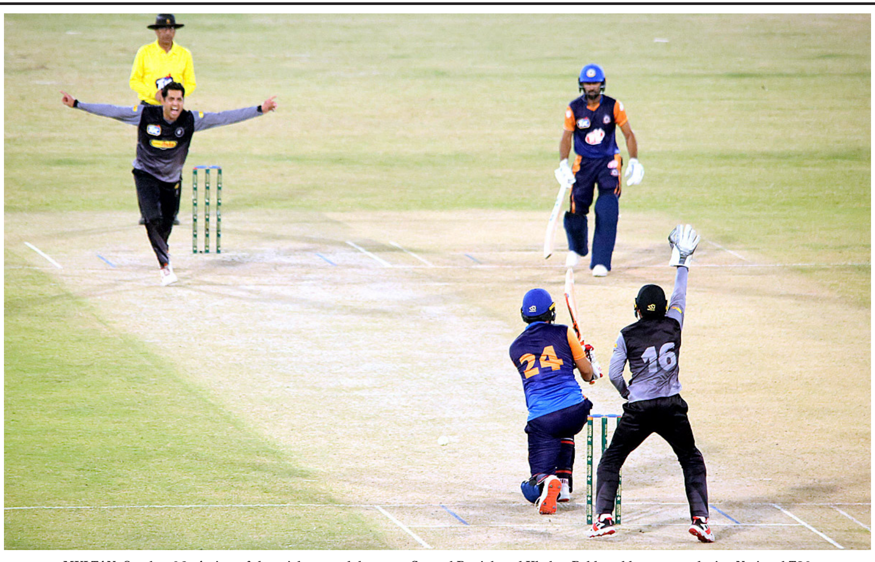
MULTAN: October 06 - A view of the cricket match between Central Punjab and Khyber Pakhtunkhwa teams during National T20 Cup played at Multan Cricket Stadium. Khyber Pakhtunkhwa team won the match by 29 runs.

Afridi achieved this feat on Monday during his domestic side KP's National T20 Cup match against Sindh. Shaheen finished with 5 for 21. This takes his T20 wickets tally in the year to 36, three more than Afghanistan's spinner Rashid Khan. With Rashid remains in action Indian Premier during League and Shaheen's busi ness in National T20 continues, the race between these two is likely to pace up in days to come. Pakistan's Haris Rauf and Shadab Khan, both with 31 wickets each, are following Rashid Khan on the table. The 5-fer against Sindh on Monday was his career's 4th 5 wicket haul. Only Lasith Malinga has more T20 5-fers. The Sri Lankan fast bowler has five 5-wicket hauls to his credit.