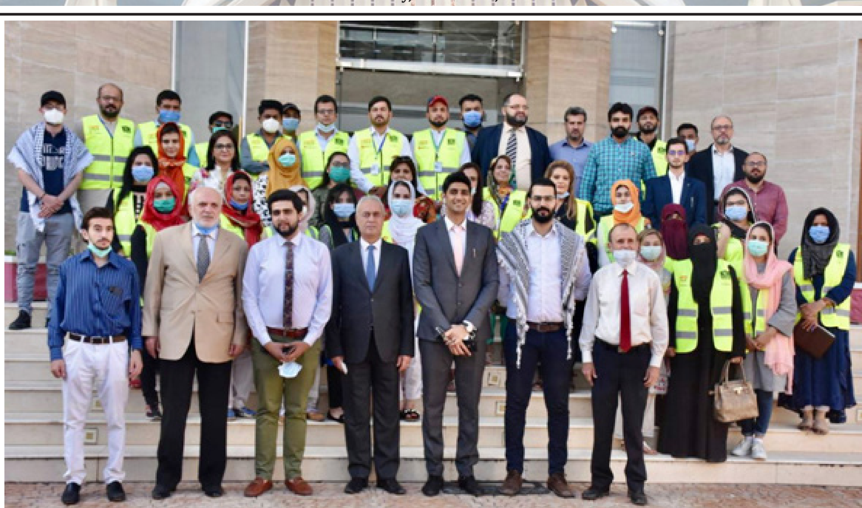
ISLAMABAD: Ambassador of Palestine Ahmed Rabei in a group photo with members of the tiger force who visited the embassy.

Riaz Khan ordered all concerned departments to take concrete measures for the timely completion of the project. He also directed to make a comprehensive plan to protect the road from flash flood and also construct a sewerage system on both sides of the roads. Commissioner directed departments prohibit overloading, identify encroachment on either side of the KKH and remove it immediately, also remove electricity and PTCL poles, water supply and sui gas pipelines. creating hurdles in traffic flow.- APP