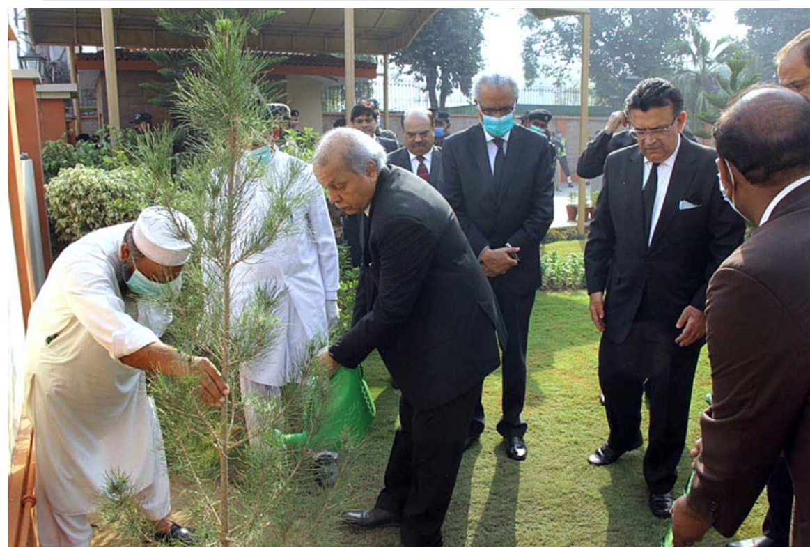
PESHAWAR: Chief Justice of Pakistan Justice Gulzar Ahmed along with other judges of Supreme court planting a sapling tree in premises of Supreme court branch registry.

two deaths by the disease in the last 24 hours. Punjab Chief Minister Usman Buzdar in a statement today said that the province has 1521 active cases of coronavirus. He said Punjab has overall 10,02,72 cases of novel coronavirus, while 96,506 patients have recovered to health. "In the last 24 hours two patients died by COVID-19, while the total count of deaths by the disease in Punjab has been 2,247," the chief minister said.