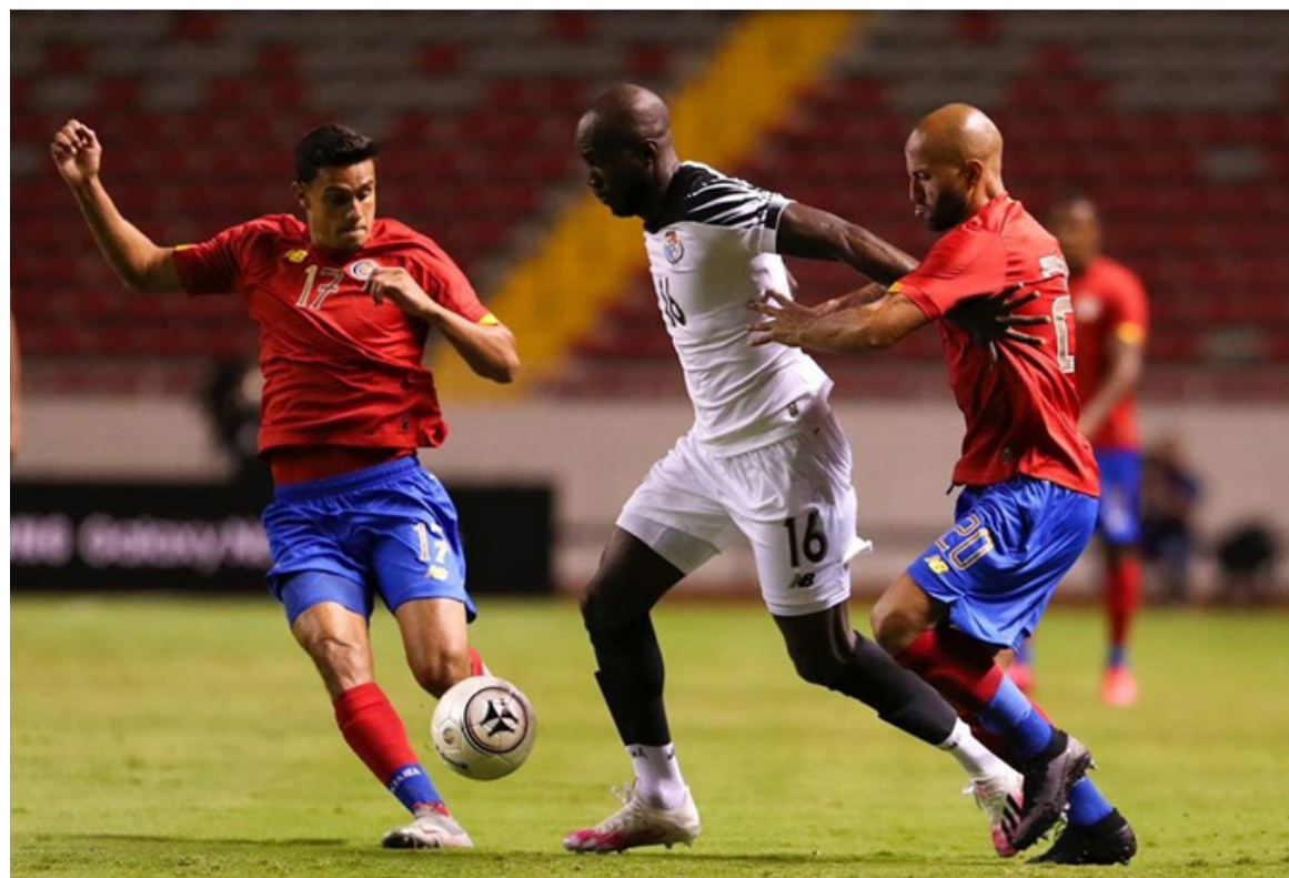
SAN JOSE: Players battling for the possession of the ball during a match between Panama and Costa Rica.