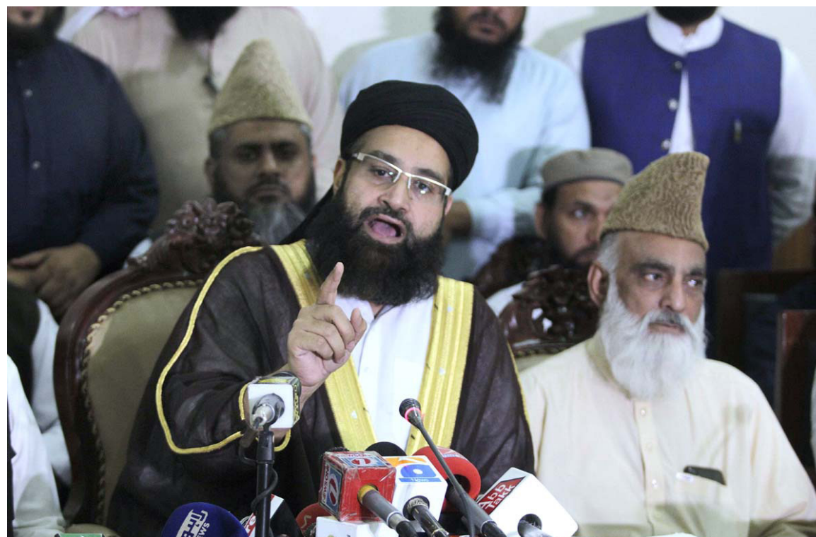
LAHORE: Special Assiatnt to Prime Minister on religious harmony, Maulana Tahir Ashrafi addressing a press conference.

global media, to take full cognizance of the consistently aggravating situation in IIOJK and hold India accountable for egregious human rights violations and war crimes in the occupied territory," he said. He also urged the world community to work for peaceful resolution of the Jammu and Kashmir dispute in accordance with the relevant UNSC Resolutions and wishes of the Kashmiri people for durable peace and stability of the region.