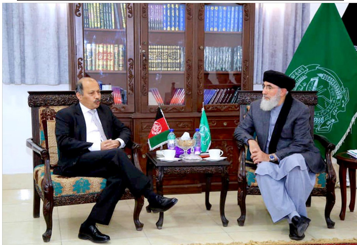
KABUL: Ambassador of Pakistan to Afghanistan, Mansoor Khan calls on, leader of Hizb-e-Islami, Gulbadin Hekmayar.

complement will resign. The current government of the country in full force will lay down its powers before the newly elected president of the republic, in accordance with the norms of the constitutional law of Tajikistan "On government". The government of Tajikistan consists of the Prime Minister, his first deputy and deputies, ministers, chairmen of state committees. In Tajikistan, the president is also the head of government.