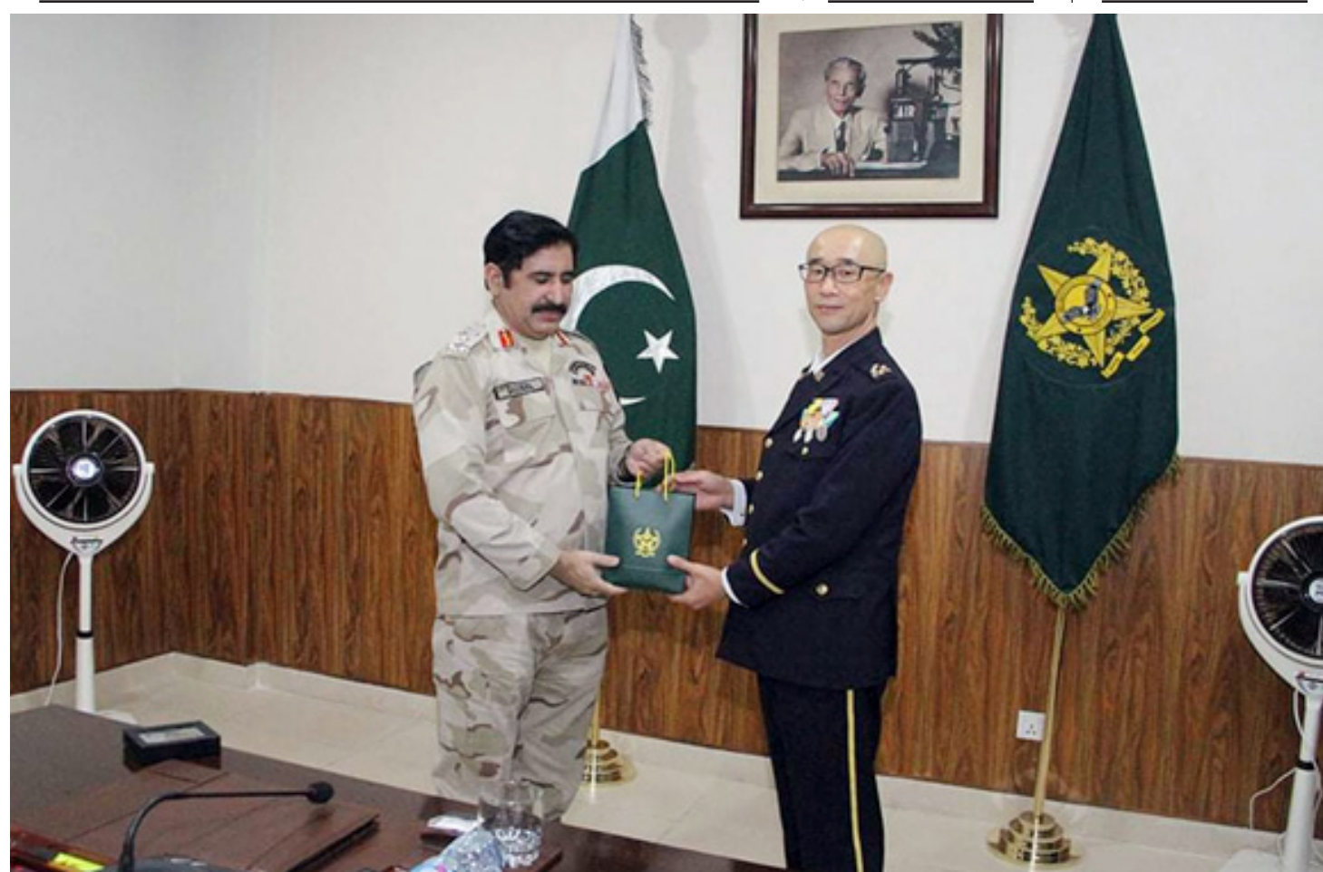
ISLAMABAD: Col Yamamoto Hidetaka (Defence Attaché), Embassy of Japan Pakistan being presented a gift during Pak Japan Bilateral Counter Narcotics Meeting.

ISLAMABAD: Pakistan Railways has upgraded as many as 620 coaches from its own resources to increase revenue of the department and facilitate its passengers for comfortable travel during the last three years. Giving the year wise breakup of the upgraded coaches, an official in the Ministry of Railways told APP that 168 coaches were upgraded in 2016-17, 192 in 2017-18 and 260 coaches in 2018-19. Regarding the availability of coaches, he said that at present around 472 coaches were out of service or non-functional, which needed heavy or light repair. Giving details about the repair, the official said that 39 coaches of Pakistan Railways under survey of condemnations being over-aged and beyond economical repair. The official said that 205 coaches were available in workshops under periodical overhauling and nominated repair. Around 228 coaches available in Lahore division and in Carriage Factory and C&W Shops held up since long for repairs. — APP