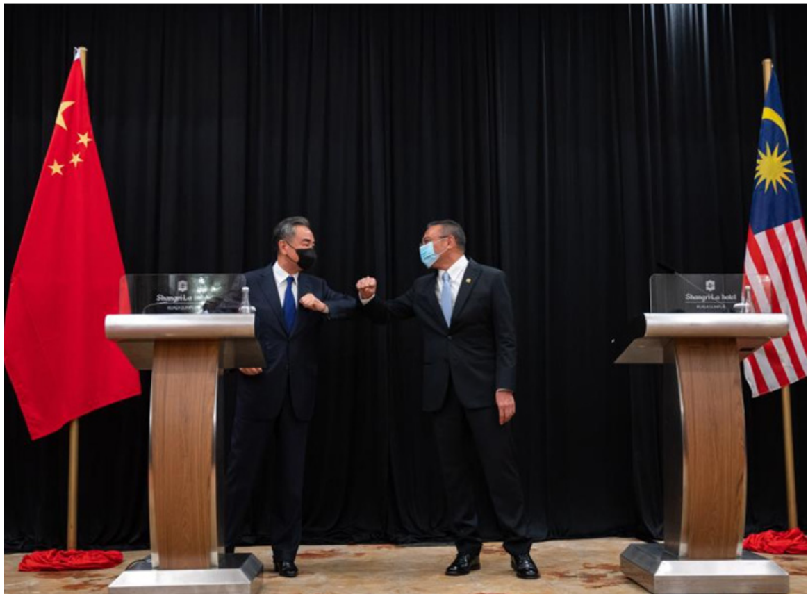
KUALA LAMPUR: China and Malaysia have reached consensus on a wide range, said Chinese FM Wang Yi at a press conference with Malaysian FM Hishammuddin. Both countries have agreed to build an open world economy. China welcomes Malaysia to continue taking an active part in CAEXPO.

A presentation of projects to expand the production of textile products and create a value chain in the light industry was held. During the visit to Sardoba district on May 15, 2020, the Head of the state laid the first stone for construction of new houses in Dustlik mahalla. 37 five-storey buildings with 1,480 apartments were built here in a short time. Today, President Shavkat Mirziyoyev got acquainted with this modern neighborhood. Apartments in five-storey buildings consist of two and three rooms. Energy-saving materials were used in construction of housing.