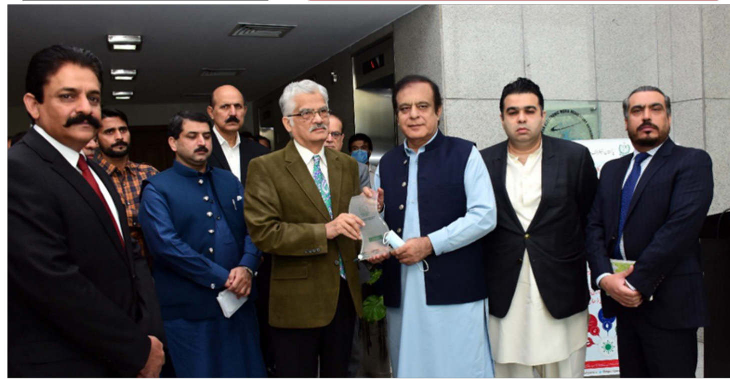
ISLAMABAD: Senator Shibli Faraz, Federal Minister for Information visited PEMRA Headquarters today. Muhammad Saleem Baig, Chairman, briefed about Authority's working. Senior officers of Ministry & PEMRA were also present. — DNA

RAWALPINDI: The child labour department launched a crackdown against child labour working in brick-kilns in different areas of the district on Wednesday. According to an official, the constituted teams conducted crackdown at 21 brick-kilns but no child was found working there. The owners of mills, factories, brick kilns, shops and workshops are directed to avoid it, otherwise department would take prompt action if child labour was found anywhere in the district including shops, workshops and markets, official said. He said child labour has been prohibited strictly under the law in Pakistan.8 — APP