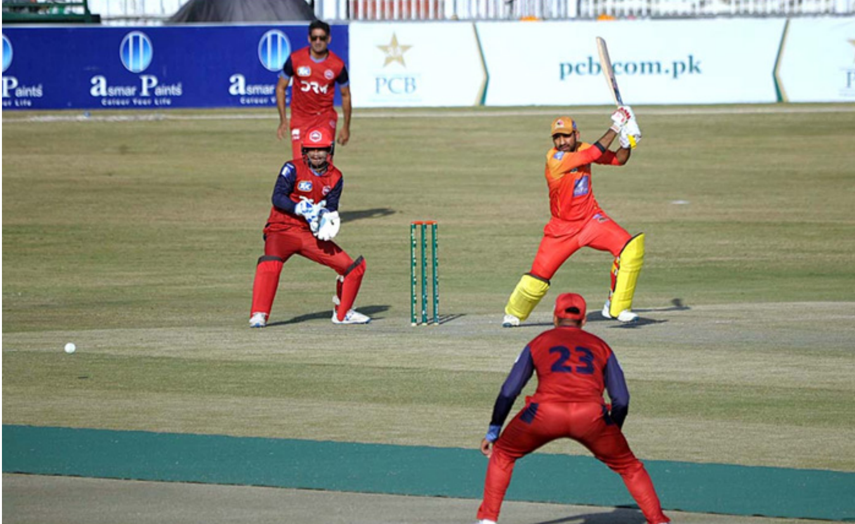
RAWALPINDI: A view of cricket match between Northern and Sindh teams during National T20 Cup at Pindi cricket stadium.

ISTANBUL: Turkey's ruling party spokesman called on countries Tuesday not to apply a double standard in favor of Armenia regarding its recent clashes with Azerbaijan and a cease-fire agreement. "The ceasefire calls of those who do not raise their voices against Armenia, which is a rogue state, is to put the cruel and the suffering in the same equation, to view the occupying and the occupied [state] equally," Omer Celik, spokesman for the Justice and Development (AK) Party, said during a meeting of the Central Decision and Executive Board at party headquarters in the capital Ankara. "This is also a clear violation of the law," he added, underlining that this attitude shows a double standard. He stressed that the Minsk Group tries to manage the process by considering Armenia and Azerbaijan on equal levels, but there are no two equals in this issue. "The party that clearly violates international law, including the 1949 Geneva Convention, is the Armenian side," he said. —DNA