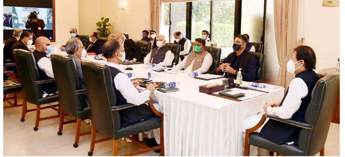
ISLAMABAD: Prime Minister Imran Khan chairs a meeting on development initiatives.