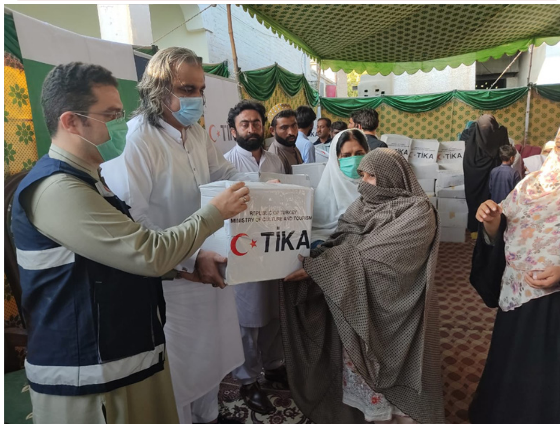
DERA ISMAIL KHAN: Ali Amin Khan Gandapur, Minister for Kashmir Affairs and Gilgit Baltistan distributing food packets among the families with low income, sponsored by TIKA.