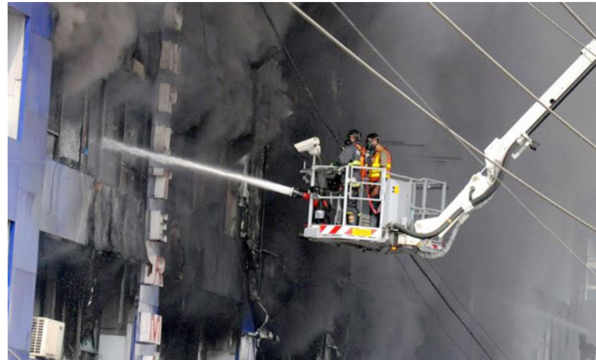
LAHORE: Firefighters struggling to extinguish fire erupted at Hafeez Centre.