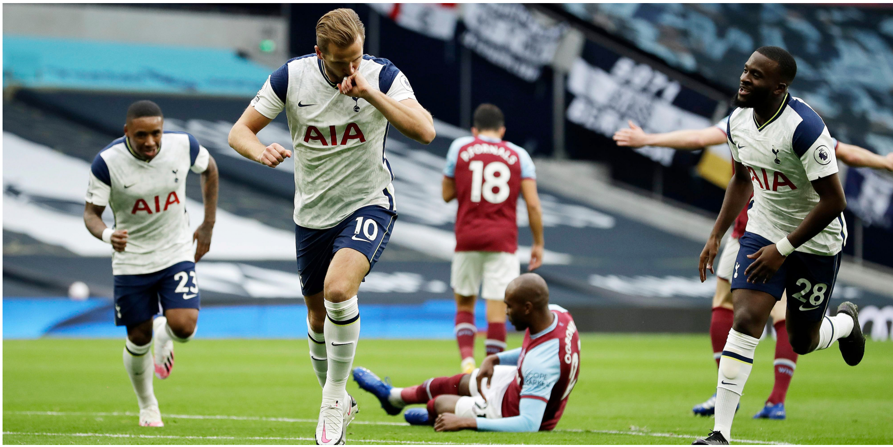
LONDON: Harry Kane of Tottenham Hotspur celebrates after scoring a goal against West Ham United in Premier League game.

In 1998 he was designated as head of the division of personnel. Between 2000 and 2004 he served in Permanent Representation of Brazil to the United Nations in Geneva as First Secretary and Counselor responsible for human rights, humanitarian and environmental affairs. Between 2015 and 2020 he was the Minister Counselor and Deputy Head of Mission at the Permanent Representation of Brazil to the Council of the United Nations International Civil Aviation Organization. In 2015 he presented a thesis titled International Refugees Protection: the use of resettlement in third countries as the least solution and burden sharing to the program of high studies at the Brazilian diplomatic academy.