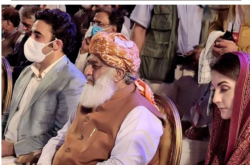
KARACHI: PDM Chairman Maulana Fazalur Rehman, PPP Chairman Bilawal Bhutto Zardari and PML N leader Maryam Nawaz share stage during PDM procession in Bagh-e-Jinnah Karachi.

ISLAMABAD: The emerging trend of targeting state institutions and dragging those into political rivalries is totally uncalled for as armed forces have nothing to do with any political process in the country, a senior security official said on Sunday. "Nawaz Sharif's attack on military leadership is in fact attack on the Pakistan Army. This is the same thing Indian Prime Minister Narendra Modi is talking about," he said. "Indian newspapers are praising Nawaz Sharif and giving extraordinary coverage to his anti-army statements. PML-N's agenda is gradually coming before the masses. Nawaz Sharif is playing in the hands of the enemies of Pakistan," the official said. The comments were made days after Pakistan-Muslim League-Nawaz chief Nawaz Sharif hurled baseless allegation against the military leadership at a rally of PDM in Gujranwala. - APP