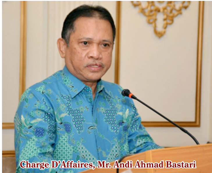
Charge D'Affaires, Mr. Andi Ahmad Bastari

Indonesia has been ranked as the ninth-fastest growing tourist sector in the world, the third-fastest growing in Asia, fastest-growing in Southeast Asia and the destination of about 16.10 million foreign tourists in 2019: Deny Basuki