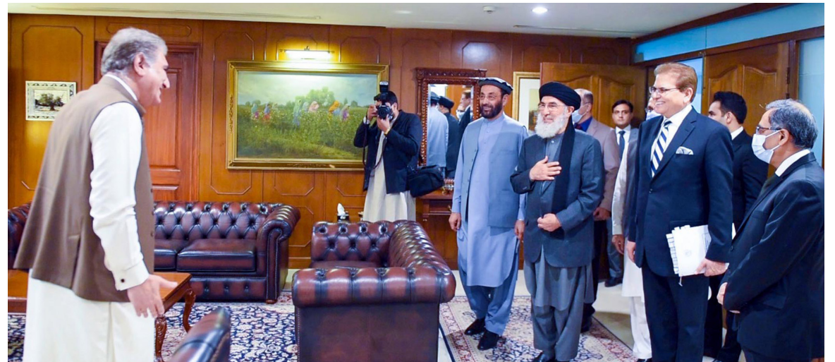
ISLAMABAD: Foreign Minister Shah Mahmood Qureshi welcomes the leader of Hizb-e-Islami Afghanistan Gulbadeen Hekmatyar at his office. - DNA

Foreign Minister added that Pakistan facilitated the process that culminated in the U.S.-Taliban Peace Agreement in Doha on 29 February 2020 and supported the commencement of Intra-Afghan Negotiations. The Foreign Minister stressed the importance of an inclusive, broad-based and comprehensive political settlement through an Afghan-led and Afghan-owned process. The Foreign Minister underscored that all parties must honour their respective commitments and work for reduction in violence leading to ceasefire. The Afghan leaders must seize this historic opportunity to achieve durable and sustainable peace in Afghanistan. The Foreign Minister also underlined the importance of exercising vigilance and guarding against the role of 'spoilers', both within and outside. The Foreign Minister highlighted the steps taken by Pakistan to support Afghanistan on its path to reconstruction and economic development as well as for improved transit and bilateral trade relations. The Foreign Minister underlined the importance of making the return of Afghan refugees to their homeland with dignity and honour a part of the peace process.