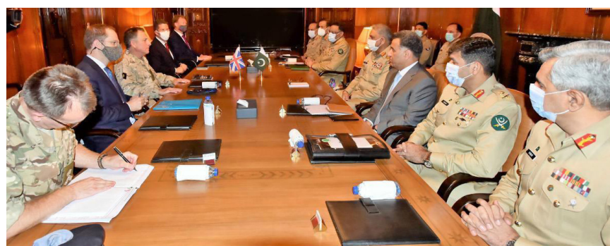
RAWALPINDI: A delegation headed by General Sir Nicholas Patrick Carter, Chief of Defence Staff (CDS) UK held a meeting with Chief of Army Staff, General Qamar Javed Bajwa at GHQ.

During the meeting with COAS, matters of mutual interest including strengthening of bilateral security and defence cooperation were discussed