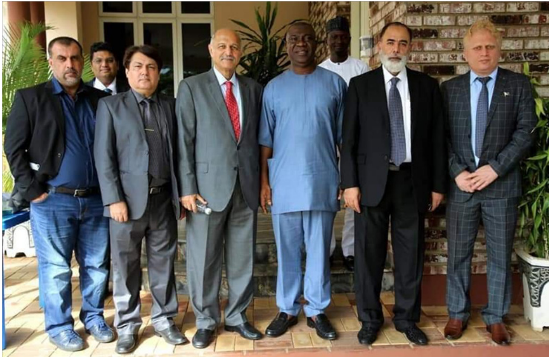
ABUJA: Senators from Pakistan visiting Nigeria to take part in a conference. - DNA

DUBAI: The IMF on Monday urged Middle East and North African countries to accelerate reforms and diversification efforts as the energy-rich region faces unprecedented challenges due to the coronavirus and low oil prices. In its latest regional economic outlook report, the International Monetary Fund projected the economies of the MENA region to shrink by five percent this year compared with a July estimate that they would contract by 5.7 percent. The region was expected to suffer its worst economic performance since 1978 when it was convulsed with unrest and shrank by 4.7 percent, according to World Bank data. "We should look at what is happening today as a call for action, and also as an opportunity to stimulate the transformation of the economy and create more opportunities, especially for the youth," Jihad Azour, the IMF's Middle East and Central Asia director, told AFP. "We expect that both growth and unemployment to be affected this year, and overall this crisis could bring growth down by five percent as well as also unemployment could go up by five percent." Years of devastating conflicts in several Arab countries - including Syria, Yemen, Iraq and Libya - have already battered their economies and created widespread poverty. - APP