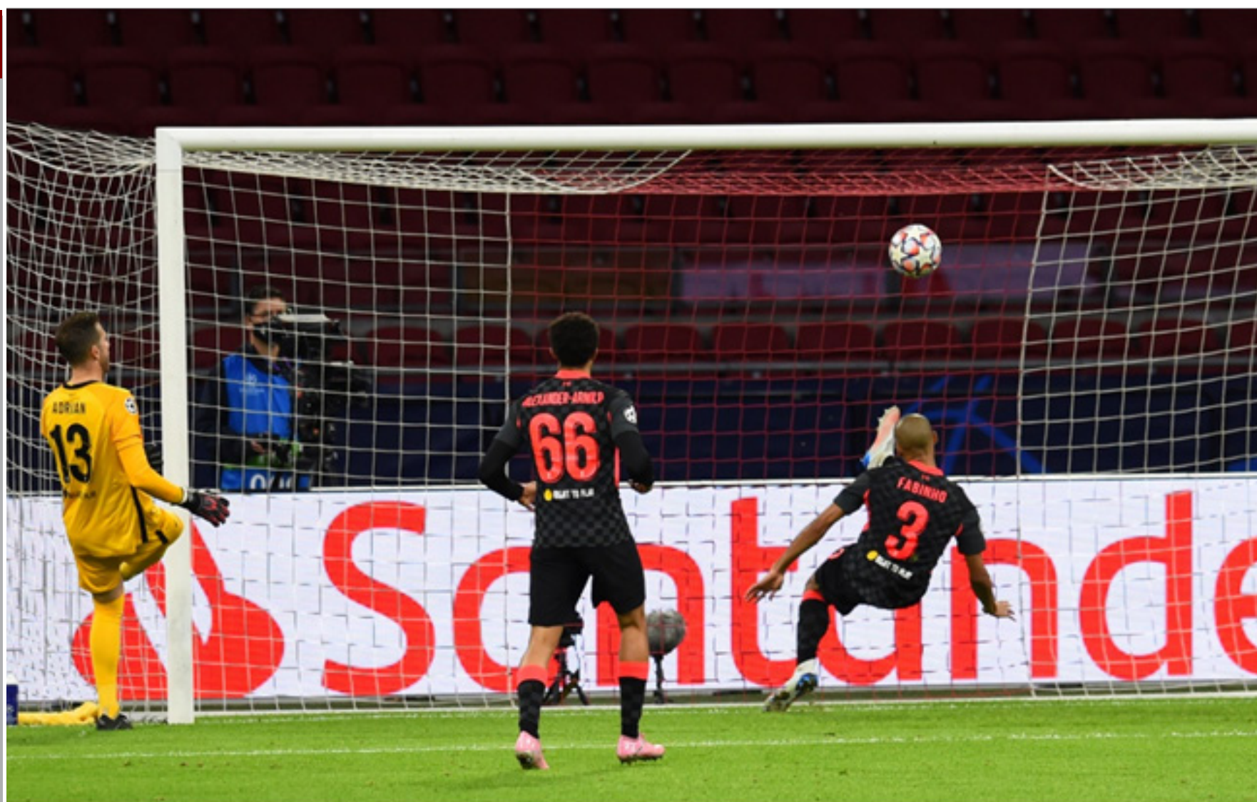
Amsterdam: Liverpool FC defender Fabinho clearing the ball during a UCL game against AFC Ajax.