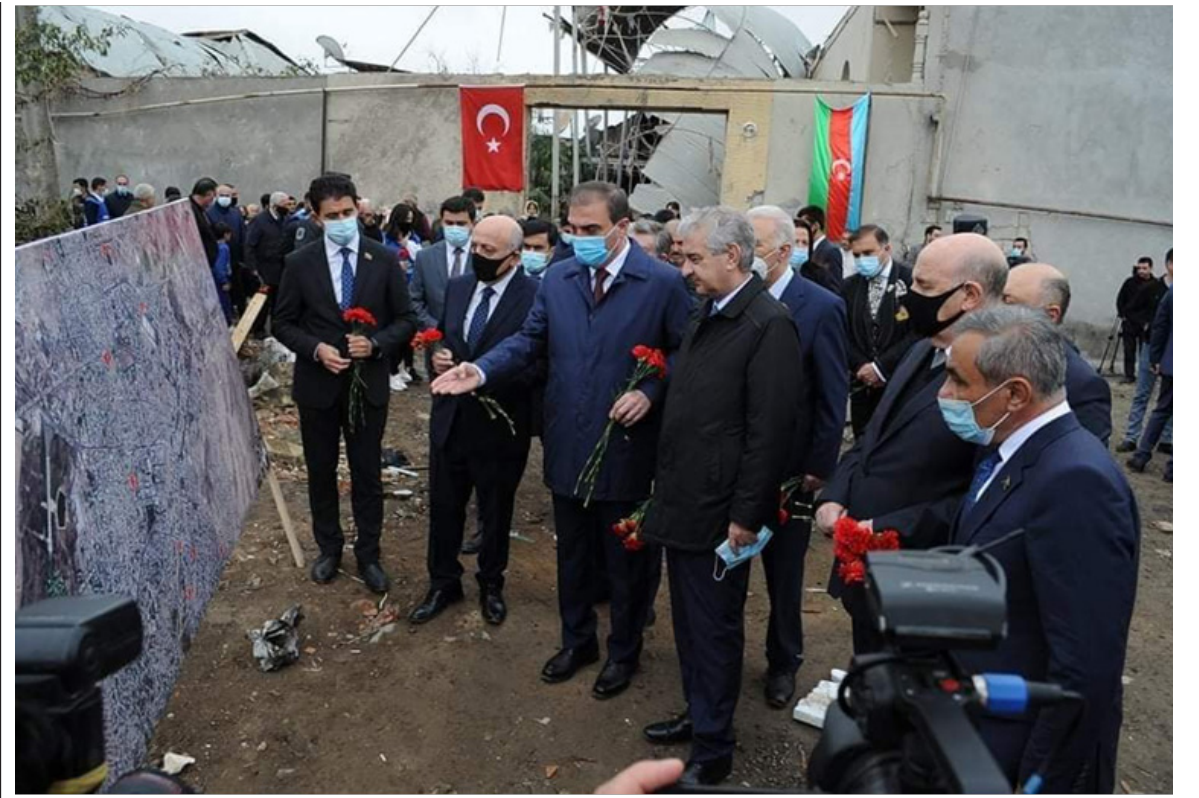
GANJA: Officials of Azerbaijan visiting Ganga areas destroyed by Armenian forces shelling.

research vessel in the eastern Mediterranean until October 27. The Oruc Reis escorted by military navy ships has become the symbol of Ankara's appetite for natural gas in the eastern Mediterranean, where recent discoveries have triggered a rush for the resource. Athens says Ankara is breaking international law by prospecting in Greek waters, including near the Greek island of Kastellorizo. Turkey insists that it is within its rights in the energy-rich Mediterranean region, saying that the tiny island of Kastellorizo should not count for imposing Greek sovereignty. — APP