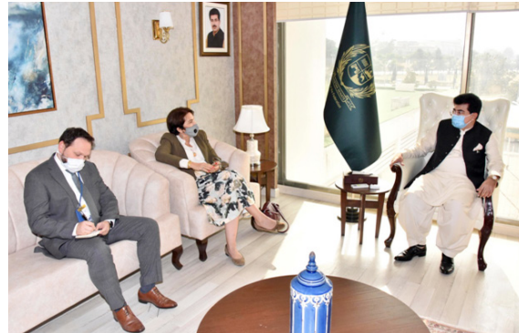
The EU Ambassador briefed the Chairman Senate about the development cooperation which is acting as a driving force behind the