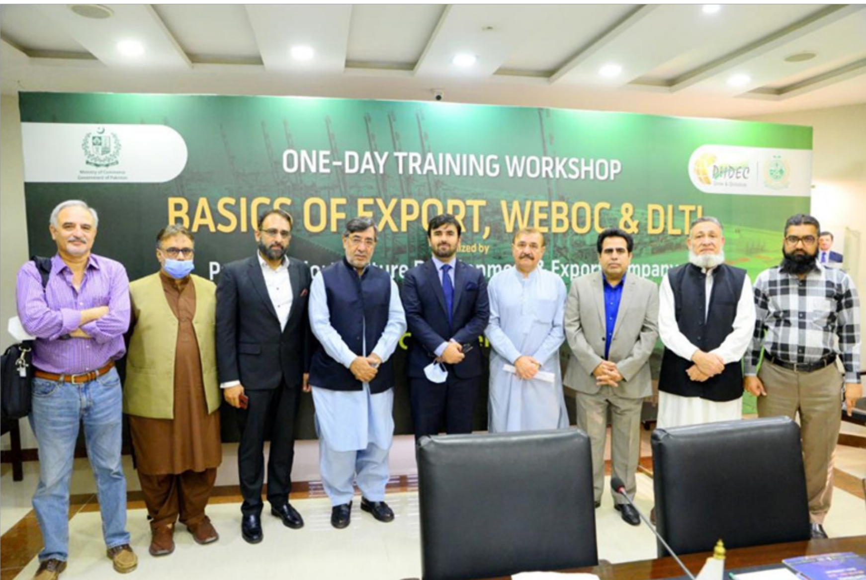
RAWALPINDI: Pakistan Horticulture Development & Export Company in collaboration with the Rawalpindi Chamber of Commerce & Industry @Rcci organized a day workshop on "Basis of Export, WEBOC & DTL".

ISLAMABAD: The Central Directorate of National Savings (CDNS) has achieved a collection net target of Rs 16 billion by October, 10 of fiscal year 2020-21. The CDNS has set Rs 249 billion annual collection target for the year 2020-21 as compared to Rs 352 billion for the previous year's 2019-20 to enhance savings and promote saving culture in the country, senior official of CDNS told APP here on Thursday. The CDNS has set Rs 352 billion annual collection target for the year 2019-20 as compared to Rs 350 billion for the previous year's 2018-19, he said. The directorate has also revised and increased the gross target of Rs1570 billion for the fiscal year 2019-20, he said. Replying to a question on current revision of CDNS certificate profit rates applicable from October 14, 2020, he said CDNS has remained the same the interest rate on the savings certificates investment due to the market situation and of Pakistan Investment Bonds (PIB) policy decision. He informed that the CDNS interest rates are linked with the policy of PIB, set by State Bank of Pakistan (SBP). He said the rate of profit on Defense Saving, regular income saving, special saving and short-term certificates had remained the same. A Senior official said that the profit rate on special saving certificates has remained the same at 7.77 percent. He informed that on Defense Saving Certificates, the rate is also the same at 8.49 percent. — APP