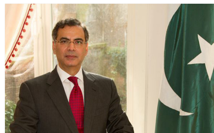
and has vast experience in the field of diplomacy which he wanted to utilize for the benefit of Pakistan and welfare of Pakistani community living in the