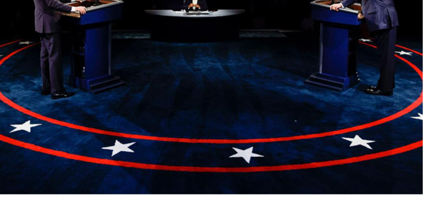
WASHINGTON: President Trump and Joe Biden holding one on one debate.

and using its innovative ICT technologies to create greater value for customers despite the complex situation it is currently facing. The company will continue contributing to pandemic responses, economic growth, and social progress.