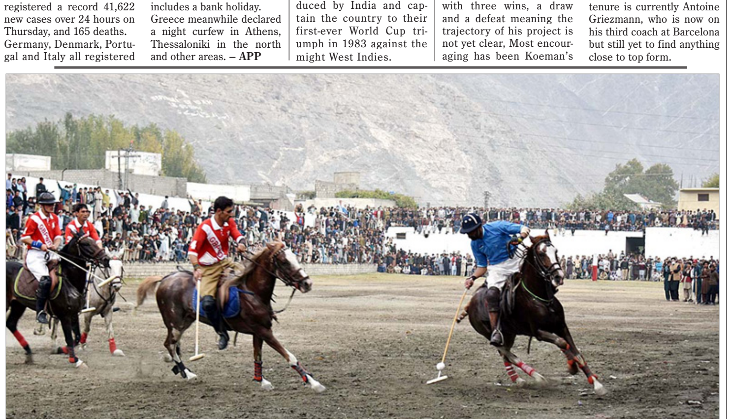
GILGIT: Players struggling to get hold on the ball in a match played between NLI and GBPWD polo teams during Jashan-e-Azadi Polo Tournament played at Shahi Polo Ground.

bling the number of people affected to 46 million. "The health situation of our country continues to deteriorate," Prime Minister Jean Castex warned as France registered a record 41,622