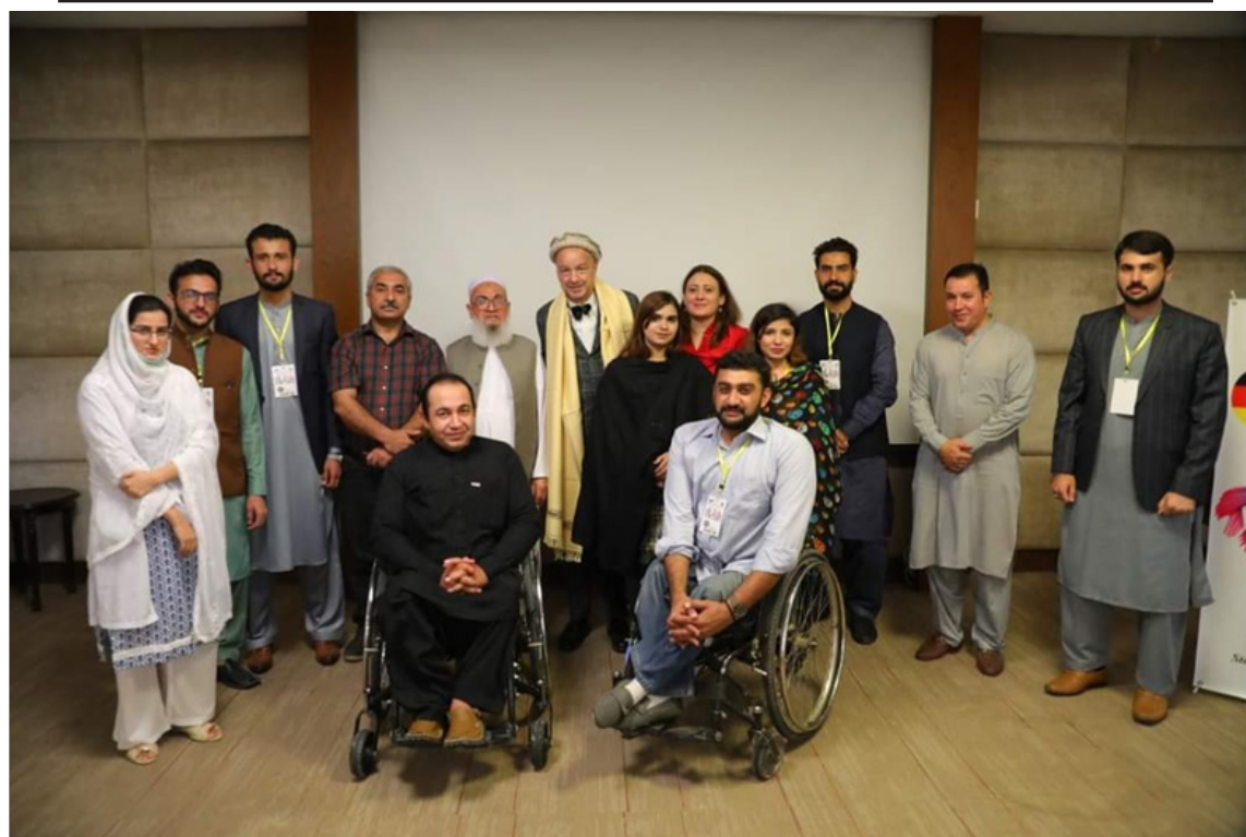
PESHAWAR: Ambassador of Germany posing for a picture with members of the civil society during his recent visit to Peshawar.

of serious concern due to the increasing rates and/or test positivity standing at above 3 per cent. "In countries where the epidemiological situation is of serious concern, there is a high risk to the general population, and for vulnerable individuals the COVID-19 epidemiological situation represents a very high risk. According to its latest figures, more than 5.5 million infections have been confirmed across the 31 countries since the beginning of the pandemic. The death toll now stands at nearly 206,000. The Czech Republic and Belgium have been particularly impacted by the second wave which started sweeping the continent in September. Both countries have 14-day COVID-19 incidence rates of more than 1,000 cases per 100,000 population.