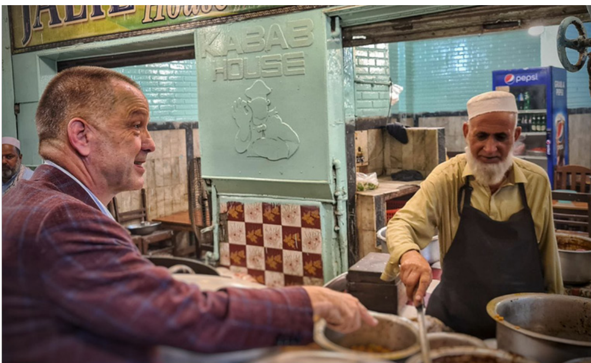
PESHAWAR: German Ambassador tastes Chapal Kabab during his recent visit to Peshawar.

deep rooted friendship with brotherly country Turkey for this mega project will open new vistas of further cooperation in the field of indigenous warship construction and other defence sectors in Pakistan. Construction of corvettes in Pakistan is aimed to provide impetus to local ship building industry and to further enhance KS&EW capabilities. These Ships are being constructed as per modern Naval Ship class standards with stealth features. The 2nd MILGEM Class Corvette will be delivered in early half of 2024. The ceremony was attended by representatives of M/s ASFAT Turkey, Istanbul Naval Shipyard and officials from Government of Pakistan, Pakistan Navy and KS&EW.