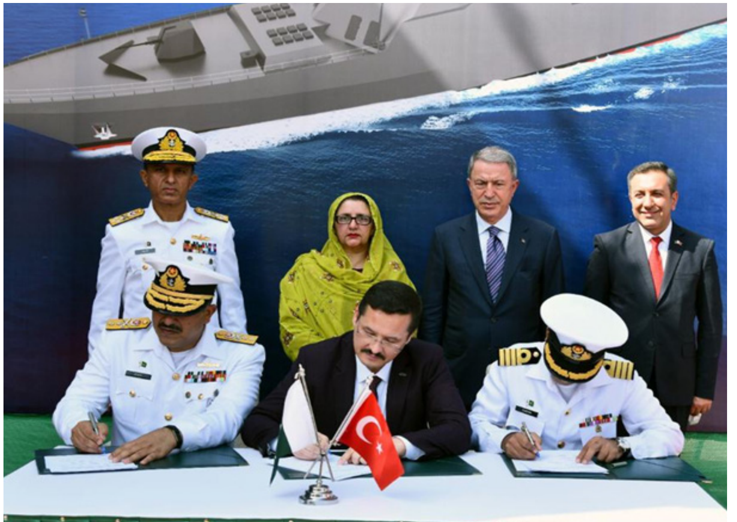
Karachi: Milestone certificate being signed between officials of Karachi Shipyard & Engineering works and M/s ASFAT.

jects. CM Usman Buzdar assured him for resolving public issues in his constituency and consideration of recommendations tabled by him. The chief minister criticised that those creating chaos are the enemies of development of the country besides hiding their corruption. He said that Pakistan Tehreek-e-Insaf (PTI) is the most popular political party of the country under the leadership of Prime Minister Imran Khan. The opposition parties wanted to stop the journey towards development and prosperity.