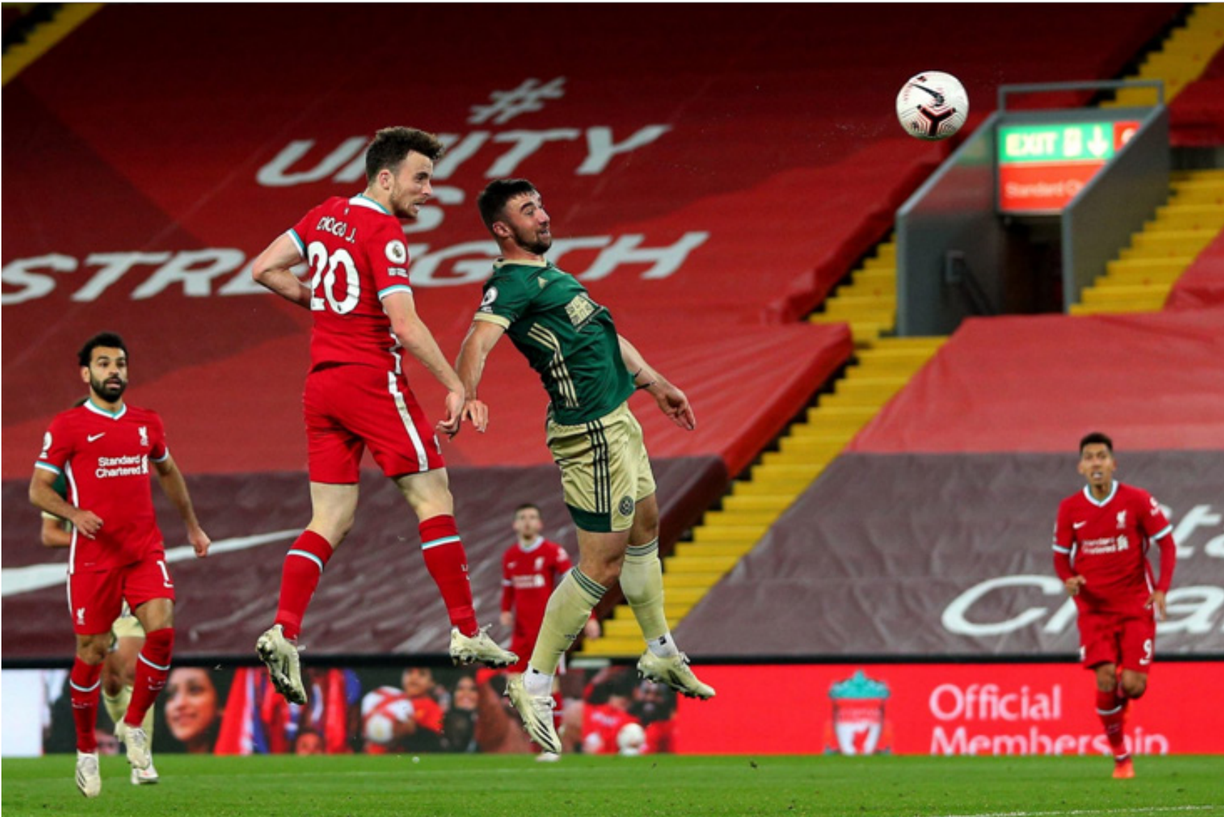
LIVERPOOL: Players trying to head the ball during a premier league game between Liverpool and Sheffield United.

be it Muslims, White Supremacists or Nazi ideologists. Sadly, President Macron has chosen to deliberately provoke Muslims, incl his own citizens, through encouraging the display of blasphemous cartoons targeting Islam and our Prophet (PBUH), the premier wrote on Twitter. Condemning that by attacking Islam, Macron has hurt the sentiments of Muslims around the world, PM Imran said that the last thing the world wants or needs is further "polarisation". "Public statements based on ignorance will create more hate, Islamophobia and space for extremists," he added. France has recently stepped up measures in the country which its Muslim community views as anti-Islam. The French government has said it fears militancy is taking over some Muslim communities in the country. The French government is considering proposals to restrict funds that Muslim communities in the country receive from abroad. The government also wants to create a certificate program for French-trained imams, as well as other things. The French Interior Ministry announced that its officials will target for possible dissolution 50 French Muslim associations if they are found guilty of promoting hatred. The list of names include that of a mainstream group that aims to battle Islamophobia.