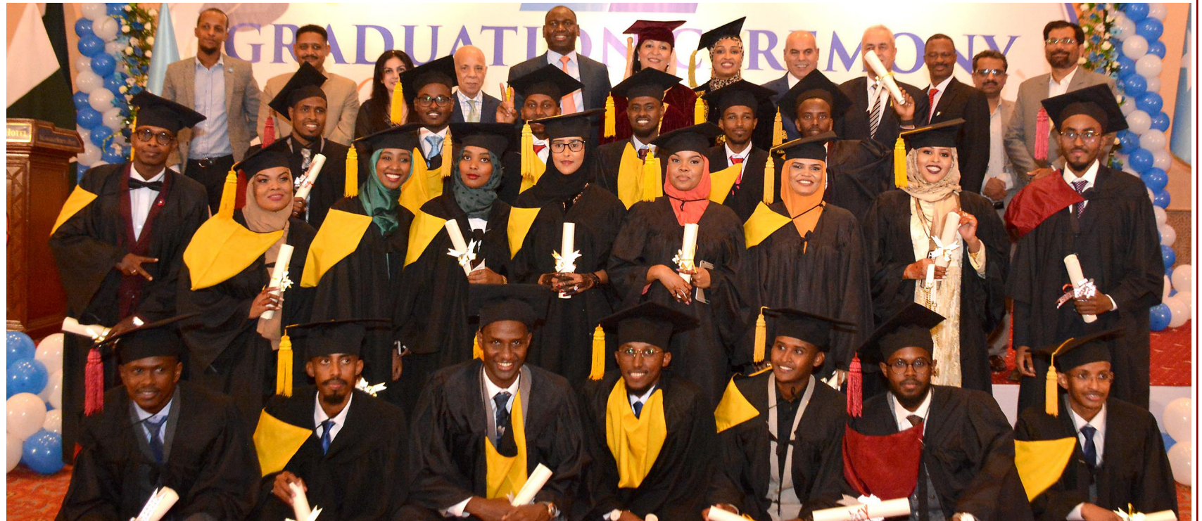
ISLAMABAD: Somali students expressing jubilation on the occasion of graduation ceremony of Somali students studying in Pakistan.