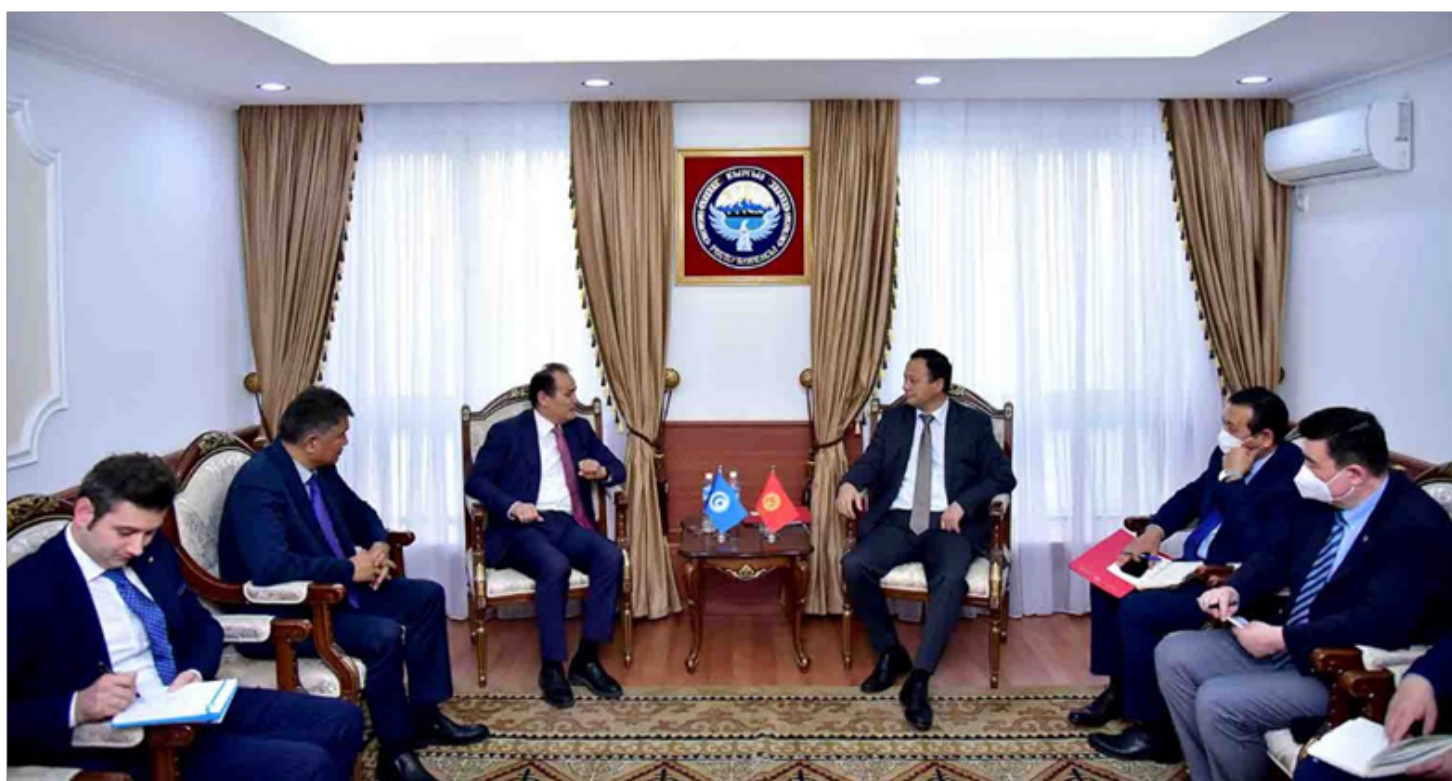
BISHKEK: The Minister of Foreign Affairs of the Kyrgyz Republic H.E. Mr. Ruslan A. Kazakbayev in a meeting with the Secretary General of the Turkic Council (Cooperation Council of Turkic Speaking States / CCTS) H.E. Mr. Baghdad Amreyev, who is in Bishkek on a working visit. -- DNA

have a "major impact" on U.S.-China relations. Taiwan's presidential office thanked the US for the sale. In July, China - which considers Taiwan part of its territory - had announced sanctions on Lockheed Martin for a previous arms sale to the island. U.S. arms manufacturers face strict limitations on what kind of business they can do with countries deemed by Washington to be strategic rivals, such as China. Lockheed generated 9.7% of its revenue in the Asia-Pacific region last year, according to data compiled by Bloomberg, though that's not broken down by individual countries.