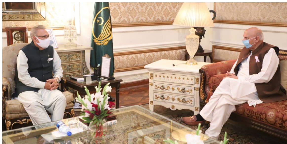
LAHORE: Governor Punjab, Chaudhry Muhammad Sarwar in a meeting with President Dr. Arif Alvi at Governor House.