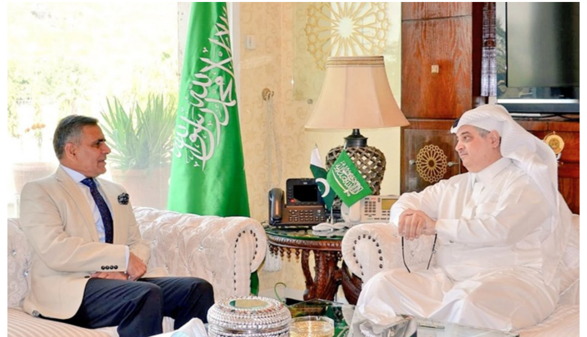
ISLAMABAD: CEO PIA Air Marshal Arshad Malik called on Saudi Arabian Ambassador H.E. Nawaf Bin Saeed AlMalki.

This includes the distribution of emergency food assistance, cash transfers, shelter repair toolkits, clean water supplies and other essential relief items. It will also ensure access to sanitation facilities and good hygiene practices for those hit by the floods.