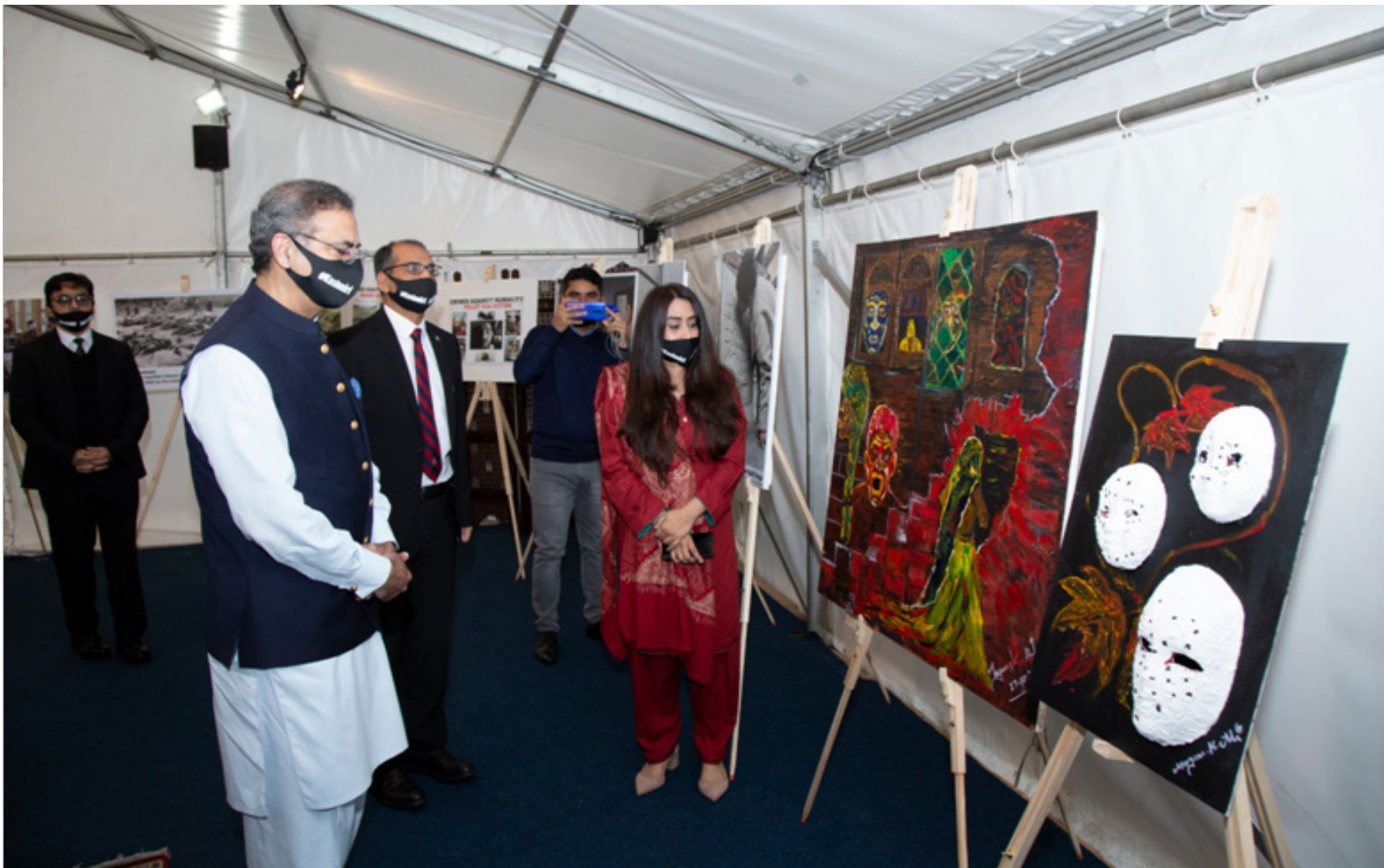
LONDON: High Commissioner Moazzam Ahmad Khan observing Kashmir Black Day photo exhibition at the Pakistan High Commission London.

Kashmir, terming October 27 as a Black Day in the history of the Kashmiri people. The House resolutely rejected the illegal Indian occupation of Kashmir which is the root cause of the dispute for the last 73 years. The resolution reaffirmed complete and unconditional support of Pakistan and its people to the just cause of the inalienable right of self-determination of the people of Indian Illegally Occupied Jammu and Kashmir in accordance with the UN Security Council resolutions that seek a plebiscite under UN auspices to ascertain the wishes of the Kashmiri people regarding their future.