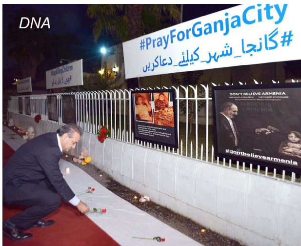
Chief Editor Islamabad POST, CENTRELINE and DNA News Agency laying flowers.

Visitors got acquainted with the corner with posters, pictures and slogans depicting the Armenian terror, lit candles in front of it, as well as laid flowers and toys and paid tribute to the memory of those killed. A large monitor was installed on the side of the road where the embassy building is located showing documentaries and information on the results and consequences of numerous missiles attacks on the civilian population of Ganja and other cities. Visitors to the corner condemned Armenia's atrocities against civilians in gross violation of the norms and principles of international law, including international humanitarian law, the obligations of the Geneva Conventions, as well as the declared humanitarian ceasefire, and expressed solidarity with Azerbaijan and support for our country's right to self-defense.