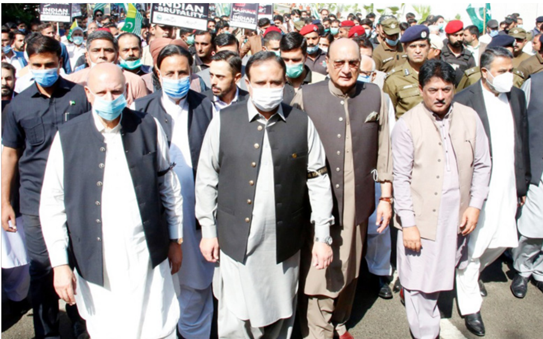
LAHORE: Punjab Chief Minister Sardar Usman Bazardar and Governor Muhammad Sarwar are leading a walk to express solidarity with the Kashmiri people on Black Day.

PESHAWAR: Those responsible for the blast in Peshawar madrassah will be taken to task, vowed KP IG Sanaullah Abbasi while speaking to the media on Tuesday. The police held a meeting on Monday to discuss the threats to the city. "We are saddened by the attack. The suspects are arrested after every incident." Speaking about the upcoming PDM rally in Peshawar, he remarked that they have provided as much security as possible. Every person is given security based on their threat-perception. The IG shared that he cannot share details of the investigation with the media. "There are some things that we tell people and many things that we don't. I cannot jump to any conclusions right now but we have neutralized as many as 36 threats recently." The forensic investigation will be shared later, but I cannot divulge details now. The people who live here know the dynamics of this place. They are unique, he said.