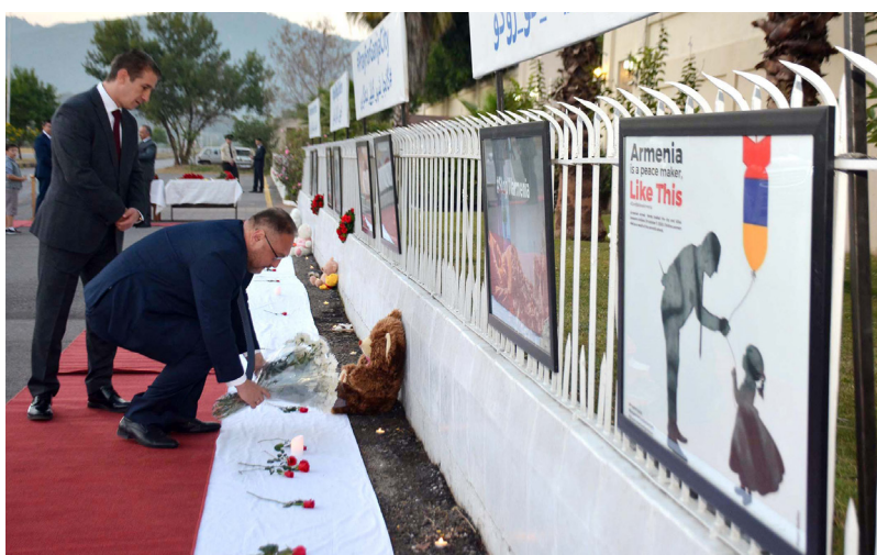
Ambassador of Kazakhstan laying flowers.