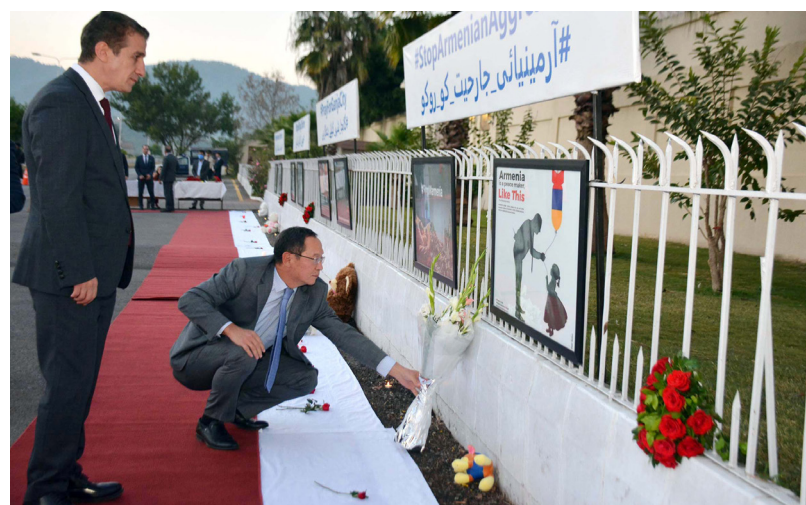
Ambassador of Kyrgyzstan laying flowers. – DNA