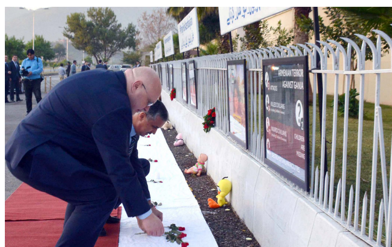
Ambassadors of Tajikistan and Belarus laying flowers.

"These developments clearly negate the argument that India's mainstreaming in the international export control regimes will further the non-proliferation objectives of these regimes," the spokesperson stressed