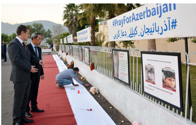
High Commissioner of Brunei visiting the corner – DNA