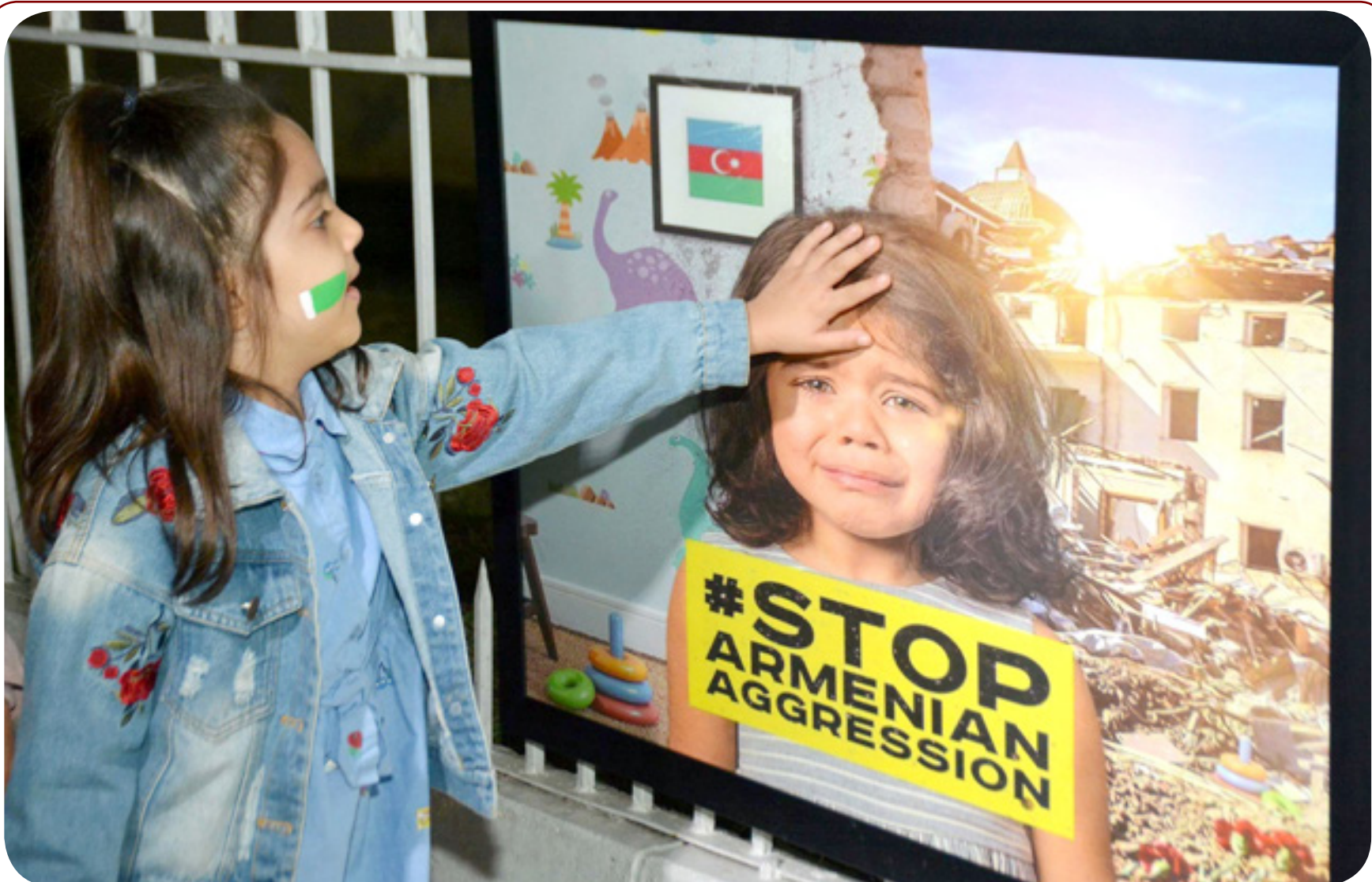
ISLAMABAD: A little girl expresses sympathy with the victim of Armenian brutalities during a memorial corner established outside the Azerbaijan embassy. A large number of people turned up to show solidarity with Azerbaijan.