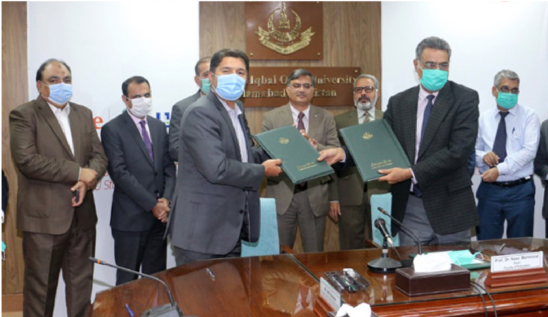
ISLAMABAD: The officials from Allama Iqbal Open University and Ufone during the MoU signing ceremony.