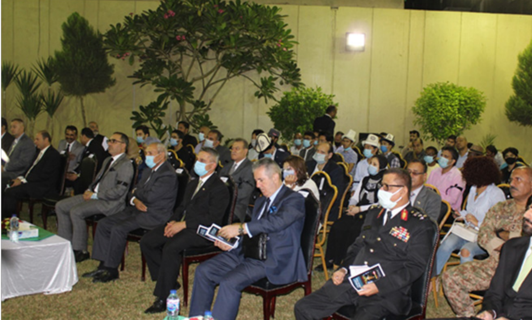
CAIRO: The Embassy of Pakistan in Cairo organized a Seminar titled "Human Rights Violation in Kashmir – Role of International Community" to observe "Kashmir Black Day" in solidarity with Kashmiris under military siege in Indian Occupied Jammu and Kashmir.