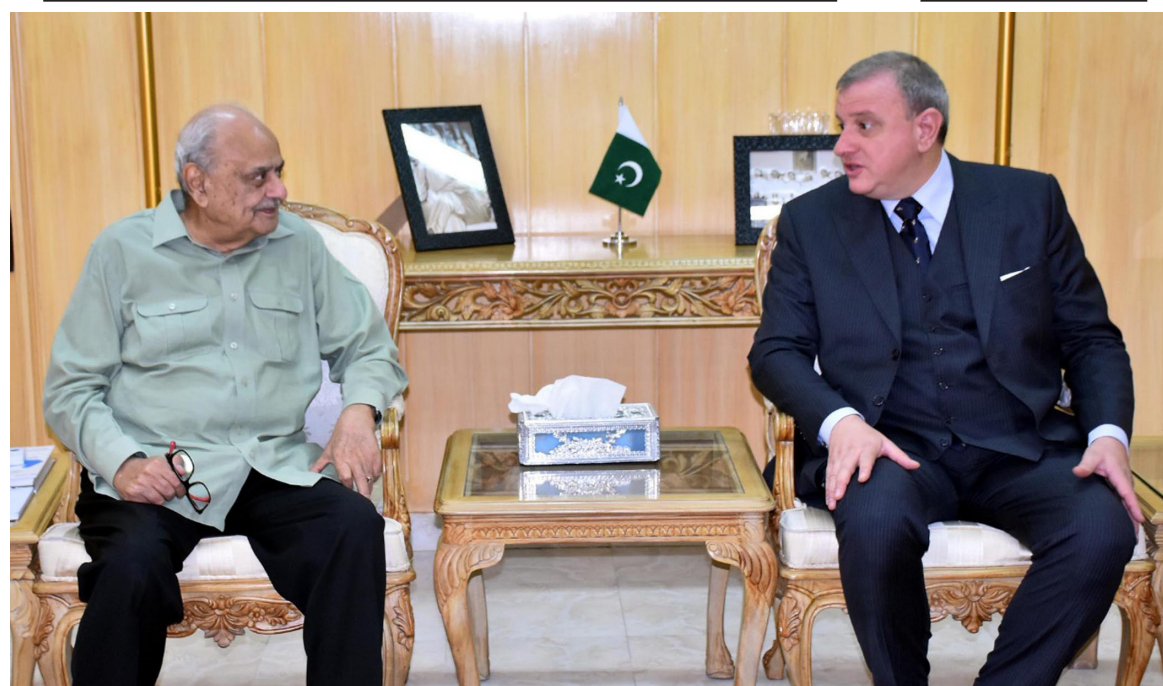
ISLAMABAD: Federal Minister for Interior, Brig R. Ijaz Ahmad Shah met with Ambassador of Italy Andreas Ferrarese.