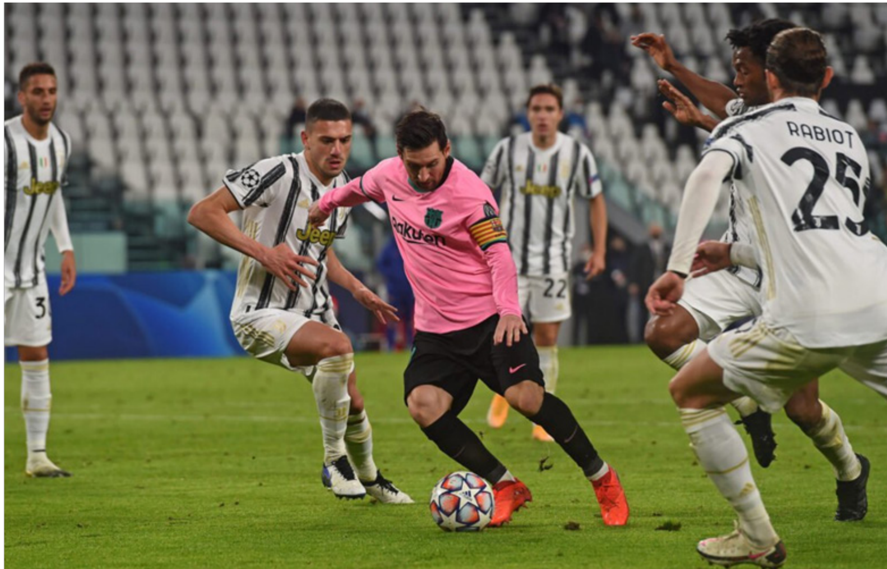
TURIN: FC Barcelona's captain Lionel Messi trying to dribble past Juventus' players in a UCL game.