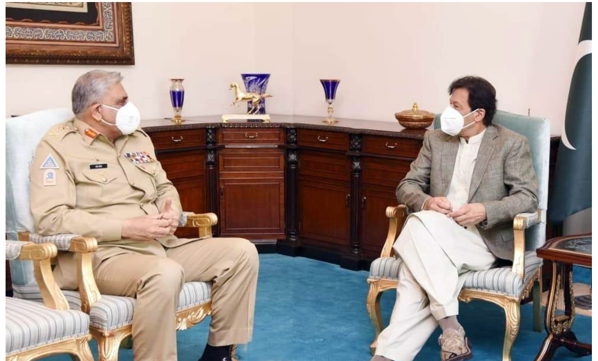
ISLAMABAD: Army Chief General Qamar Javed Bajwa called on PM Imran Khan.

ISLAMABAD: The Foreign Office on Thursday categorically rejected the impression that the release of captured Indian air force pilot by Pakistan last February, was made under any pressure. "There was no pressure on the Pakistani government to release Indian pilot Wing Commander Abhinandan," Foreign Office Spokesperson Zahid Hafeez Chaudhri said at the weekly press briefing, held here at the Ministry of Foreign Affairs.