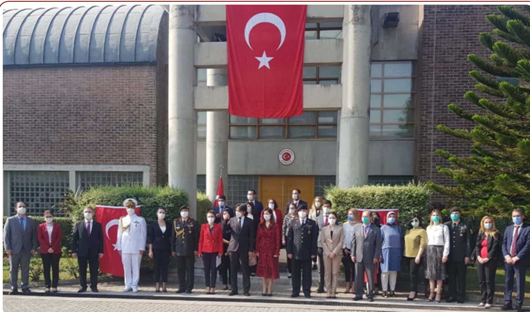
ISLAMABAD: 97th anniversary of the republic of Turkey was celebrated at the embassy. No usual reception is hosted by the embassy due to COVID. National anthem of Turkey was played. Ihsan Mustafa Yurdakul, Ambassador of Turkey addressed the members of the embassy and congratulated them on this happy occasion. - DNA

KARACHI: The Pakistan International Airlines (PIA) incurred a loss of Rs250 billion after suspension of its flight operation to and from the European Union (EU) states and the United Kingdom (UK). According to PIA's spokesperson, the national airlines is bearing a monthly loss of Rs9billion due to the suspension of its flights to Europe and the UK. It was feared that Pakistan International Airlines may face more losses of Rs-54billion if the restrictions remain intact, he said. In July, the European Union Air Safety Agency (EASA) had suspended the authorization for the PIA to operate in the bloc for six months. "EASA has temporarily suspended PIA's authorization to operate to the EU member states for a period of 6 months effective July 1, 2020, with the right to appeal against this decision," a Pakistan International Airlines statement had said.