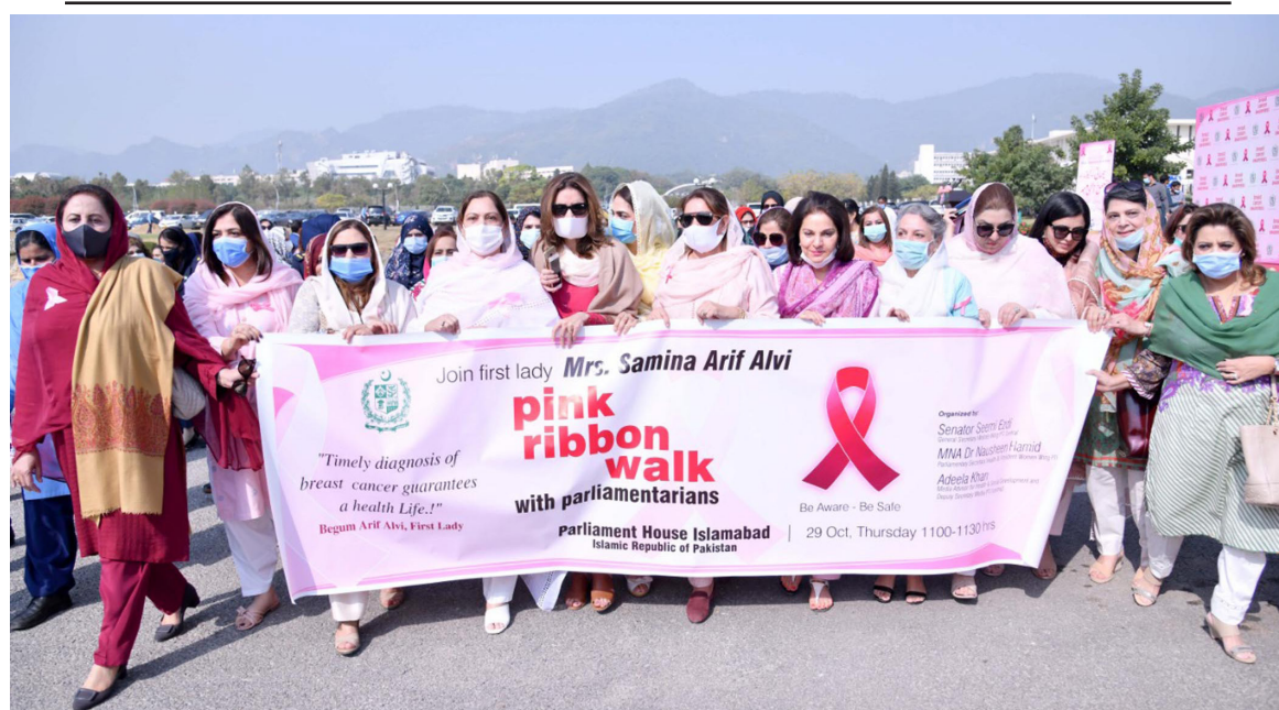
ISLAMABAD: Begum Samina Arif Alvi, Along with Parliamentarians, taking part in a walk to raise awareness of Breast Cancer and its treatment.

pressed his satisfaction that the issue of provision of standardized number plates had been settled amicably. It would be a long-term solution to the provision of number plates along with helping in their identification by security cameras, he added. Universal registration series had been started in the whole of the province and the online auction of attractive numbers had been started as well along with the start of e-payment of all the basic taxes of excise department, he added.