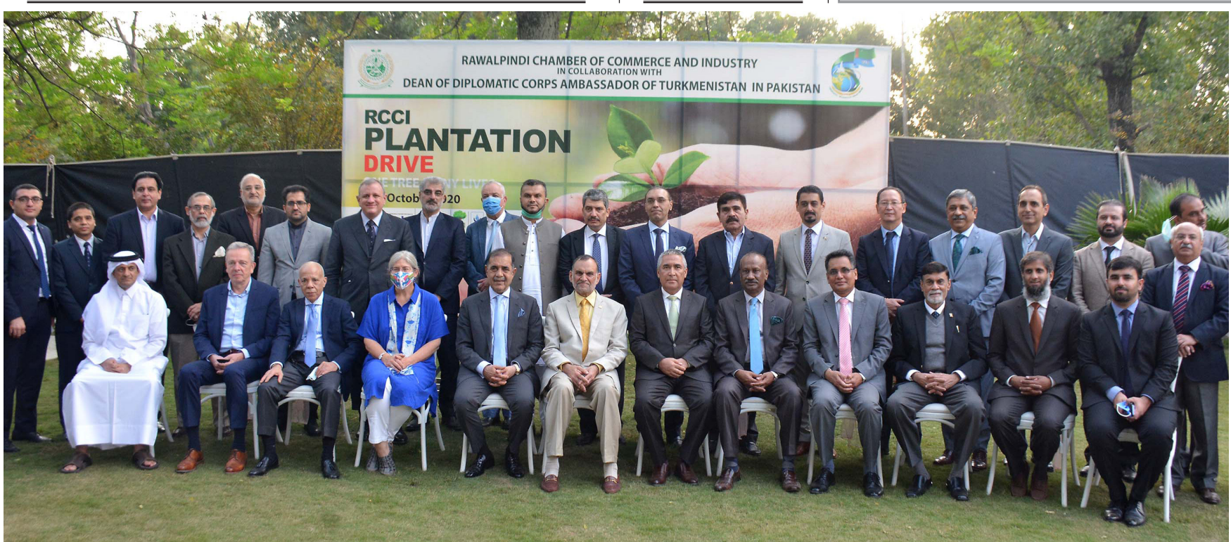
ISLAMABAD: Members of Rawalpindi Chamber of Commerce and Industry and members of diplomatic corps posing for a group photo on the occasion of tree plantation drive arranged by RCCI. (More pictures on Back page)

ISLAMABAD: Indus River System Authority (IRSA) on Thursday released 74,600 cusecs water from various rim stations with inflow of 52,100 cusecs. According to the data released by IRSA, water level in the Indus River at Tarbela Dam was 1526.23 feet, which was 140.23 feet higher than its dead level 1386 feet. Water inflow in the dam was recorded as 33,300 cusecs and outflow as 38,000 cusecs. The water level in the Jhelum River at Mangla Dam was 1210.60 feet, which was 170.60 feet higher than its dead level of 1040 feet whereas the inflow and outflow of water was recorded as 6,200 cusecs and 22,000 cusecs respectively. The release of water at Kalabagh, Taunsa and Sukkur was recorded as 42,700, 39,000 and 11,700 cusecs respectively. Similarly, from the Kabul River a total of 5,200 cusecs of water was released at Nowshera and 2,300 cusecs released from the Chenab River at Marala. — APP