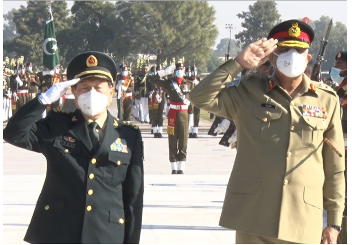
RAWALPINDI: General Wei Fenghe, Minister of National Defence, China and General Qamar Javed Bajwa, Chief of Army Staff paying their respects to Shuhada at GHQ.

Earlier on arrival at GHQ, Minister of National Defence, laid a floral wreath at Yagare-Shuhada. A smartly turned out contingent of Pakistan Army presented the Guard of Honour to visiting dignitary.