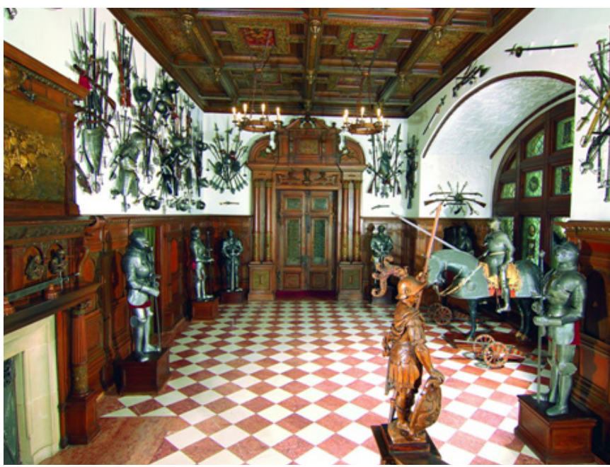
Great Armory Room

the stained glass windows make it a true symbol of elegance and royalty. Another outstanding part of the castle, the Royal Library, is