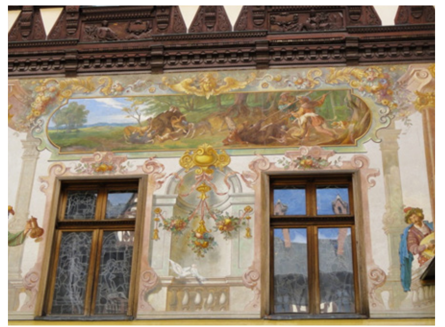
A courtyard in the castle

1902. It was meant to be the residence of the Romanian royals, King Ferdinand and Queen Marie. It was designed by a Czech architect in the Art Nouveau