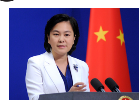
video address at the opening ceremony. It shows Pakistan's sincere wish to strengthen cooperation with China and ASEAN," Hua Chunying said during her regular briefing. The spokesperson said that for many years, Pakistan had

BEIJING: Pakistan's participation as special partner of cooperation in the 17th China-ASEAN Expo (CAEXPO) held in Nanning, Guangxi province of China showed its sincere wish to strengthen cooperation with China and ASEAN countries, a Chinese foreign ministry's spokesperson said on Monday. "As you said, this year for the first time, Pakistan was invited as a special partner of cooperation to attend the expo. President Dr Arif Alvi delivered a