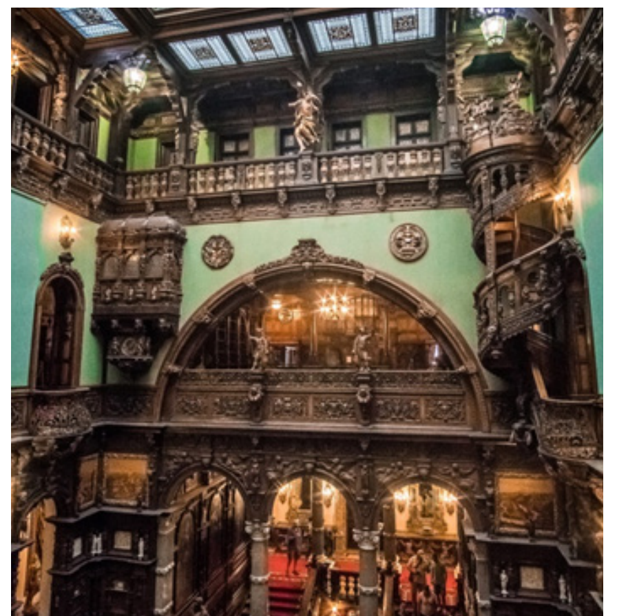
Sculpted wood inside Peles Castle