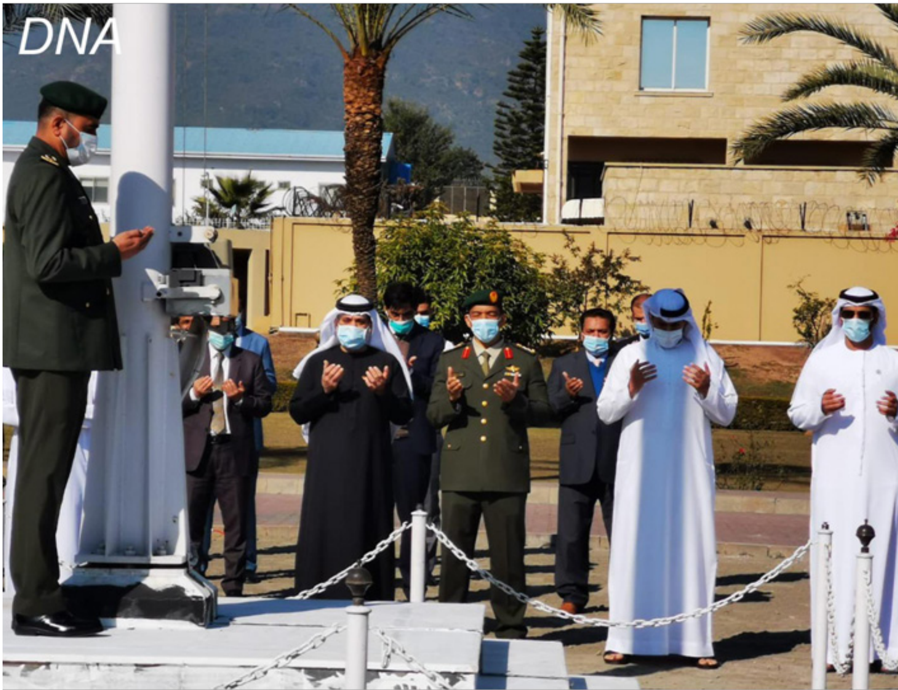
ISLAMABAD: Officials of UAE embassy paying respects to Martyrs during a ceremony at the Embassy. - DNA

An important goal of the US-Israeli militants and their regional partners is to impose an extraordinary condition in the Middle East in order to achieve their sinister goals. The Islamic Republic of Iran reserves the right to respond to this crime and to punish the perpetrators while being aware of the conspiracies of the enemies of peace, stability and security in the region and the world. If a government or an individual thinks that he can use the means of terror to prevent Iran's progress and advancement in the path of science, knowledge and technology, his ideas are completely wrong. Efforts to progress and succeed in all scientific fields will continue with vigor and speed. The Embassy of the Islamic Republic of Iran, while condemning this criminal assassination, calls on all governments and free and truth-seeking individuals to raise their voices in opposition to this barbaric act and do not let the enemies of Islam and Muslims block the way for the development and prosperity of the countries in the region with these assassinations. Everyone should be aware of the dangerous consequences of such moves in this area. The failure of the enemies in their sinister plan to create insecurity and instability in this region is possible only through the coordinated and sympathetic action of the countries of the region against the enemies.