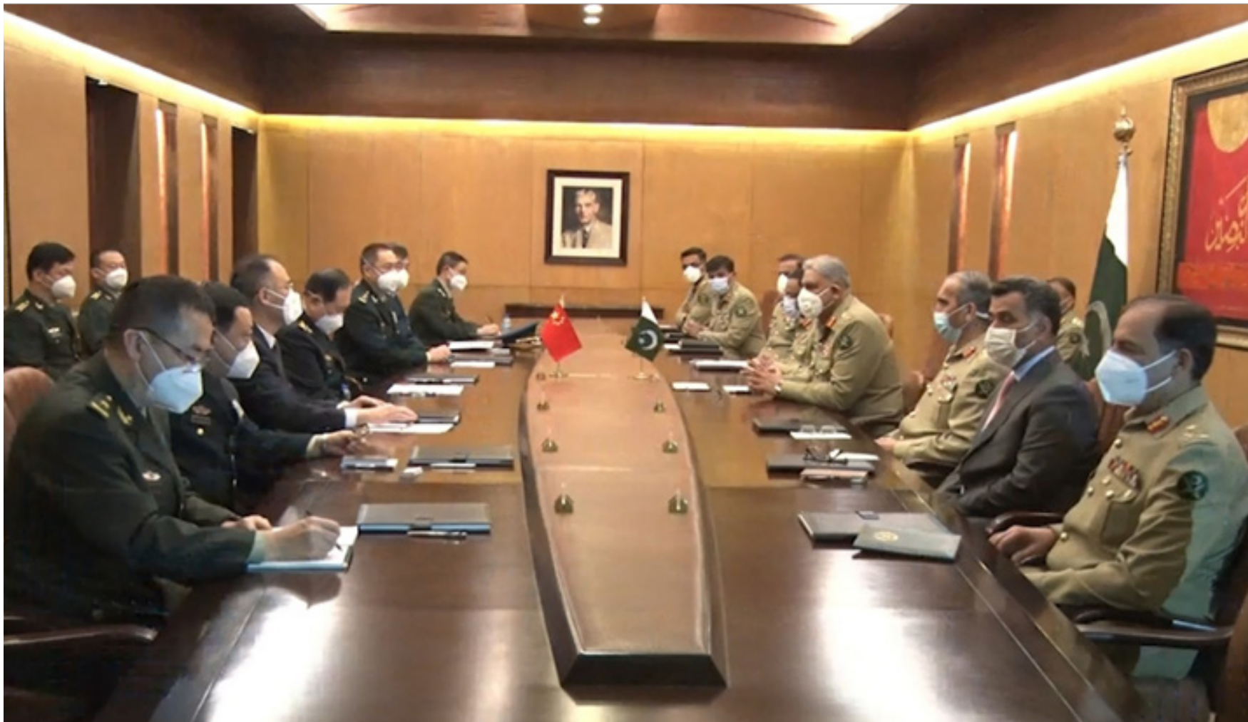
RAWALPINDI: General Wei Fenghe, Minister of National Defence, China along with his delegation called upon General Qamar Javed Bajwa, Chief of Army Staff at GHQ.