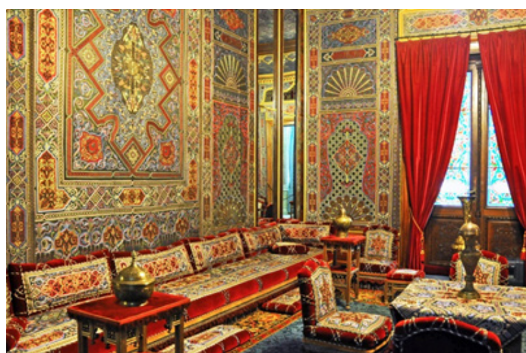
The Moorish room decorated in red and golden