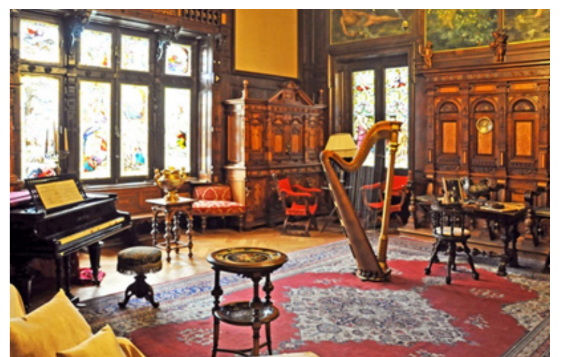
The music Room