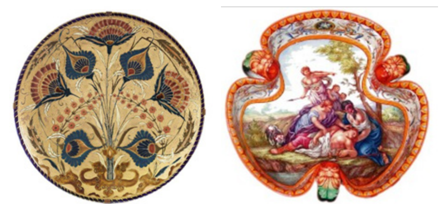
Ceramics at the Peles Museum

style, and it has several chambers, a chapel, and a golden room. Many of the artistic decisions regarding the design were made by Queen Marie, and she even helped decorate and paint it.