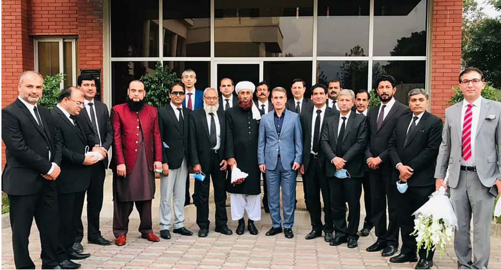
ISLAMABAD: The lawyers and advocates of the several Bar Associations of Pakistan have visited Azerbaijan Embassy Islamabad and condemned the missile and artillery attacks of Armenia against civilians of Azerbaijan, extended their sympathies over the losses of precious innocent lives and expressed their firm solidarity with Flag of Azerbaijan.