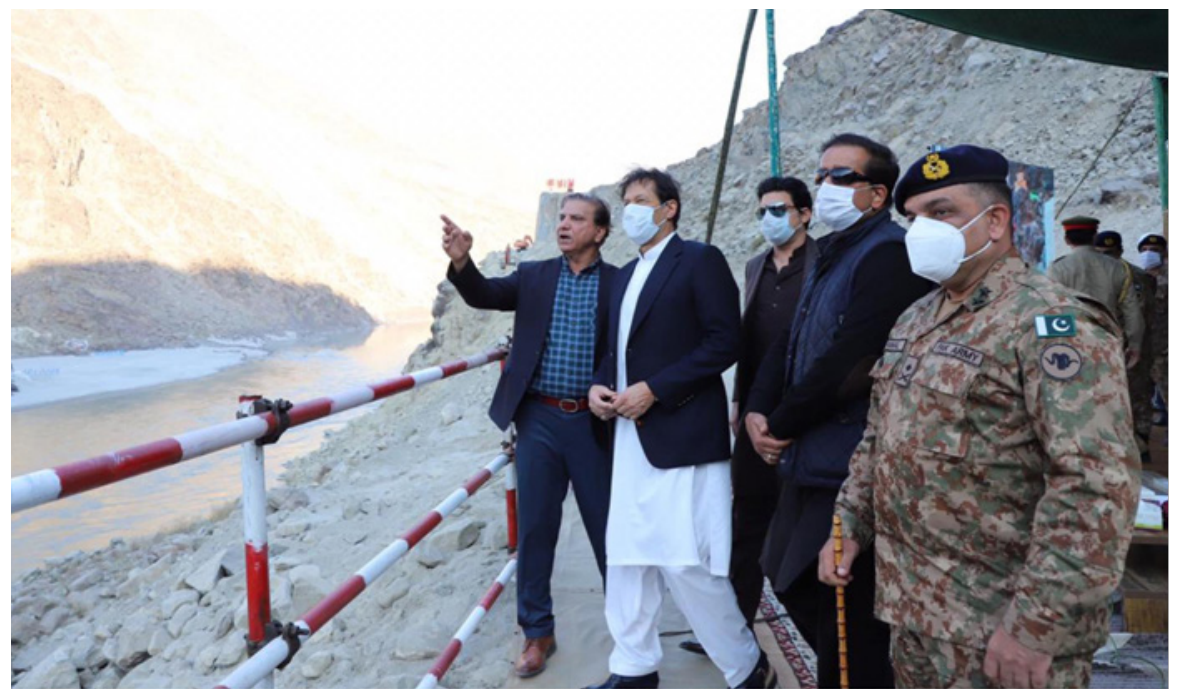
DIAMER: Chairman WAPDA briefs PM Imran Khan on progress of work at Diamer Bhasha Dam site. DNA

PESHAWAR: Pakistan Democratic Movement (PDM) should postpone its rally in Peshawar keeping in view the potential threats of terrorists' attacks. Khyber-Pakhtunkhwa (K-P) Minister for Labour and Culture Shaukat Yousafzai said this as he addressed media after meeting with K-P Chief Minister Mahmood Khan. Yousafzai asked the PDM to hold talks with the government on all issues except accountability. "Peshawar has witnessed a tragic terrorism incident in which innocent children of a madrasa were targeted. The PDM should reconsider their Peshawar rally in view of the potential threat of terrorism," he said adding that K-P government will not impose any ban on rallies and processions. The PDM should not play with the lives of the people to save the corruption of some leaders, he added. The provincial minister said that speeches are being made in PDM rallies against the army which is reprehensible and is providing an opportunity to the enemies for propaganda against the country. - DNA