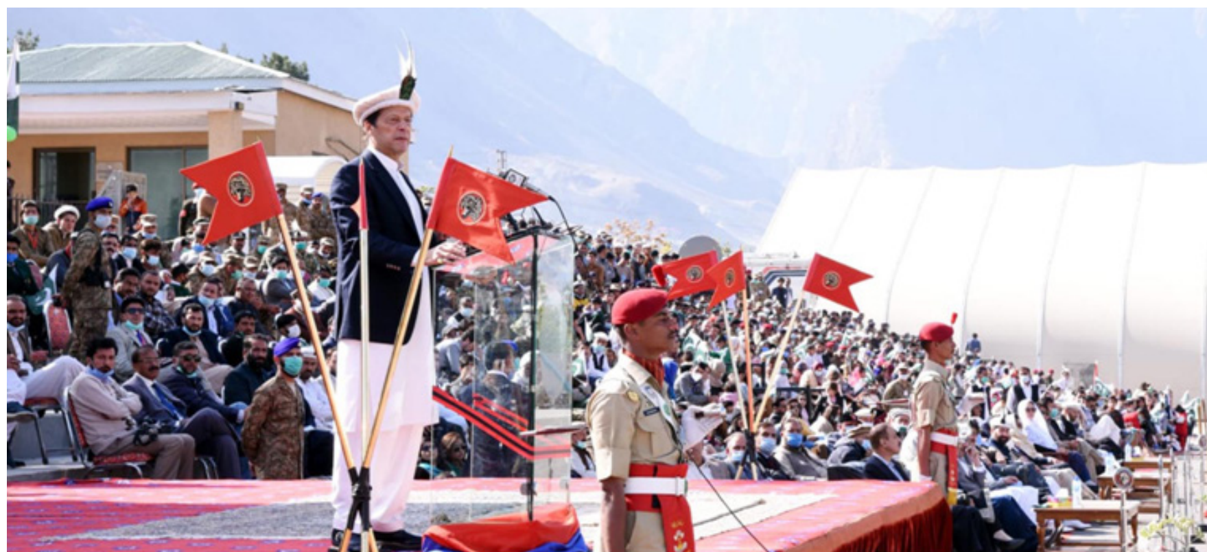
GILGIT: Prime Minister Imran Khan addressing a Freedom Day ceremony.

MONTREAL: At least two people died and five were injured after being stabbed by a man wearing medieval clothes, armed with a bladed weapon near the Parliament Hill area of Quebec City, Canada, late on Saturday, local media reported. The local police said they arrested a male suspect early on Sunday and told people residing near the area to stay indoors as the investigation was still ongoing. The police had earlier said that they were on the hunt for a man dressed in medieval clothing carrying a bladed weapon, leaving "multiple victims". Five victims have been transported to a local hospital, but their immediate condition was not known, according to police spokesperson Etienne Doyon. It quoted Doyon as saying that the suspect was in his mid-20s and was also taken to a hospital for evaluation. There were no immediate details available on the possible motive behind the attack.