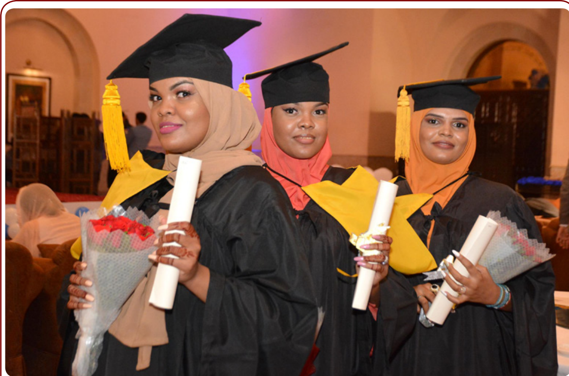
ISLAMABAD: Somali students studying in Pakistan posing for a picture after graduation ceremony.