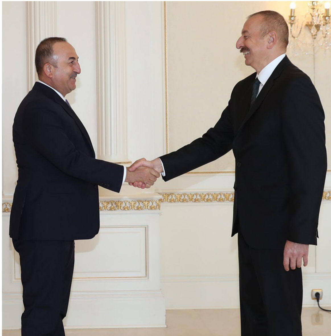
BAKU: Foreign minister of Turkey Mevlut Cavusoglu met with the President of Azerbaijan, Ilham Aliyev and congratulated him on the flying flag in Shusha.

Also Zimbabwe President Emmerson Mnangagwa offered his "huge congratulations" to Biden and wished success in leading the American people and growing cooperation between the two nations. Zimbabwe has been facing the US and EU sanctions for years over rights abuses and irregular elections during the leadership of late President Robert Mugabe. Zimbabweans now hope the new US administration might lift the sanctions, allowing it to benefit from trade deals and international assistance. In his congratulatory message, President Macky Sall of Senegal said his country looks forward to continuing its excellent relations of friendship and cooperation with the US. Gabon President Ali Bongo Ondimba also took to Twitter to congratulate US president-elect and vice president-elect over election win. "Our countries have always been staunch allies," Ondimba said, adding that he is looking forward to growing the bilateral relations much stronger.