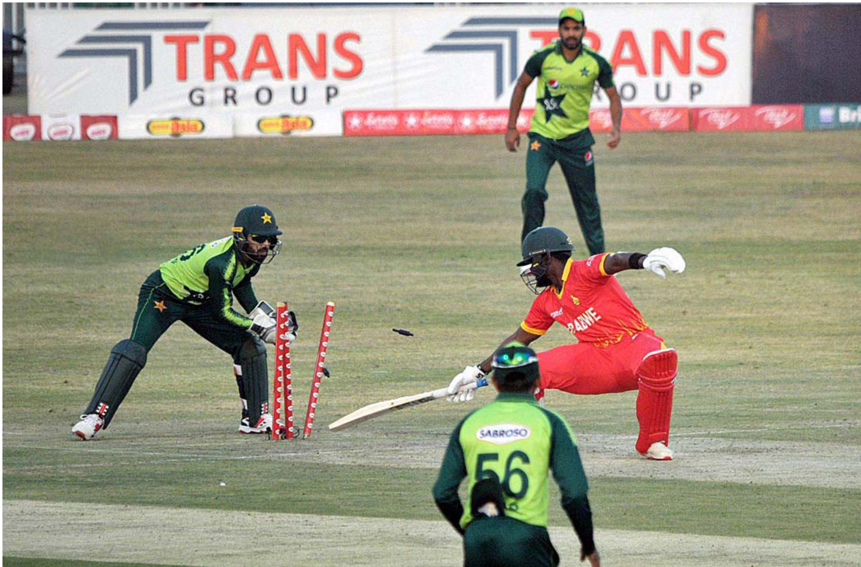
RAWALPINDI: A view of cricket match playing between Pakistan and Zimbabwe teams during 2nd T20 International (ODI) cricket match at Rawalpindi Cricket Stadium.

Underlining the complex geological and climatic conditions, as well as fragile ecological environment along the project line, the president called for leveraging the Chinese socialist system's advantage of concentrating resources to get things done to accomplish this historic task, which is arduous but glorious. The construction should be carried out in a scientific, safe and eco-friendly way, Xi added.