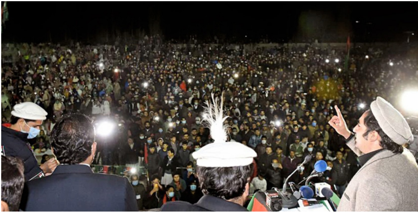
HUNZA: PPP Chairman Bilawal Bhutto Zardari addressing an election procession in Hunza.