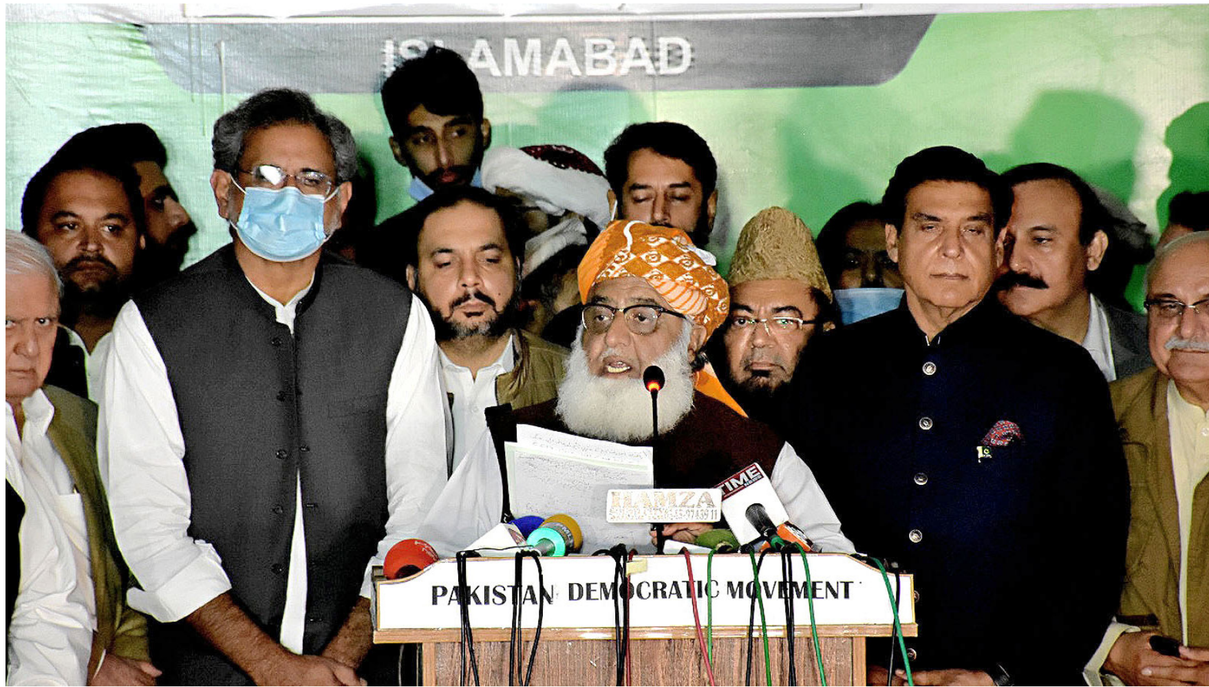
ISLAMABAD: Chief Pakistan Democratic Movement (PDM) Maulana Fazal ur Rehman addressing to the media after the PDM's meeting.

This would help to improve health indicators and also facilitate de-radicalization.