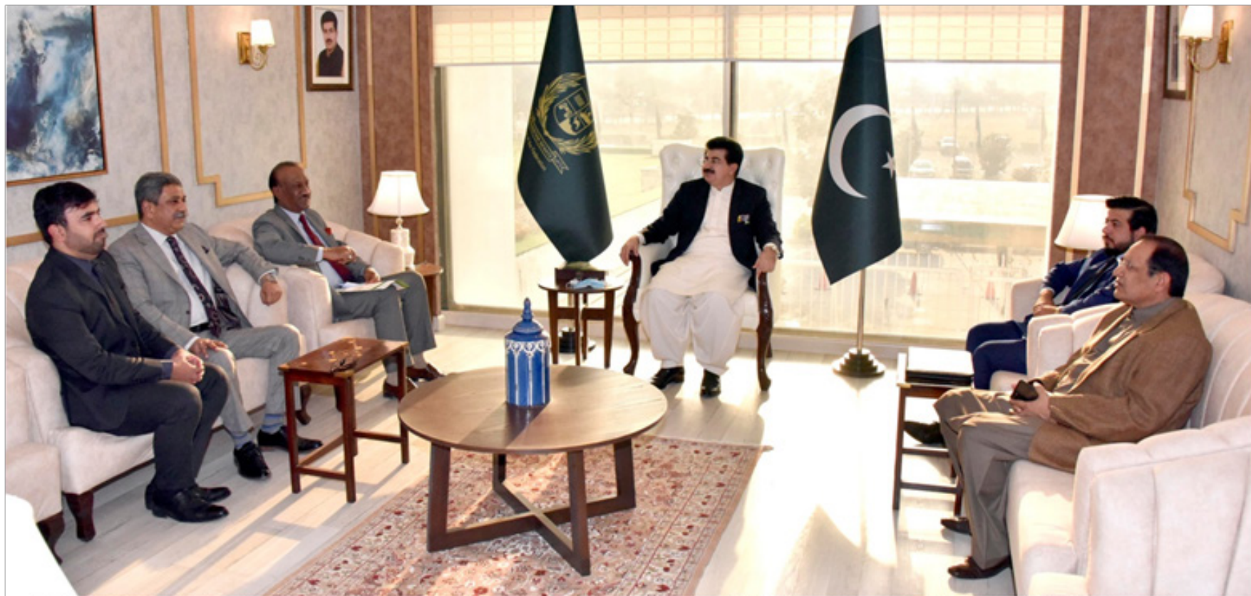
ISLAMABAD: Chairman Senate Muhammad Sadiq Sanjrani exchanging views with delegation of Rawalpindi chamber of commerce and industry (RCCI) at parliament house Islamabad.