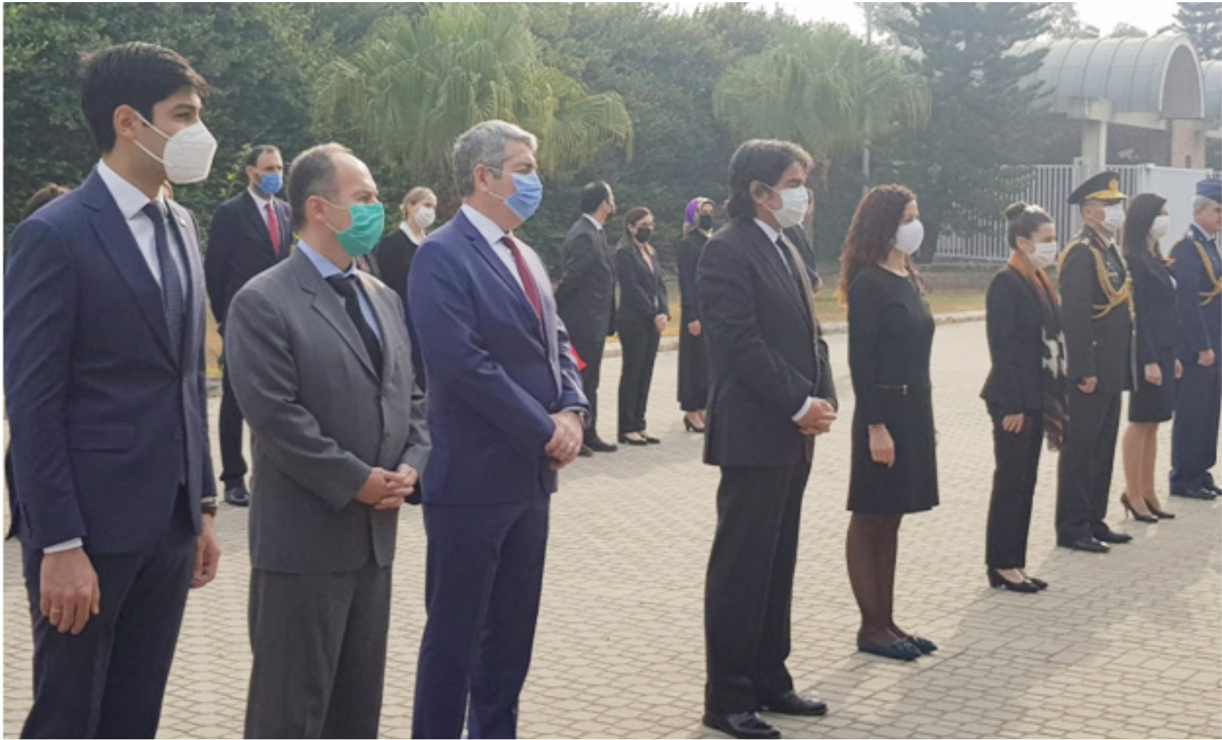
ISLAMABAD: A ceremony for November 10th, Commemoration Day of Atatürk was held at Turkish Embassy. The Turks commemorate Great Leader Atatürk with respect and gratitude. Ambassador of Turkey Ihsan Mustafa Yurdakul laid floral wreath on the occasion. - DNA

ISLAMABAD: The total active COVID-19 cases in Pakistan on Tuesday were recorded 20,045 as 1,637 more people tested positive for the deadly virus during the last 24 hours. Twenty three corona patients, 21 of whom were under treatment in hospital and two out of hospital died on Monday, according to the latest update issued by the National Command and Operation Centre (NCOC). No COVID-19 affected person was on ventilator in Azad Jammu and Kashmir (AJK), Gilgit Baltistan (GB) and Balochistan while 177 ventilators were occupied elsewhere in Pakistan, out of 1,855 ventilators allocated for COVID-19 patients. 31,904 tests were conducted across the country on Monday, including 12,343 in Sindh, 9,130 in Punjab, 4,037 in Khyber Pakhtunkhwa (KP), 5,065 in Islamabad Capital Territory (ICT), 528 in Balochistan, 370 in GB, and 431 in AJK. Around 319,431 people have recovered from the disease so far across the country making it a significant count with over 90 percent recovery ratio of the affected patients. Since the pandemic outbreak, a total of 346,746 cases were detected so far, including AJK 4,830, Balochistan 16,152, GB 4,378, ICT 22,110, KP 40,843, Punjab 107,329 and Sindh 150,834. - APP