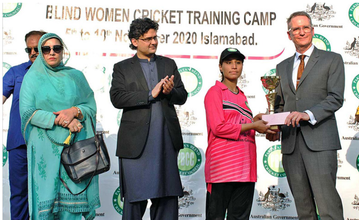
Two blind factory workers invented blind cricket

The Chairman of Pakistan Blind Cricket Council, Syed Sultan Shah, said, "Cricket for the blind is a highly competitive game which enables people with visual impairment to become people of vision - a vision of an accessible future full of exciting opportunities for all."