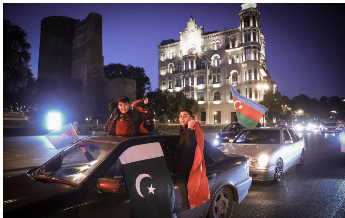
BAKU: Children are celebrating the national flag day of Azerbaijan and holding flags of Pakistan and Turkey to show solidarity.

brain consumes about 20 percent of the body's energy. Compared with the single group, the love group showed lower network segregation in their fMRI results. Brain connectivity refers to the efficiency of information transfer through the neural network. The "in-love" group showed decreased connectivity in the left angular gyrus, a hub of neural networks involving self-processing. Lower connectivity in angular gyrus may indicate that people in love pay less attention to themselves and more to their lovers. — APP