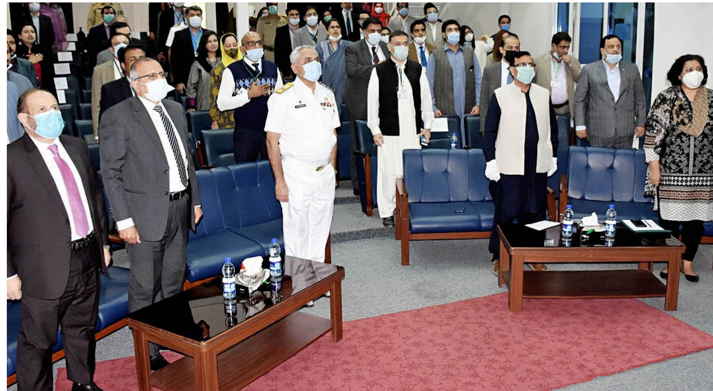
ISLAMABAD: Participants of National Media Workshop organized by National Defence University attending a briefing session on role of ministry of Information & Broadcasting at Information Service Academy.