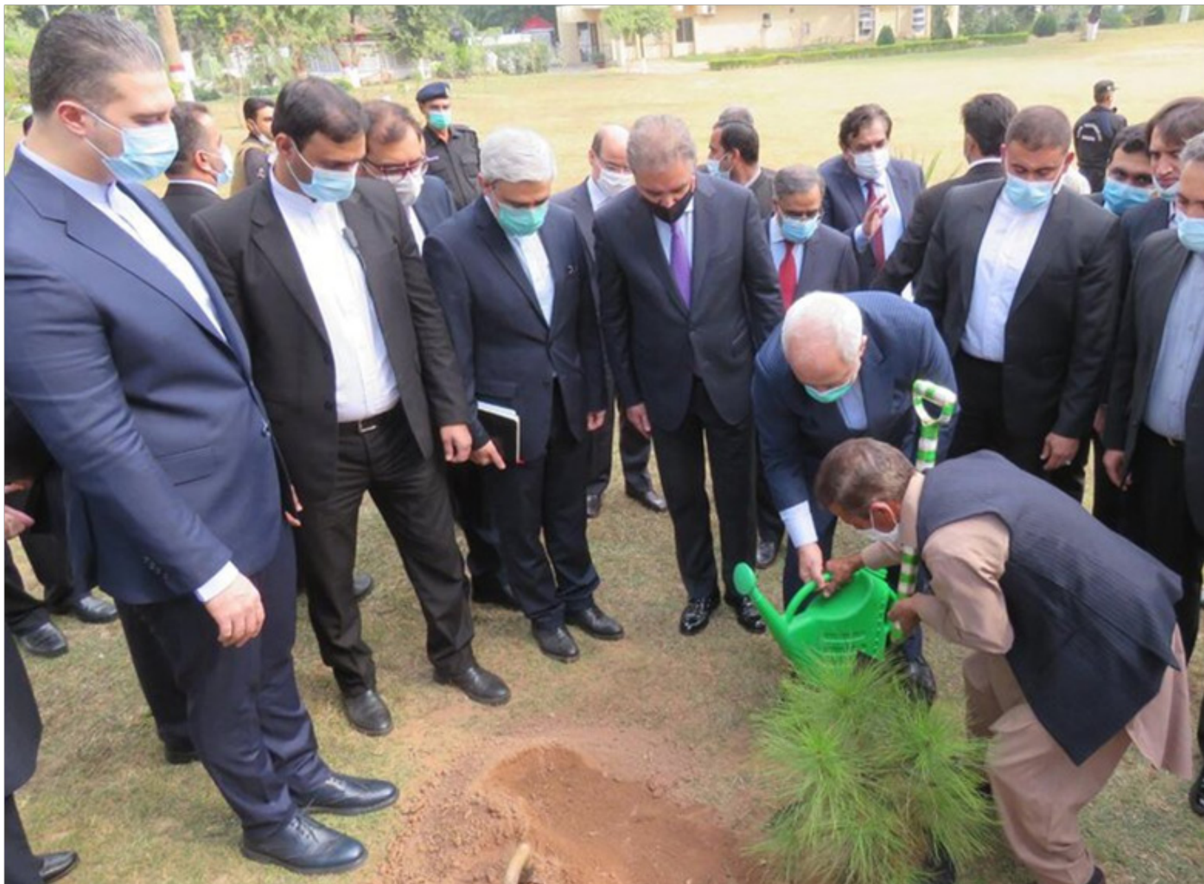
ISLAMABAD: Iranian Foreign Minister Dr. Mohammad Javad Zarif planting a tree at the Ministry of Foreign Affairs.

These issues are also found in text books, lesson material and other educational resources used for this event. Human rights activists also use this day as an opportunity to speak out on human rights laws, especially with regard to banning and punishing hate crimes and discrimination against minorities. In the workplace, special training programs, talks, or messages from workplace leaders about the importance of tolerance are utilized on this day. In 1996 the UN General Assembly invited member states to observe the International Day for Tolerance on November 16, with activities directed towards both educational establishments and the wider public (resolution 51/95 of 12 December).