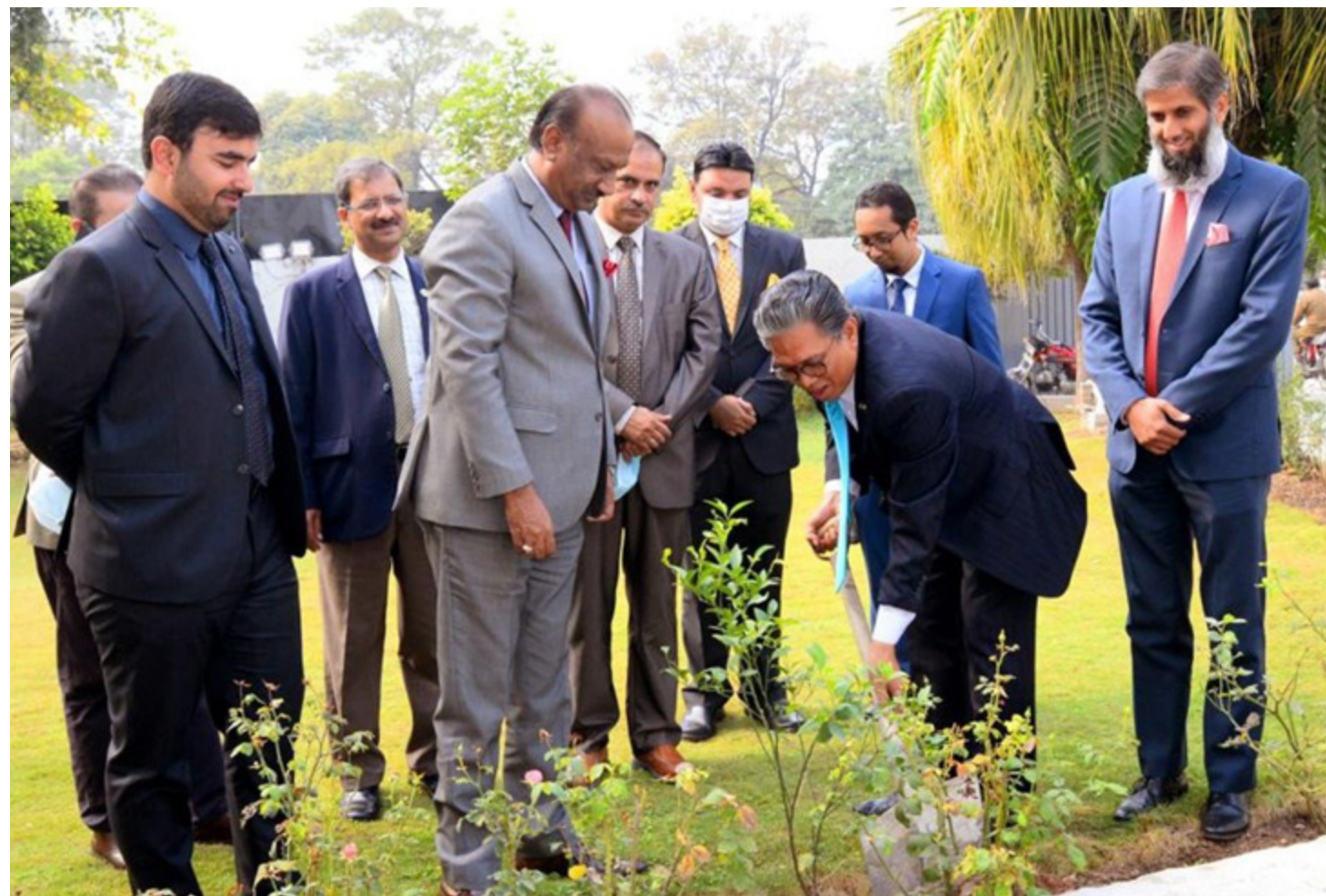
RAWALPINDI: The Malaysian High Commissioner Ikram Bin Muhammad Ibrahim planting a saplings the Rawalpindi Chamber of Commerce and Industry (RCCI). - DNA

ISLAMABAD: The Rawalpindi Chamber of Commerce and Industry (RCCI) is going to hold a three-day business conference titled "China Pakistan Economic Corridor (CPEC) Central Asia" in Gwadar from November 16 to 18. The conference would be attended by Chief Minister, Governor Balochistan, ministers, high government officials, foreign diplomats, and trade and industrial personalities. According to a RCCI official, the conference was aimed at deliberating progress on CPEC, promoting investment in Gwadar port city, boosting trade and exploring new trade opportunities with the Central Asian states under the umbrella of CPEC. He said that the CPEC was going to be prove as a game changer for Pakistan as well as the whole region and this would also determine ways and means to enhance co-operation with the Central Asian States. - APP