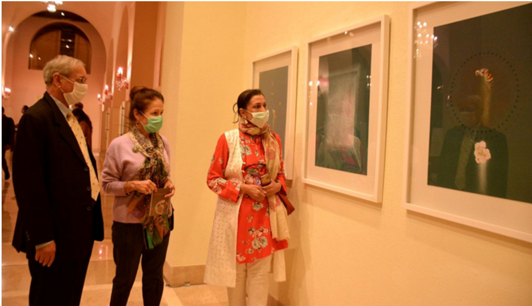
ISLAMABAD: Visitors taking keen interest in paintings exhibited in "silver lining" organized at Satrang gallery.

The officials took the car in custody and after completing formalities, the car was handed over to its owner in presence of Local Police.