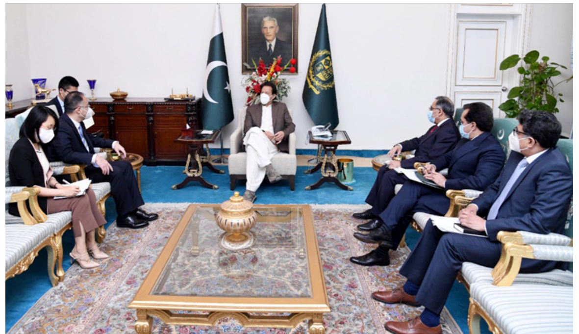
ISLAMABAD: Ambassador of China to Pakistan, Nong Rong calls on Prime Minister of Pakistan Imran Khan.