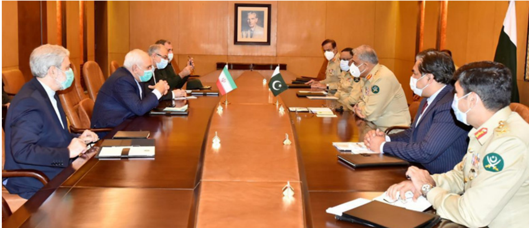
RAWALPINDI: Javad Zarif, Foreign Minister of Iran calls on Chief of Army Staff General Qamar Bajwa. DG ISI Gen. Faez Hameed is also present.

ISLAMABAD: The Federal Board of Revenue (FBR) Wednesday launched the Maloomat TaxRay Application to facilitate the taxpayers' and general public in filing tax returns correctly. This application has been uploaded on the website of FBR, according to a press statement issued by the board here. Taxpayers' and general public can get the information about their assets and withholding deductions through the application. The information provided by this application would help the taxpayers in filing their annual tax returns correctly, it added.