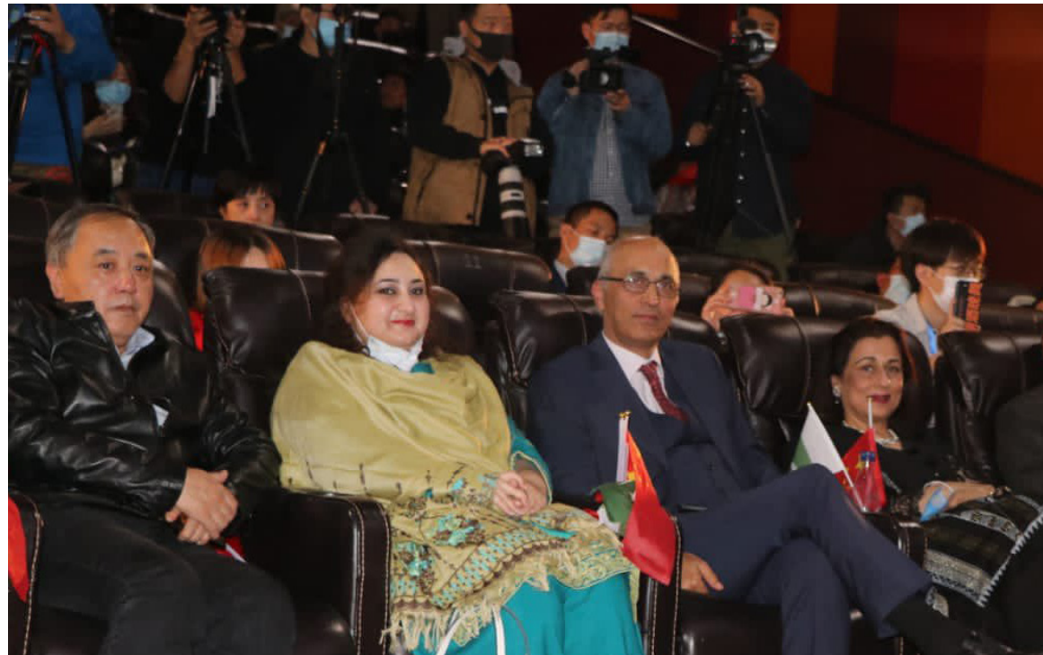
BEIJING: Premier of Pakistani film Parwaz Hai Junoon was held at Wanda cinema Beijing. Pakistan ambassador to China, MoINUl Haq was also present on the occasion.

ber of military personnel members, who died fighting off the attacks of the Armenian Armed Forces. The conflict between the two South Caucasus countries began in 1988 when Armenia made territorial claims against Azerbaijan. As a result of the ensuing war, Armenian Armed Forces occupied 20 percent of Azerbaijan, including the Nagorno-Karabakh region and seven surrounding districts. The 1994 ceasefire agreement was followed by peace negotiations.