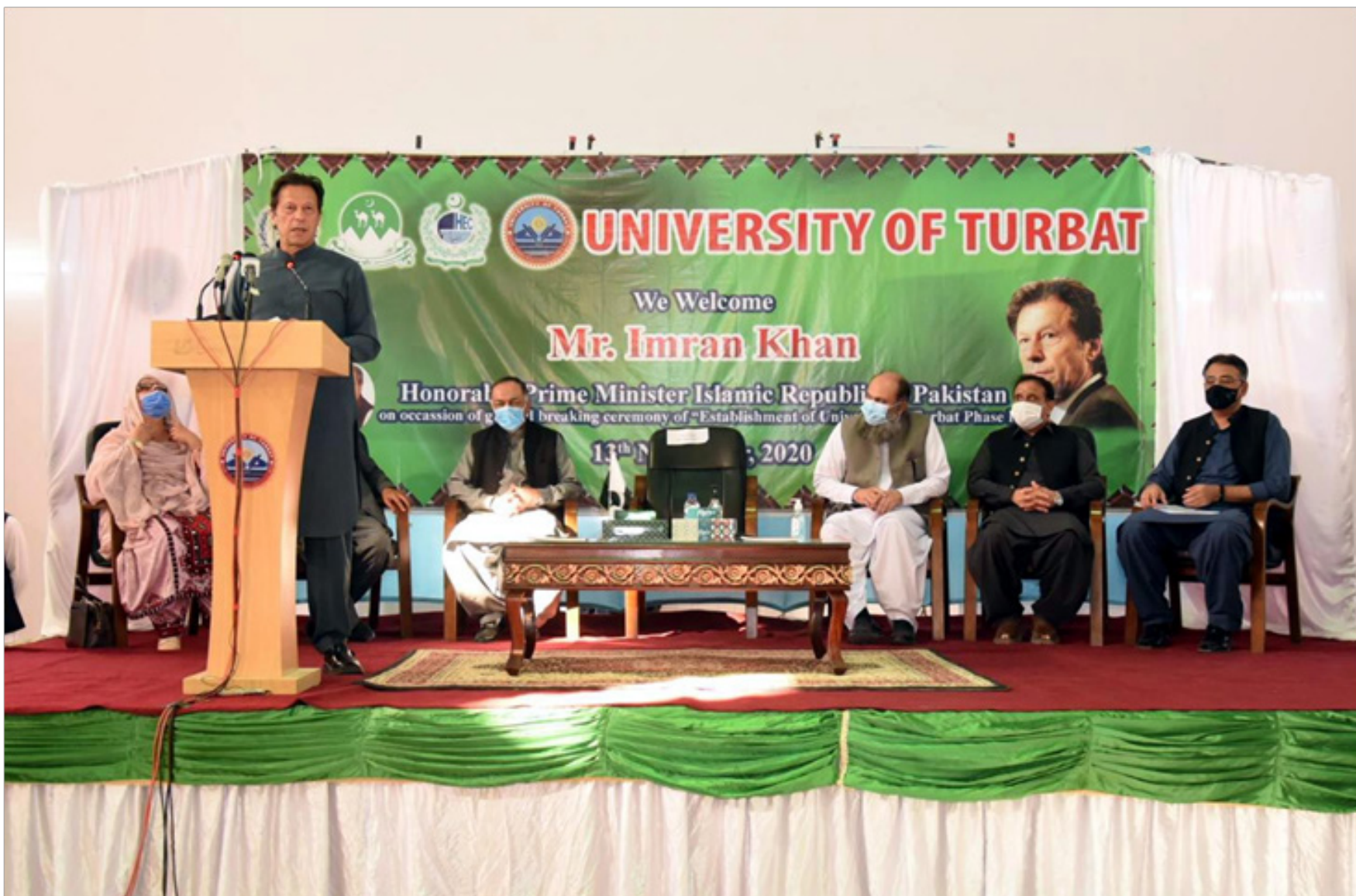
TURBAT: Prime Minister Imran Khan addressing students at University of Turbat.