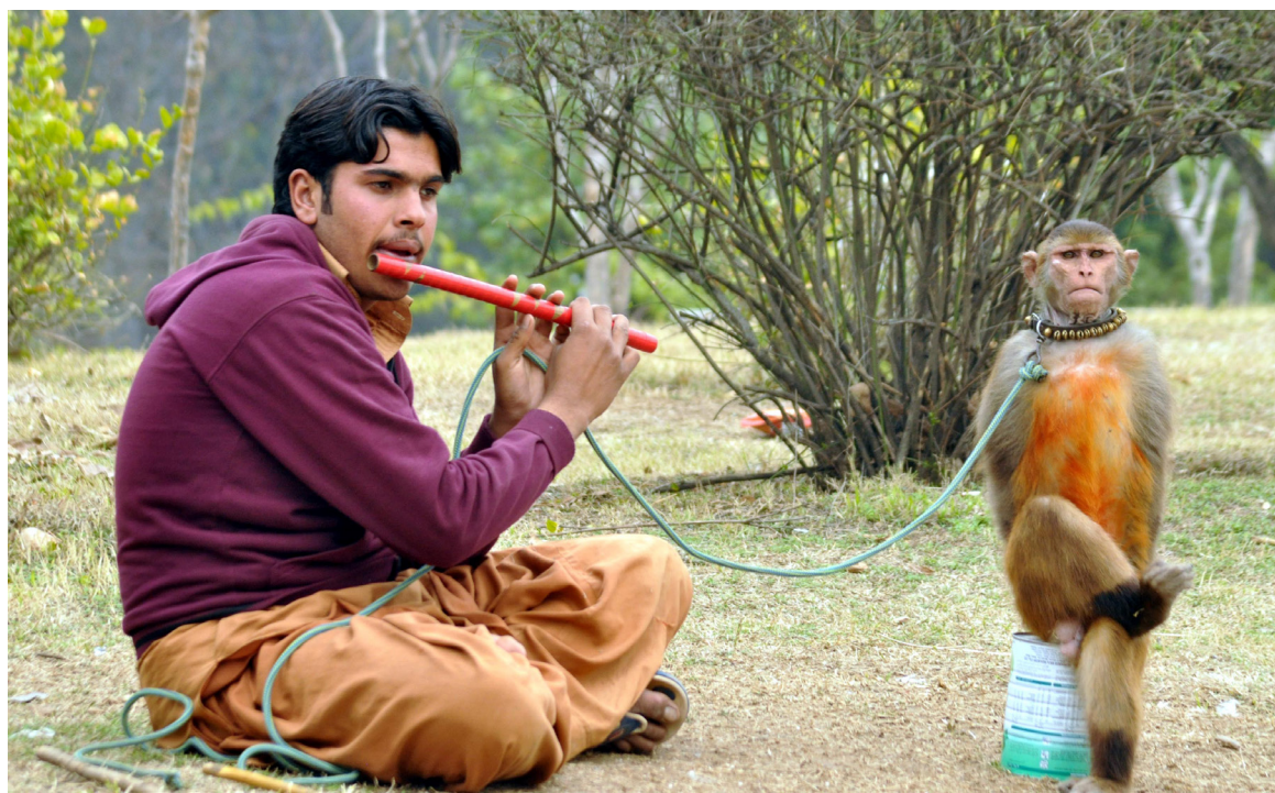
ISLAMABAD: A monkey presenting antics to attract customers' attention. Due to coronavirus parks in the Capital have been closed due to which business of such people has badly affected. – DNA

selected rice varieties ranges from 80 to 120 mounds per acre. Dr Ali, explained that with extra long grain there are good chances to capture the export market of rice internationally. This project is very important to rapidly enhance the yield of rice as desired in Primer Minister Rice productivity enhancement Initiative. – APP