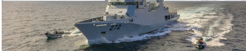
Newly Commissioned Pakistan Navy Ship TABUK operating at Sea. Inset is the handing/ taking over signing ceremony between Pakistan Navy and DAMEN Shipyards Officials onboard PNS TABUK (F-272) held at Constanta, Romania

perform a variety of maritime operations in a complex maritime environment and can em-