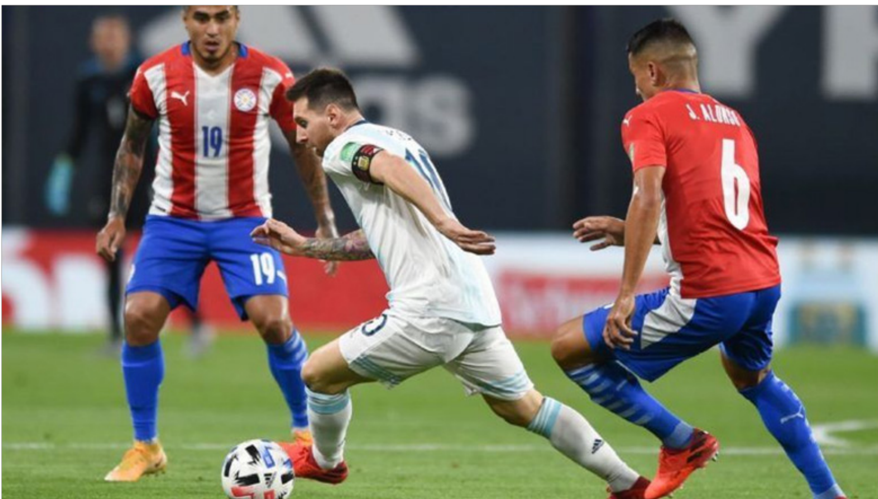
BUENOS AIRES: Lionel Messi of Argentina controls the ball as Paraguay players chase him.

LONDON: Rafael Nadal says he is determined to improve his poor record on indoor courts as he bids to win the ATP Finals for the first time in his illustrious career. Just one of the Spaniard's 86 singles titles has come on an indoor hard court, back in Madrid in 2005. Nadal has earned a berth at the end-of-season ATP Finals every year since that year but has been forced to withdraw on six occasions. Speaking Friday ahead of this year's tournament at London's O2 Arena, he said there were a number of factors for his failure to shine indoors, including fatigue at end-of-season events and a preference for other surfaces. "We can find excuses or reasons but at the end of the day the numbers are the numbers," Nadal said. "I think I have played less indoors than in other places without a doubt." The second seed, who drew level with Roger Federer on 20 Grand Slams by winning last month's French Open final, said his game was not ideally suited to fast courts.