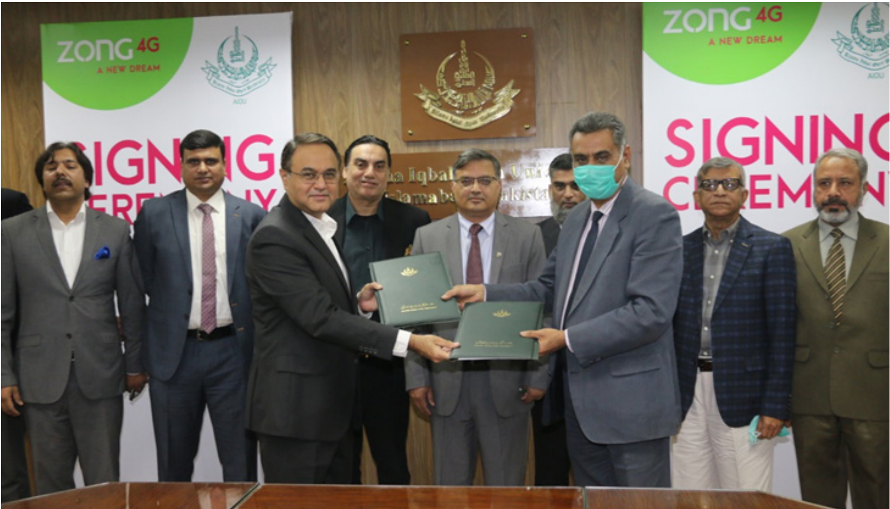
ISLAMABAD: Officials from Allama Iqbal Open University and Zong exchanging memorandum of understanding (MoU).