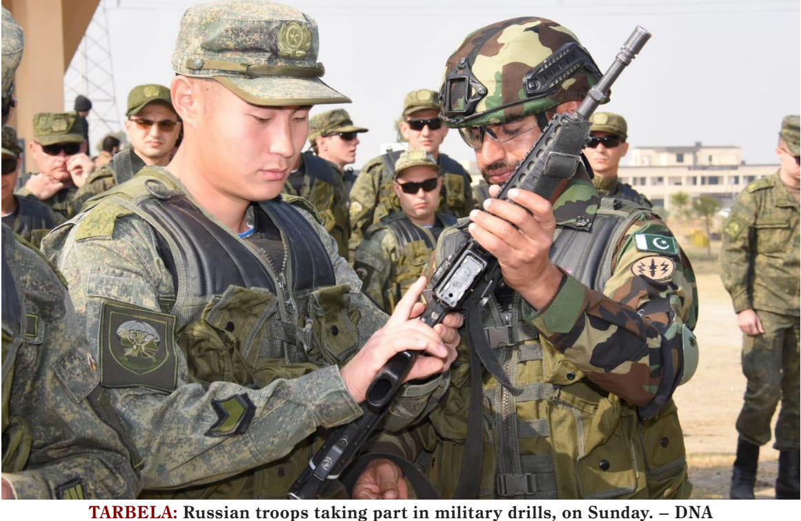
(Another picture on page 7)

recorded in country since the eruption of the contagion, including 2,738 Sindh among 12 of them died in hospital and four out of hospital on Saturday, 2,471 in Punjab eight of them died in hospital and one out of hospital on Saturday, 1,309 in KP four of them died in hospital on Saturday, 255 in ICT among two of them died in hospital on Saturday, 156 in Balochistan one of them died in hospital on Saturday, 93 in GB and 119 in AJK. A total of 4,921,050 corona tests have been conducted so far, while 735 hospitals are equipped with COVID facilities. Some 1,569 corona patients were admitted in hospitals across the country. - APP