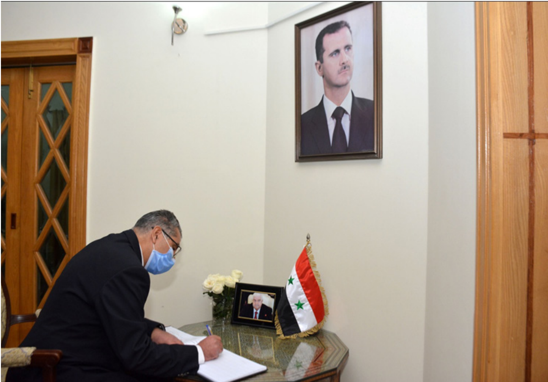
ISLAMABAD: Ambassador of Tunisia signing the condolence book on the sad demise of foreign minister of Syria. Syrian embassy opened the book. — DNA

ABBOTTABAD: Hazara traffic police Wednesday booked 1732 underage motorcyclists during a massive drive against underage drivers, one wheeling and motorcyclists without a helmet. On the directives of Deputy Inspector General (DIG) Police Hazara region Qazi Jameel ur Rehman traffic police of 8 districts in the region have started a massive campaign, seized 1732 motorcycles issued them challan and also got written surety bond from their parents that they would never use motorcycle till legal age. Traffic police while taking action against speeding issued challans to 407 riders, also booked 137 one wheeler and fined 1620 motorcyclists without a helmet. DIG Hazara in a message to the parents and motorcyclists said that bike is a very useful but also dangerous, without safety gears motorcycling is risky for life, he also directed District Police Officers (DPOs) to call the violators parents at their office get written surety bond for strict enforcement of the underage driving ban and inform them next time police will take action against them. — APP