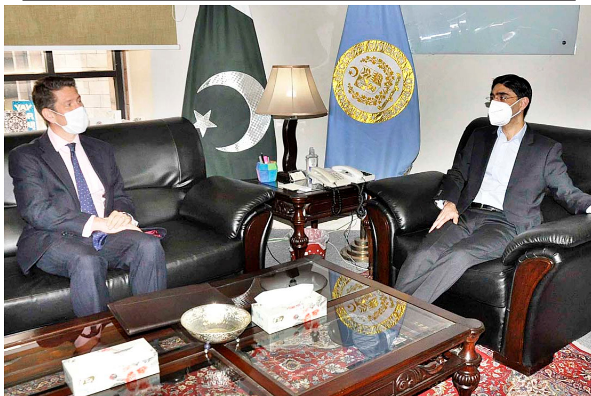
ISLAMABAD: Special Assistant to Prime Minister for National Security Division Dr. Moeed Yousuf meeting with British High Commissioner, at National Security Division.

WASHINGTON: American pharmaceutical company Pfizer announced on Wednesday that its COVID-19 vaccine has demonstrated 95% efficacy in late trials. The company also said that it wants the US Food and Drug Administration (FDA) to approve the vaccine on an emergency basis. The company had previously produced a vaccine which was 90% effective. According to a statement issued on the company's website, the vaccine - which Pfizer has developed in collaboration with German company BioNTech SE - turned out to be 95% effective against COVID-19, 28 days after its first dose was administered to volunteers. The statement added that the efficacy of the vaccine was found to be consistent across age, gender, race, and ethnicity demographics. The vaccine also proved to be effective for adults over the age of 65 years. Pfizer/BioNTech plan to submit the vaccine to the FDA for Emergency Use Authorisation (EUA) and share data with other regulatory agencies around the globe. The statement said that the companies expect to produce up to 50 million vaccine doses this year on a global level, adding that they would produce another 1.3 billion doses by the end of 2021. Two days ago, another American company Moderna claimed that its coronavirus vaccine is nearly 95% effective in protecting people from the potentially-deadly infection.