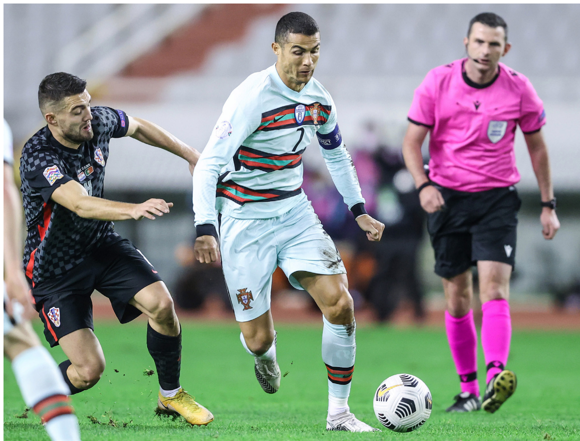
Cristiano Ronaldo of Portugal competes during the UEFA Nations League football match against Croatia at Poljud Stadium in Split, Croatia.

he was savagely beaten in detention. No sanctions announcement was expected immediately at Thursday's ministers' meeting because it is being held by videolink, owing to coronavirus measures, which weakens its decision-making authority. But sources said the ministers could launch a procedure with a view to having sanctions adopted unanimously by the 27 member states. The existing sanctions by the EU prohibit the Belarusian officials getting visas and freezing their assets in the bloc. But "nothing has changed on the ground", a European diplomat said. "Pressure has to be maintained and political push is needed." Belarusians continue to demonstrate against Lukashenko despite repression and intimidation by plainclothes police and security forces. - APP