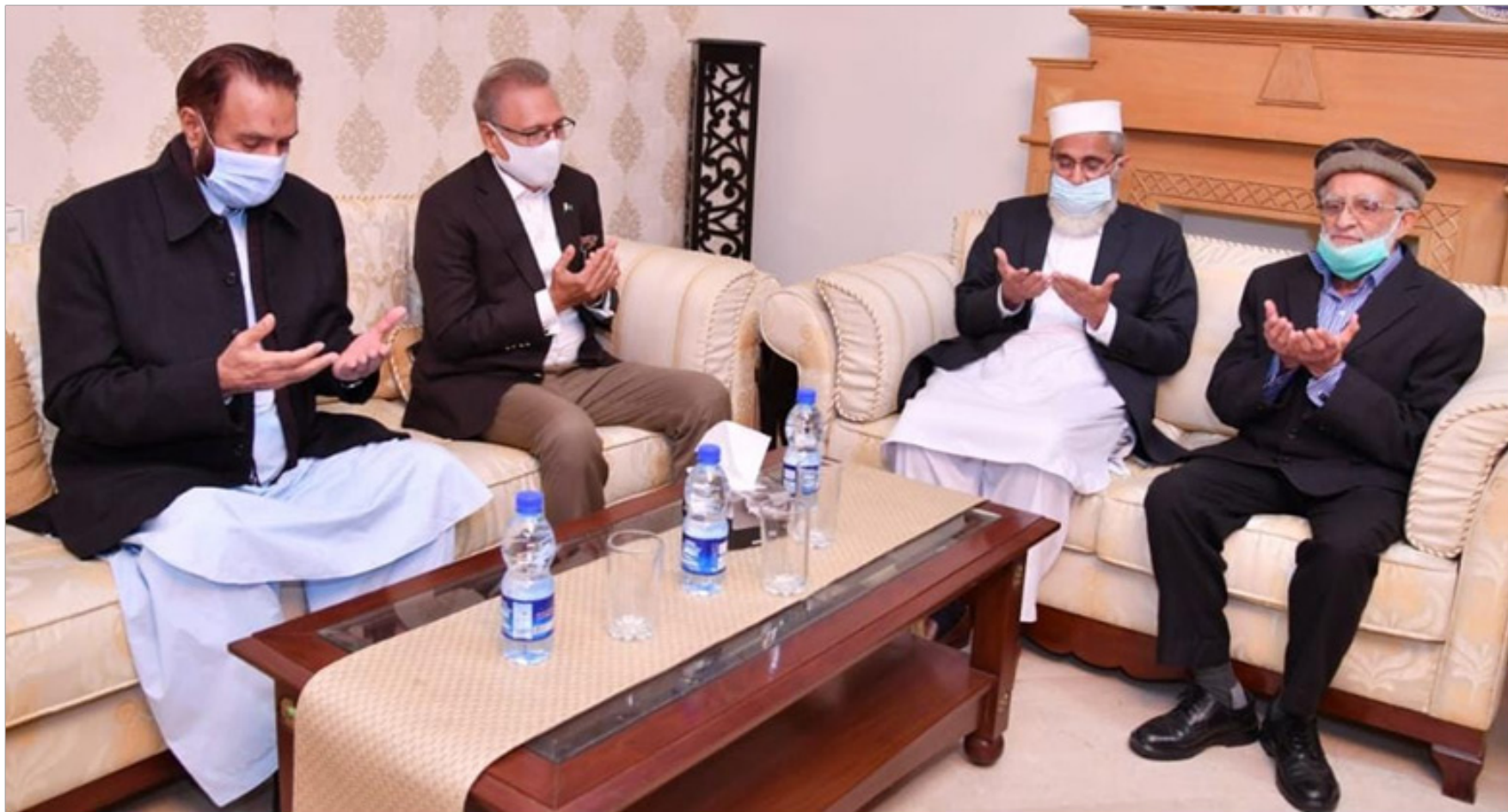
ISLAMABAD: President Dr. Arif Alvi calls on Senator Sirajul Haq Ameer Jamaat-e-Islami to offer condolences on the death of his mother.