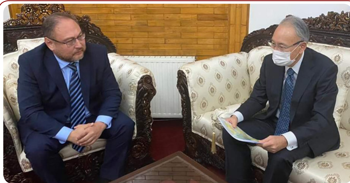
ISLAMABAD: Ambassador of Kazakhstan to the Islamic Republic of Pakistan A. Rakhmetullin met with Japanese Ambassador to Pakistan Matsuda Kuninori. During the meeting, issues of strengthening trade and economic cooperation between the countries of the region, as well as the situation in Afghanistan and its impact on economic processes in the regions of Central and South Asia were discussed. – DNA

cities. Under Waseela taleem programme, as many as 83000 children would be given free education and the government would also pay stipend of Rs 1500 to boy and Rs 2000 to girl's parents on monthly basis. Asad Umar maintained that in health sector, 200 health centers would be up-graded. Similarly he said, 35000 young people of the area would be given training to earn as a freelancer. He informed that the area was suitable for olive and date cultivation so the government would establish an olive processing unit and three date processing units to make the local farmers able to add value to their produce. – APP