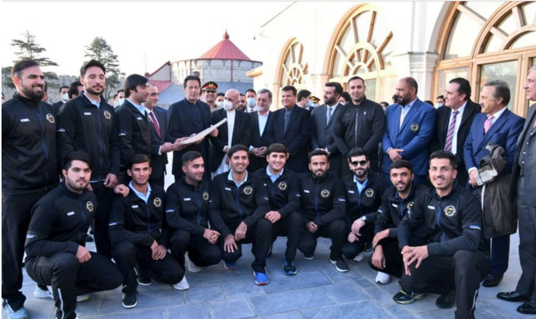
KABUL: Afghan National Cricket Team present singed bat and ball to Prime Minister of Pakistan Imran Khan.

Minister Asad Umar welcomed the ambassador on his new assignments and extended best wishes for his endeavors. He said that China-Pakistan relationship extended beyond the government to government cooperation as the bond between the people of the two countries was also very strong. The Chinese ambassador thanked the minister and said that the Chinese side also highly values the relationship and it would be his endeavor to build on the work done in the last many years.