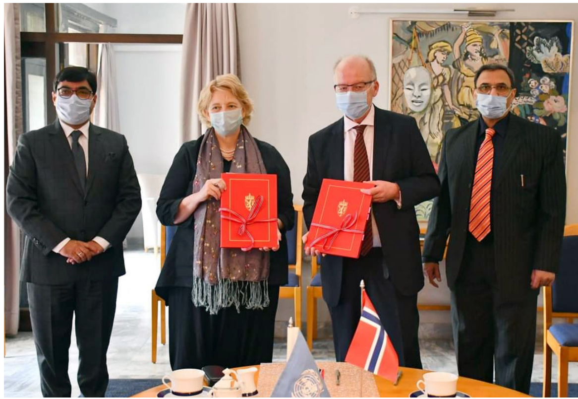
ISLAMABAD: Ambassador of Norway Kjell-Gunnar Eriksen and representative of UNICEF exchange documents after signing financial assistance documents for girls education in Pakistan.

for conflict prevention in the region and relentless support provided in Afghan Peace Process. The dignity also assured of US continued assistance for the common cause of peace in Afghanistan.