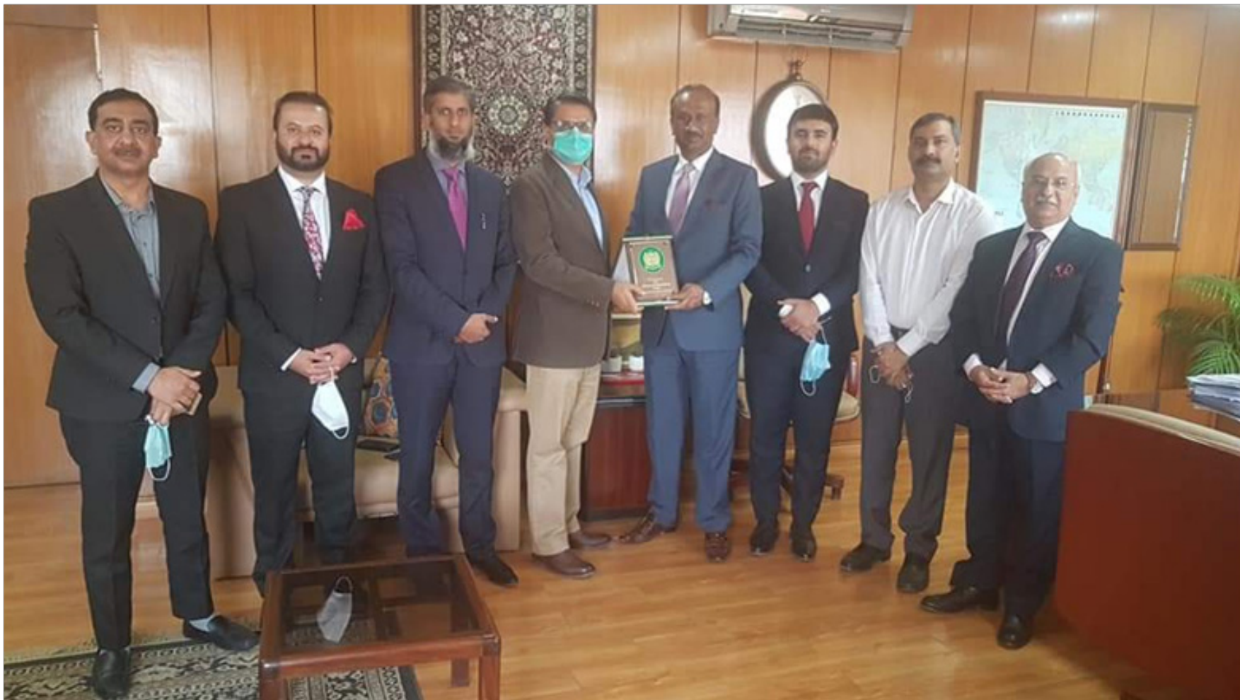
KARACHI: RCCI delegation in a group photo after the meeting with Secretary TADP.

RABAT: Total coronavirus cases in Africa have surpassed the two million mark despite a slow addition of reported infections compared with other regions around the world, the African Centres for Disease Control and Prevention said. With the African Union's health body reporting 2,013,388 cases on Thursday, the continent now represents less than 4 percent of the world's total cases, which many experts believe to be an undercount. They believe many COVID-19 infections and related deaths in Africa are likely being missed as testing rates in the continent of about 1.3 billion people are among the lowest in the world, and many deaths of all types go unrecorded. Africa has reported less than 48,000 coronavirus deaths so far. Countries such as Sudan, Chad, and Egypt have reported the highest death rates across the continent at 7.81 percent, 6.28 percent and 5.82 percent respectively. South Africa has the continent's highest number of reported COVID-19 cases at less than 750,000, with a death rate of 2.71 percent, according to a Reuters tally. With the continent representing nearly 16.7 percent of the world's population, about 15 coronavirus cases are reported for every 10,000 people. Africa's lower number of infections and deaths compared with Europe, South America and the United States can in part be attributed to several factors aside from a likely undercount.