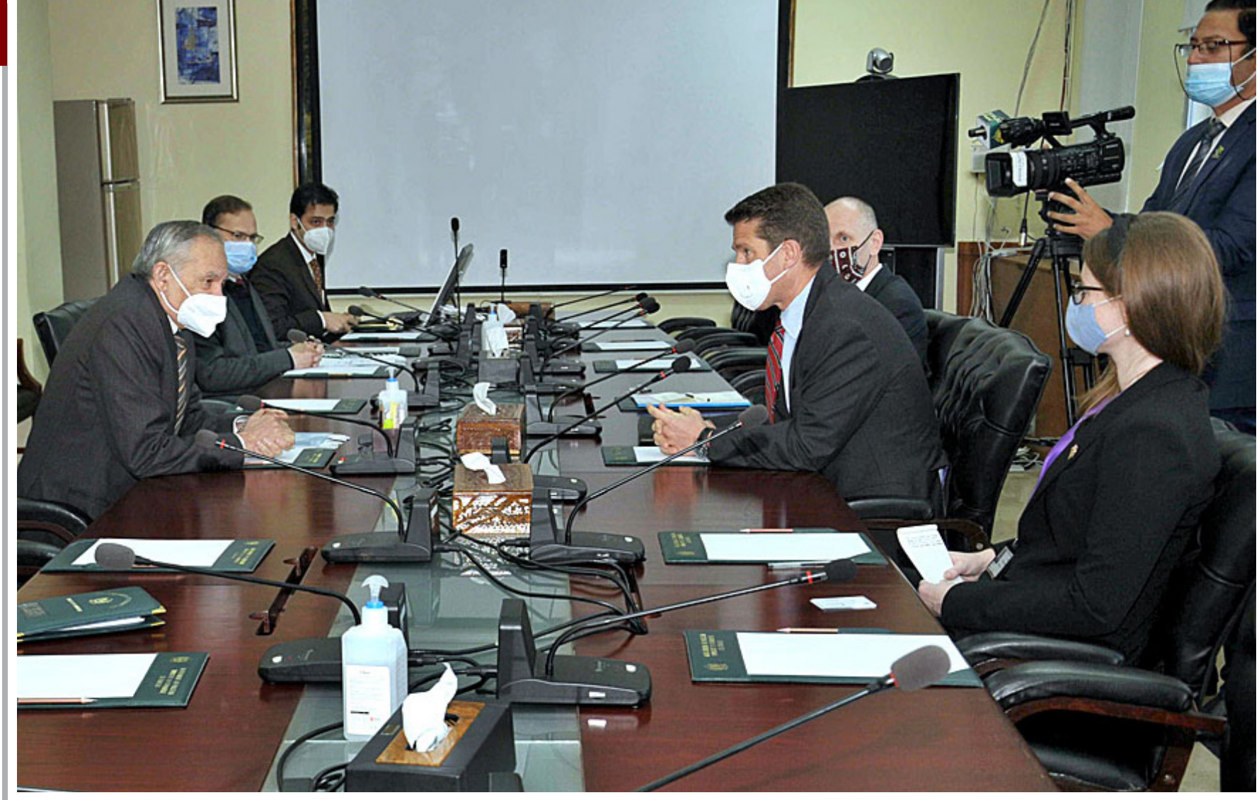
ISLAMABAD: A monkey presenting antics to attract customers' attention. Due to coronavirus parks in the Capital have been closed due to which business of such people has badly affected.

They stressed to practically follow the Quran and Sunnah which offered solution to all the problems. – APP