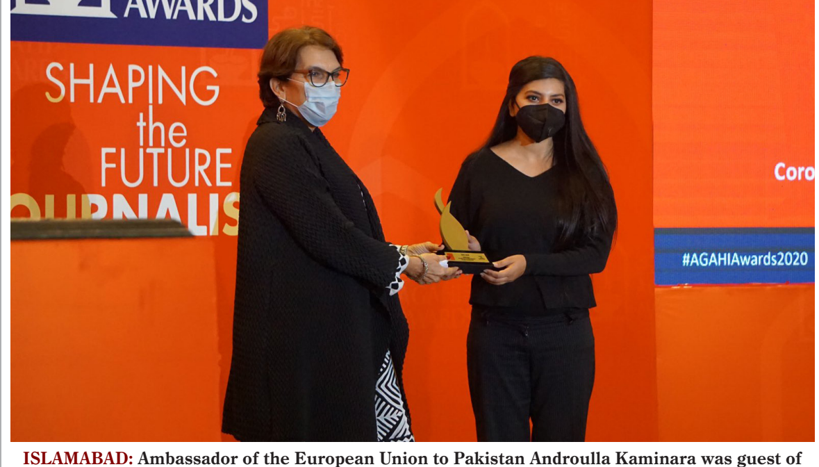
honour at the Agahi Awards 2020 & presented the award for innovation in journalism. – DNA

The people have lodged 2.7 million complaints with 94% resolution and a total of 617,000 complainants have posted satisfactory feedback. – APP