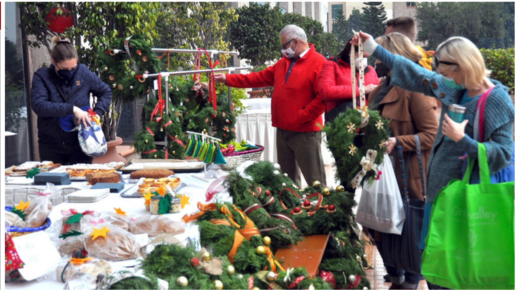
ISLAMABAD: Visitors taking interest in various items displayed on the occasion of Islamabad Foreign Women Association (IFWA) Charity bazaar held at Islamabad Serena Hotel on Sunday.

ISLAMABAD: Three day long "Winter Food festival" will be held from November 27 to 29, aiming to provide healthy environment and different types of food to citizens of twin cities at Ayub Park. Multiple cuisines will be placed including desi, chinese, continental, italian and other types of food. The festival will include variety of events including fashion Show, cultural dances musical concerts, stalls, fun activities and much more. It would be the biggest festival of the year to enthrall the people of twin cities with so much enjoyment and pleasure, an organizer told on Monday. He said that it was a family ambiance event that has specifically been arranged to enhance the cuisine and cultural activities and provide healthy entertainment to citizens of Rawalpindi and Islamabad.- APP