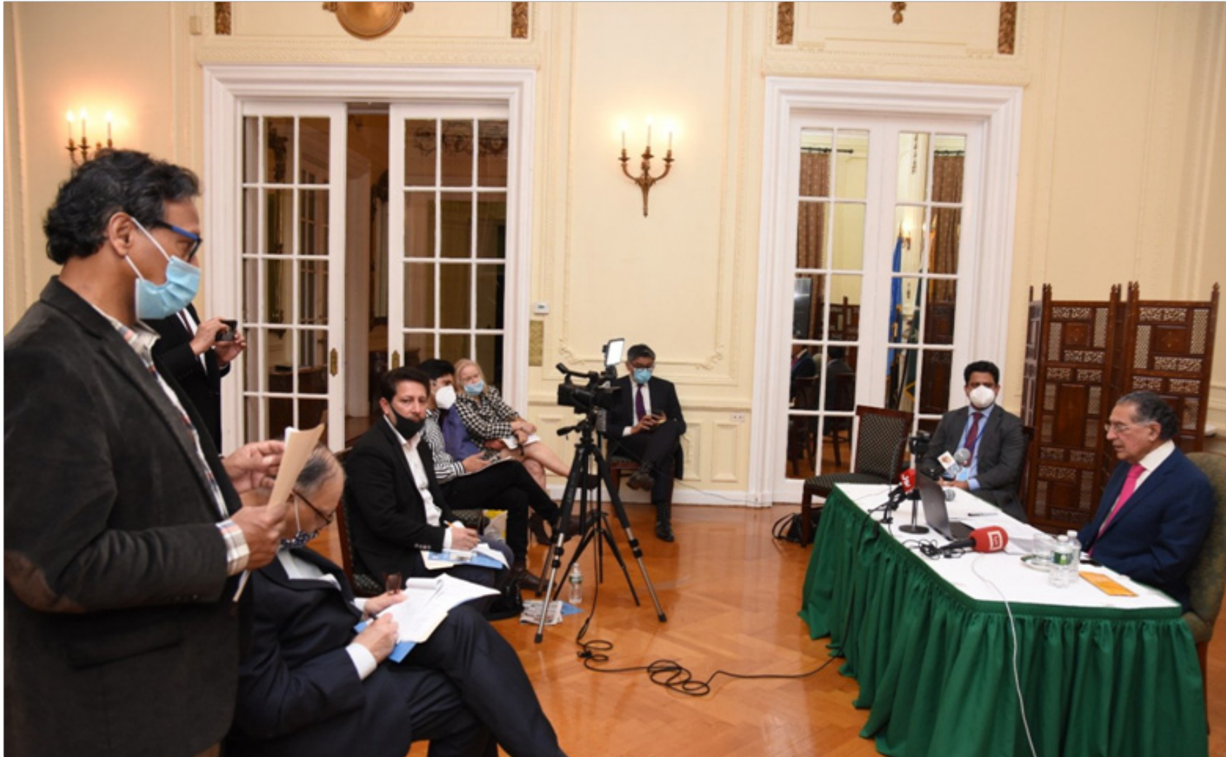
NEW YORK: Ambassador Munir Akram, permanent representative of Pakistan to the United Nations holding press briefing on Pakistan's dossier on Indian sponsored terrorism.

DAMASCUS: Syria's military said Israeli warplanes carried out airstrikes to the south of the capital late Tuesday, state media reported. The Syrian media said the attack was directed from the occupied Syrian Golan Heights against a mountain, adding property damage occurred as a result. Israel has occupied most of the Syrian Golan Heights since the 1967 Middle East War. Since the beginning of the Syrian crisis in 2011, Israel has carried out hundreds of airstrikes against targets in Syria, including against military sites of the Bashar al-Assad regime and Iranian-backed groups. Syria has been locked in a vicious civil war since early 2011, when the Assad regime cracked down on pro-democracy protests with unexpected ferocity. Since then, hundreds of thousands of people have been killed and more than 10 million others displaced, according to UN officials.