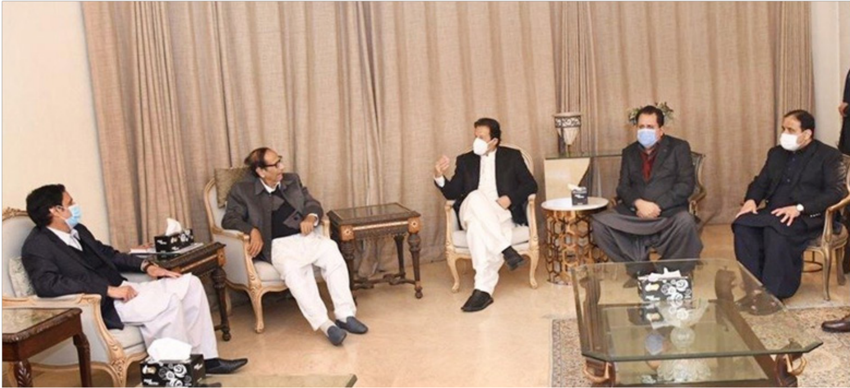
LAHORE: Prime Minister Imran Khan has visited the residence of senior political leader Chaudhary Shujaat Hussain in Lahore and inquired about his health and prayed for early recovery.