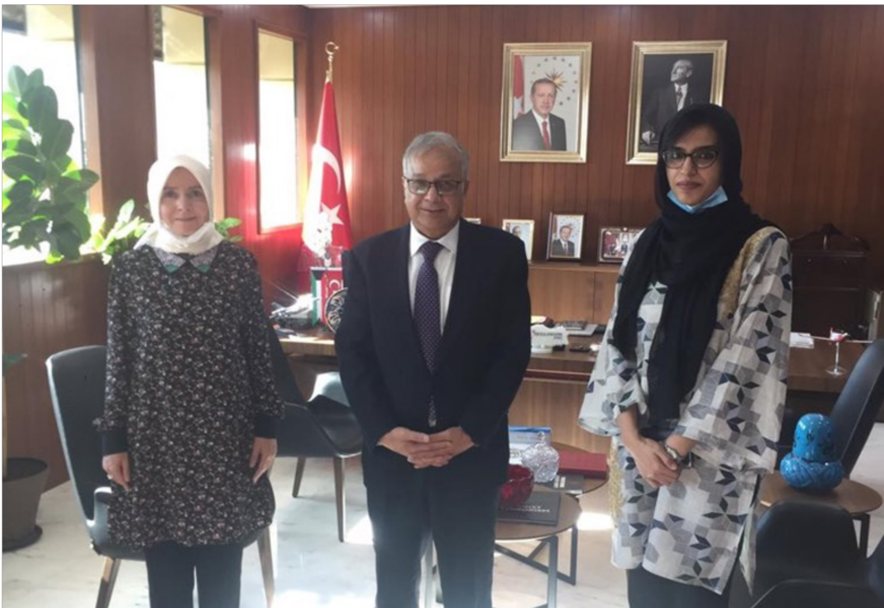
KUWAIT CITY: Ambassador of the Pakistan to Kuwait Syed Sajjad Haider visited Turkish embassy and met with ambassador of the Republic of Turkey to Kuwait Ayşe Hilal Sayan. — DNA

"New anti-epidemic measures are coming into force from November 27 until December 21," Health Minister Kostadin Angelov told a news conference after a government meeting early Wednesday. Cafes and restaurants had remained open even as infection and death rates peaked over the past two weeks, but they will now close along with casinos, fitness studios and shopping centres. Universities and schools will fully switch to distance learning and kindergartens will close. Theatres will be allowed to operate at 30 percent capacity, while restaurants will only be able to sell takeaways. Churches and other places of worship will however stay open. Unlike during Bulgaria's tough spring lockdown, the government will not shut public parks and gardens or limit travel. — APP