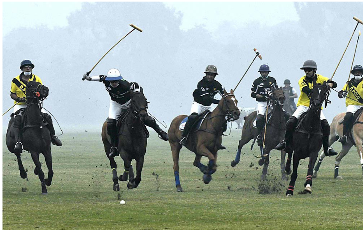
LAHORE: Players struggling to get hold on the ball in a match between Samba Bank and Pricemeterpk played at Aibak Ground Polo Club as part of Happy Cow Polo for Peace-II for Pakistan Polo Cup.

won the 1986 World Cup, producing a series of sublime individual performances to lead his team to glory. In a statement on Twitter, the Argentine Football Association expressed "its deepest sorrow for the death of our legend", adding: "You will always be in our hearts." Maradona played for Barcelona and Napoli during his club career, winning two Serie A titles with the Italian side. Maradona scored 34 goals in 91 appearances for Argentina, representing them in four World Cups. He led his country to the 1990 final in Italy, where they were beaten by West Germany, before captaining them again in the United States in 1994, but was sent home after failing a drugs test for ephedrine.