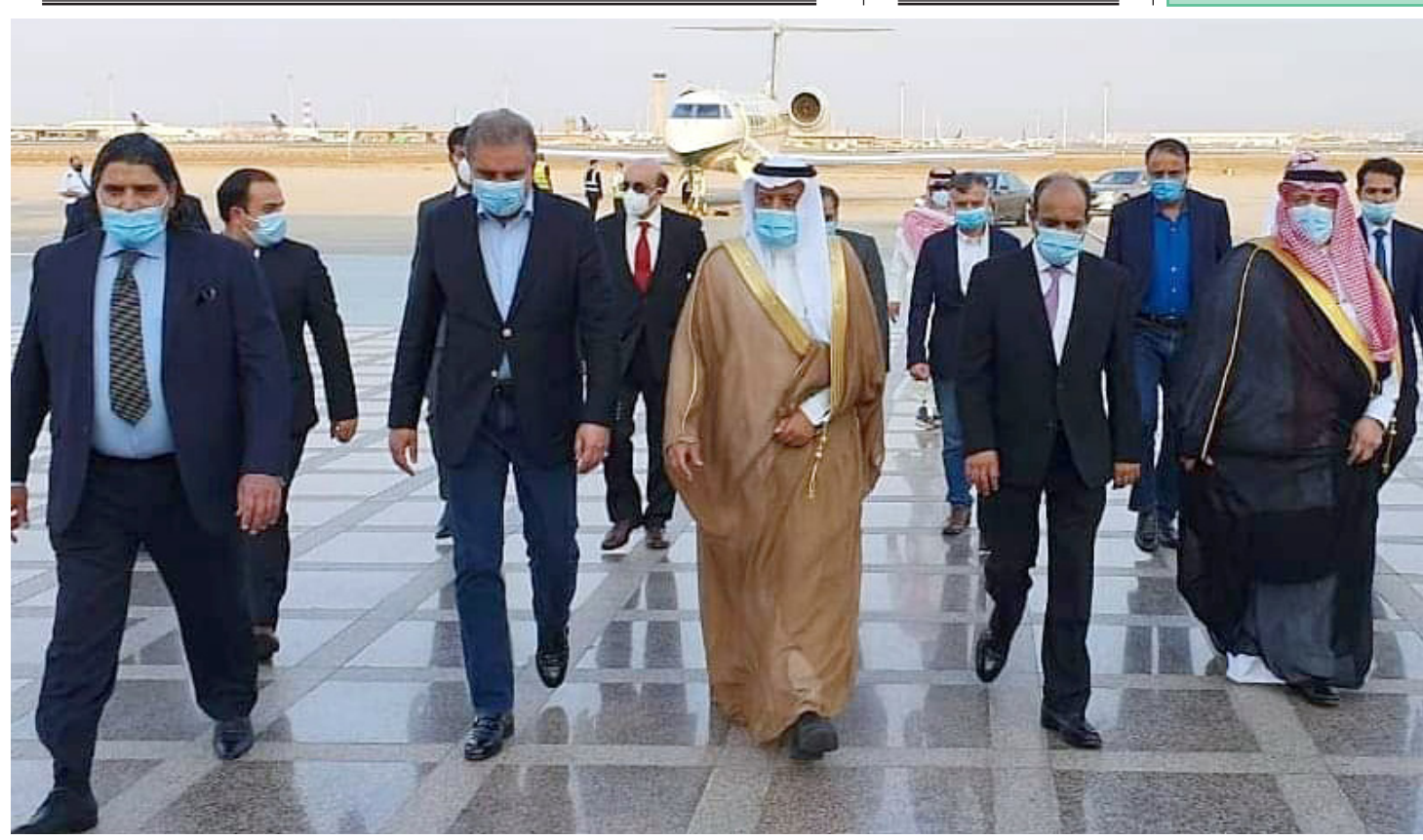
JEDDAH: Foreign Minister Shah Mahmood Qureshi made a stopover in Jeddah en route to Niger, where he heading to attend OIC conference.