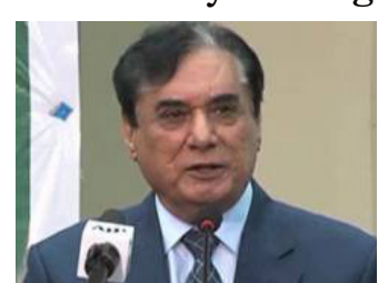
of authority, money laundering and cheating the people at large cases. He said NAB has received

years performance of bureau, he said that the bureau has put its energies together to take the under trial cases to logical conclusion by setting aside political influence pressure. Chairman said encouraging results of the policy of awareness, prevention and enforcement has already started pouring in. NAB has concentrated on pursuing corruption, misappropriation in government funds, abuse